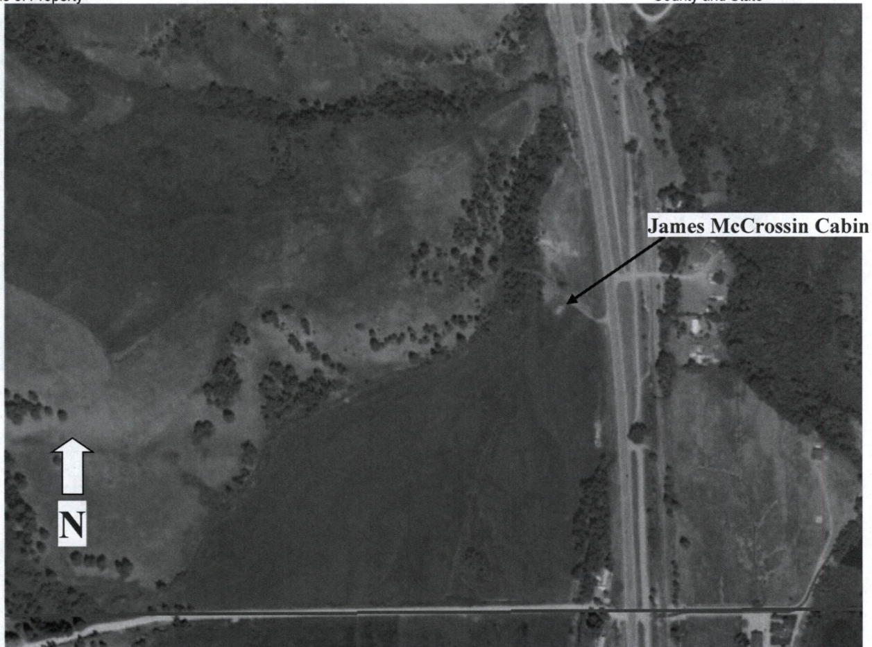
Aerial view of the location of the James McCrossin Cabin. Map created using the Digital Atlas October 8, 2019.