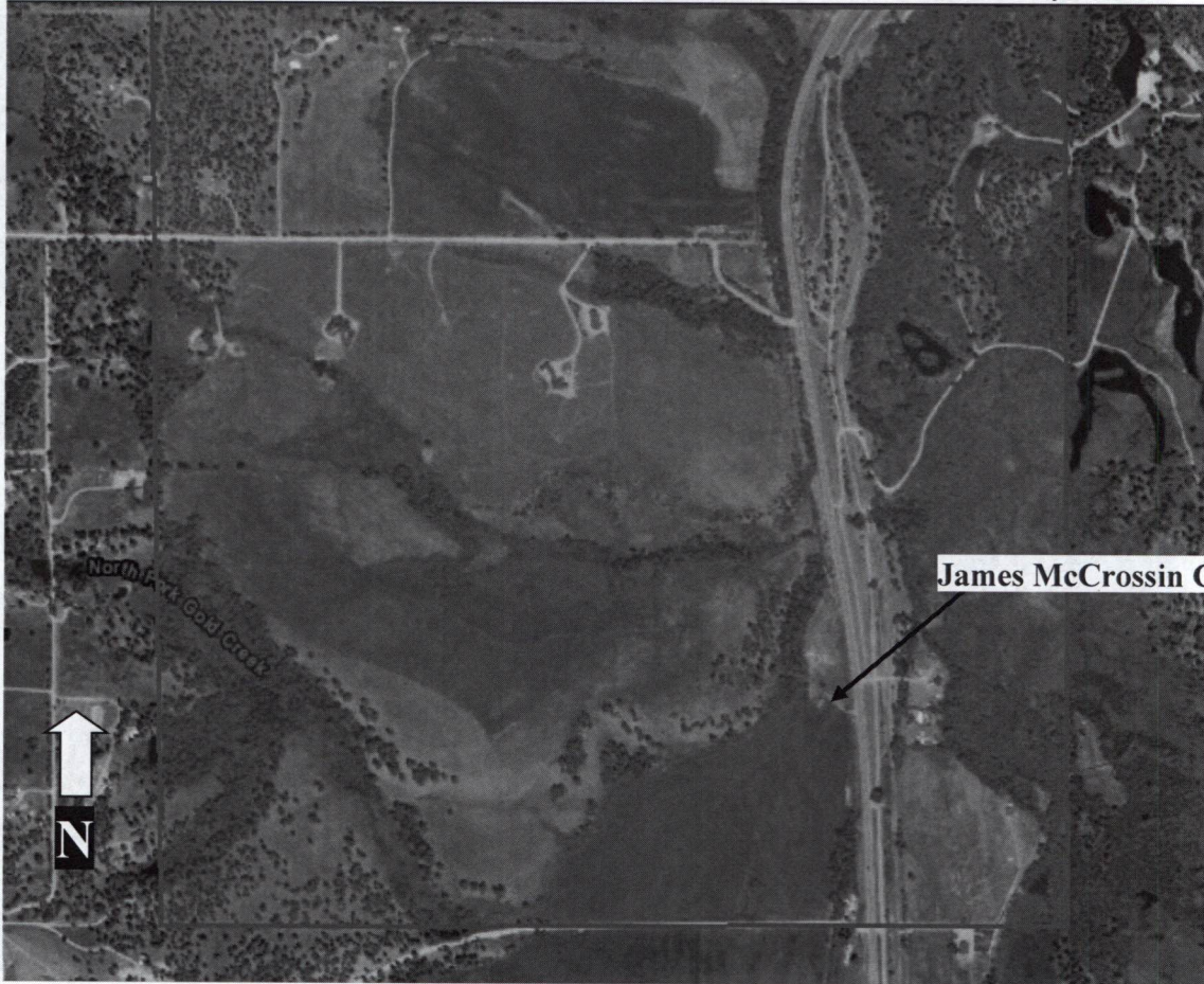
Aerial view of the location of the James McCrossin Cabin. Map created using the Digital Atlas October 8, 2019.