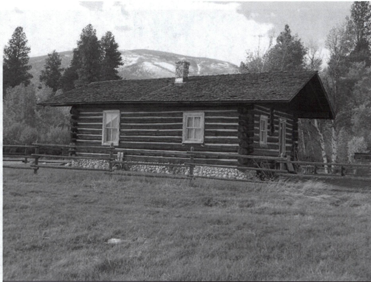
East elevation. View to west. Ward Mountain in the background. MT_RavalliCounty_JamesMcCrossinCabin_Photo 0006.

Paperwork Reduction Act Statement: This information is being collected for applications to the National Register of Historic Places to nominate properties for listing or determine eligibility for listing, to list properties, and to amend existing listings. Response to this request is required to obtain a benefit in accordance with the National Historic Preservation Act, as amended (16 U.S.C. 460 et seq.).