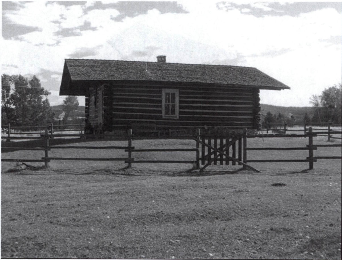
West elevation. View to the east towards U.S. Highway 93 and the Sapphire Mountains. MT_RavalliCounty_JamesMcCrossinCabin_Photo 0004.