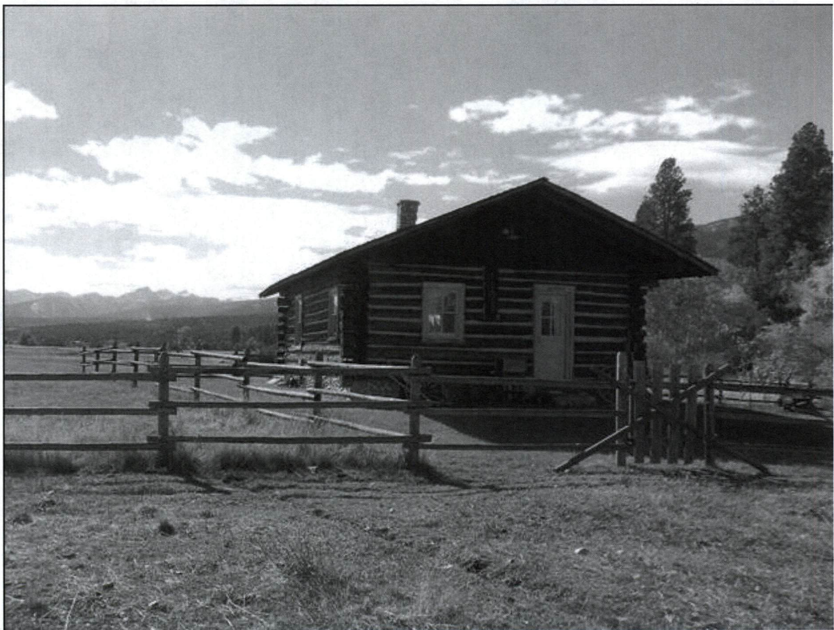
North (northeast) elevation, looking west. Como Peaks in the distance. MT_RavalliCounty_JamesMcCrossinCabin_Photo 0001.

Description of Photograph(s) and number, include description of view indicating direction of camera: