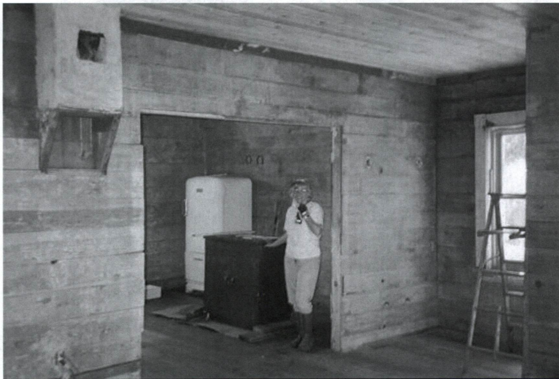
Interior of the James McCrossin Cabin during restoration.