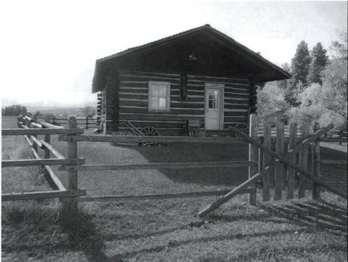
North elevation. View to the south. Close-up of front door. Como Peaks barely visible in background.

MT_RavalliCounty_JamesMcCrossinCabin_Photo 0003.