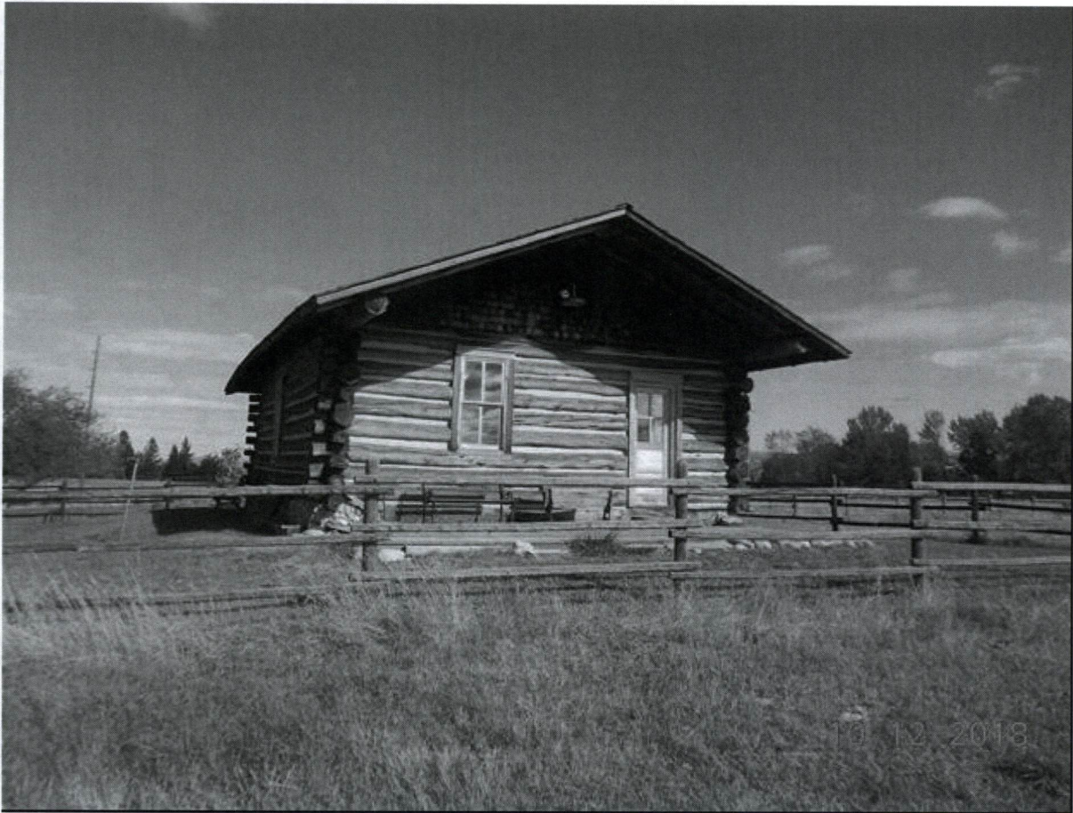
South elevation. View to the north. MT_RavalliCounty_JamesMcCrossinCabin_Photo 0005.