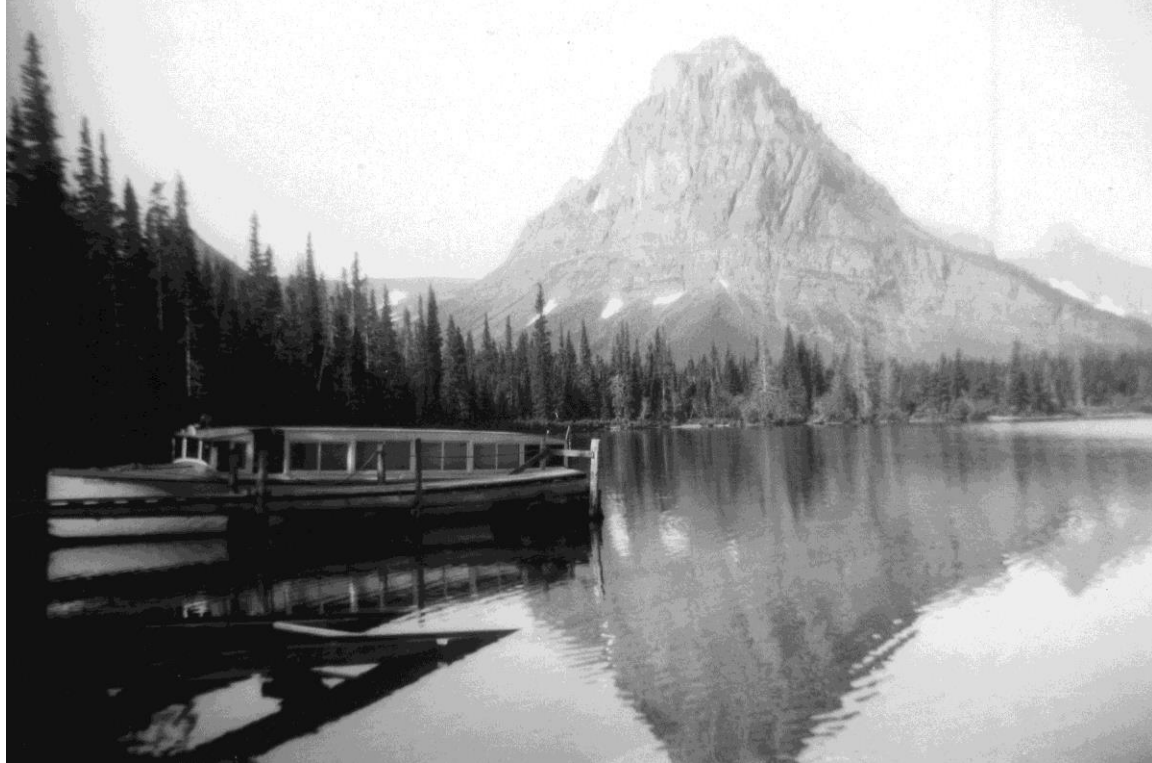
Little Chief on Two Medicine lake after rechristening as Sinopah (circa 1940s).

Section number Additional Documentation—Historic Photographs Page 24