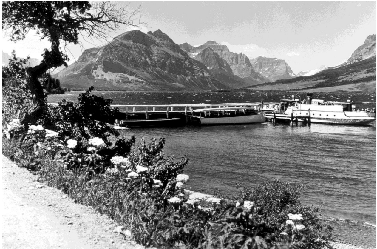
Little Chief at St. Mary Chalet dock circa 1933.

Section number Additional Documentation—Historic Photographs Page 23