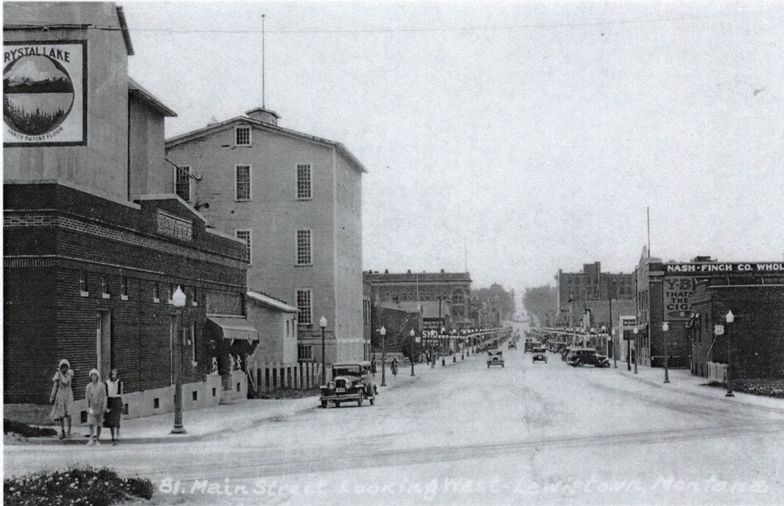
Intersection of E. Main Street and the Railroad Right-of-Ways, Looking West. High Street and the Great Northern branch to Grass Range (originally intended as the Montana Eastern line to North Dakota) is seen in the foreground. Miller Street and the Milwaukee Road's northern branch can be seen one block west. Sawyers and the Montana Flour Mill Co. are on the south (left) side of Main Street. The warehouses of the Gamble-Robinson Co. and Nash-Finch Co. are on the north (right) side of Main Street. (photo curtesy the Lewistown Public Library).