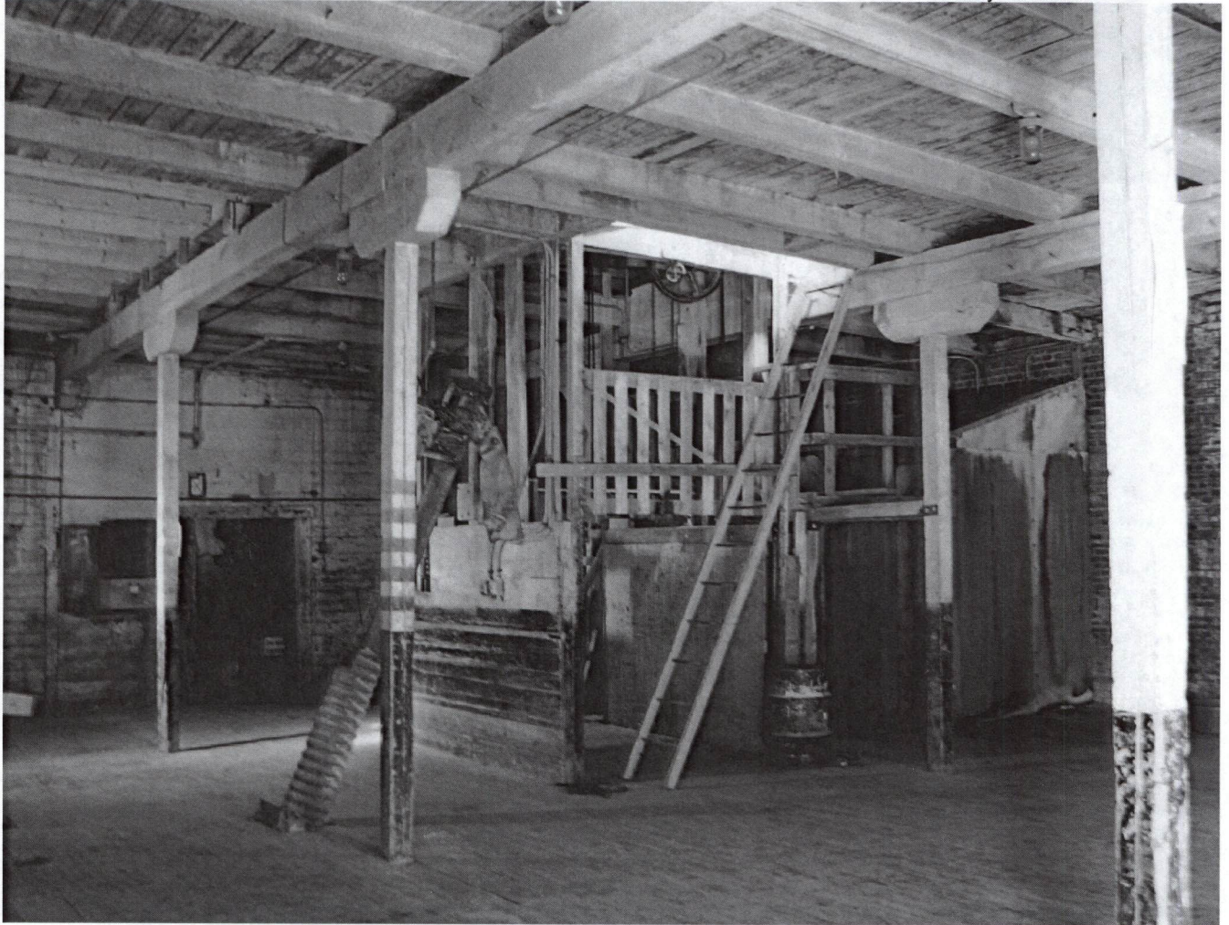
Photo MT_FergusCounty_Gamble-RobinsonCoWarehouse_0009. Interior, Main Floor Warehouse Space with Freight Elevator, facing: N