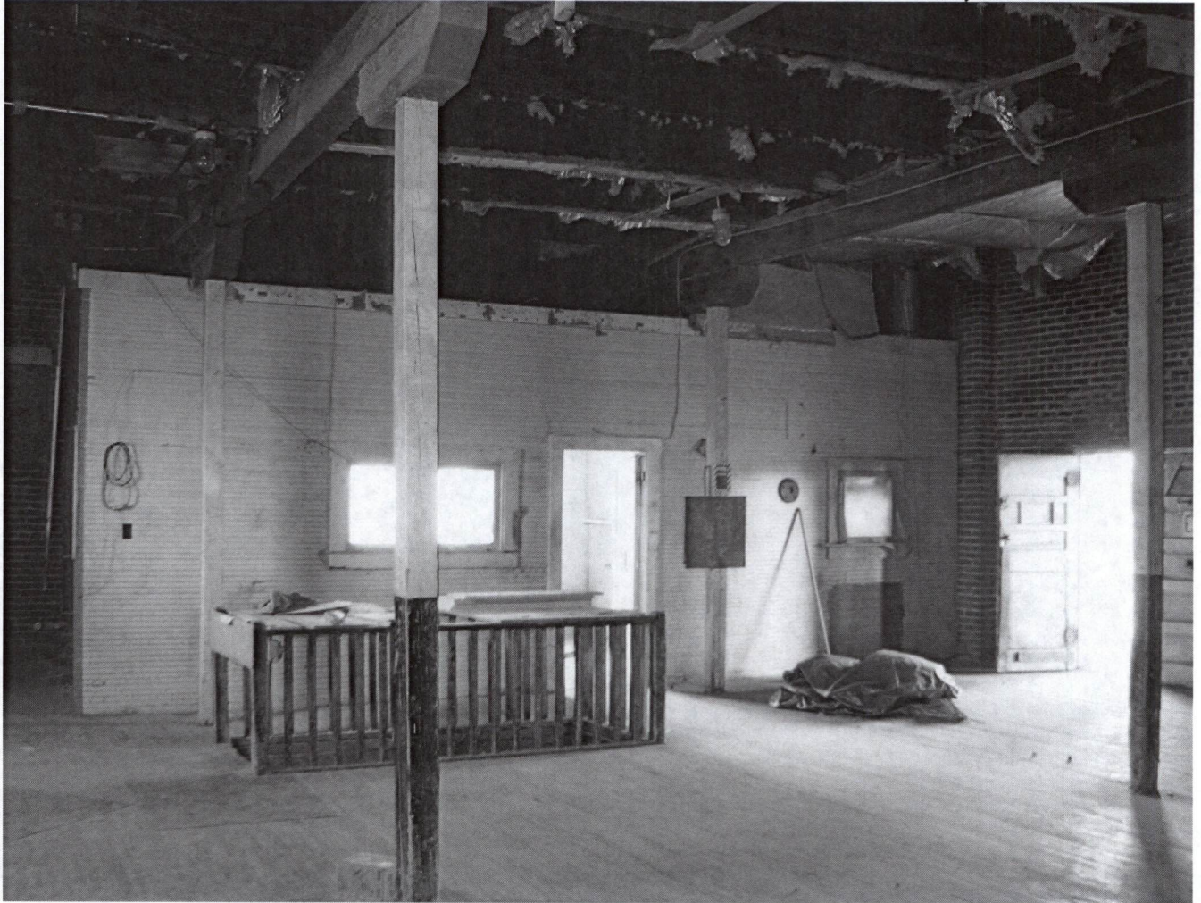
Photo MT_FergusCounty_Gamble-RobinsonCoWarehouse_0007. Interior, Office Area with Basement Stairs, facing: S