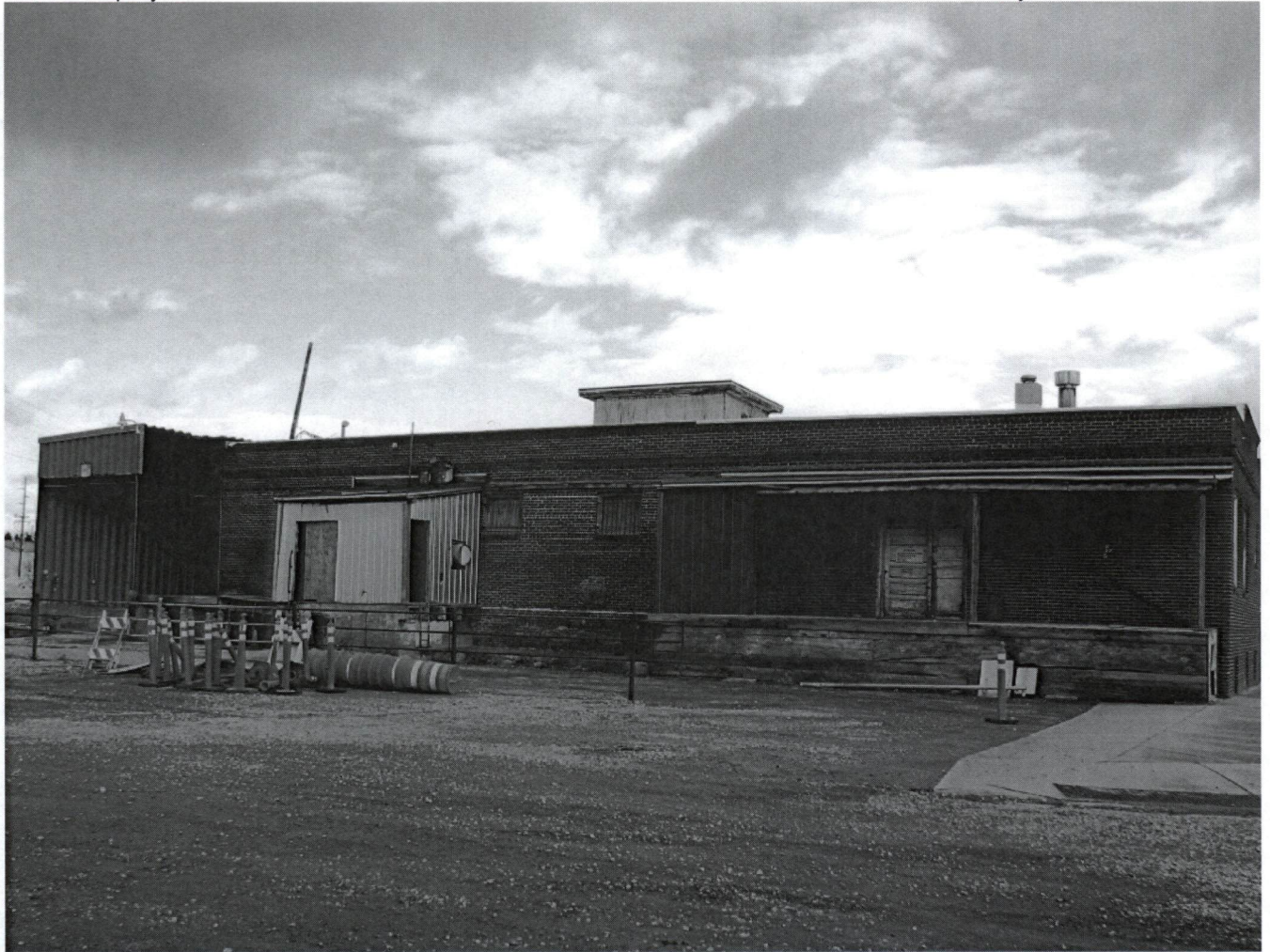
Photo MT_FergusCounty_Gamble-RobinsonCoWarehouse_0002. West "Rail-Side" Façade, facing: N