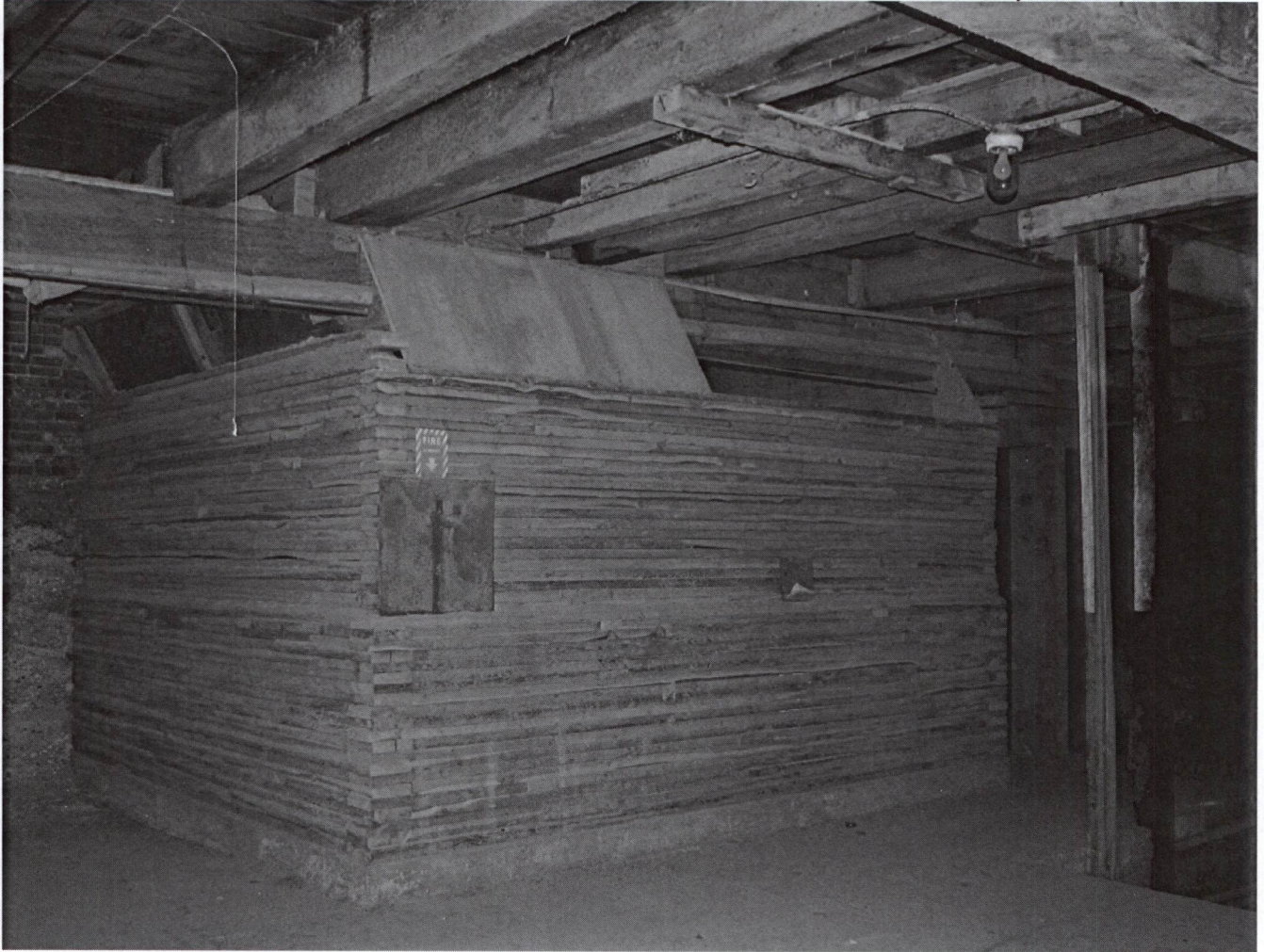
Photo MT_FergusCounty_Gamble-RobinsonCoWarehouse_0011. Interior, Wood Storage Crib in Basement, facing: S