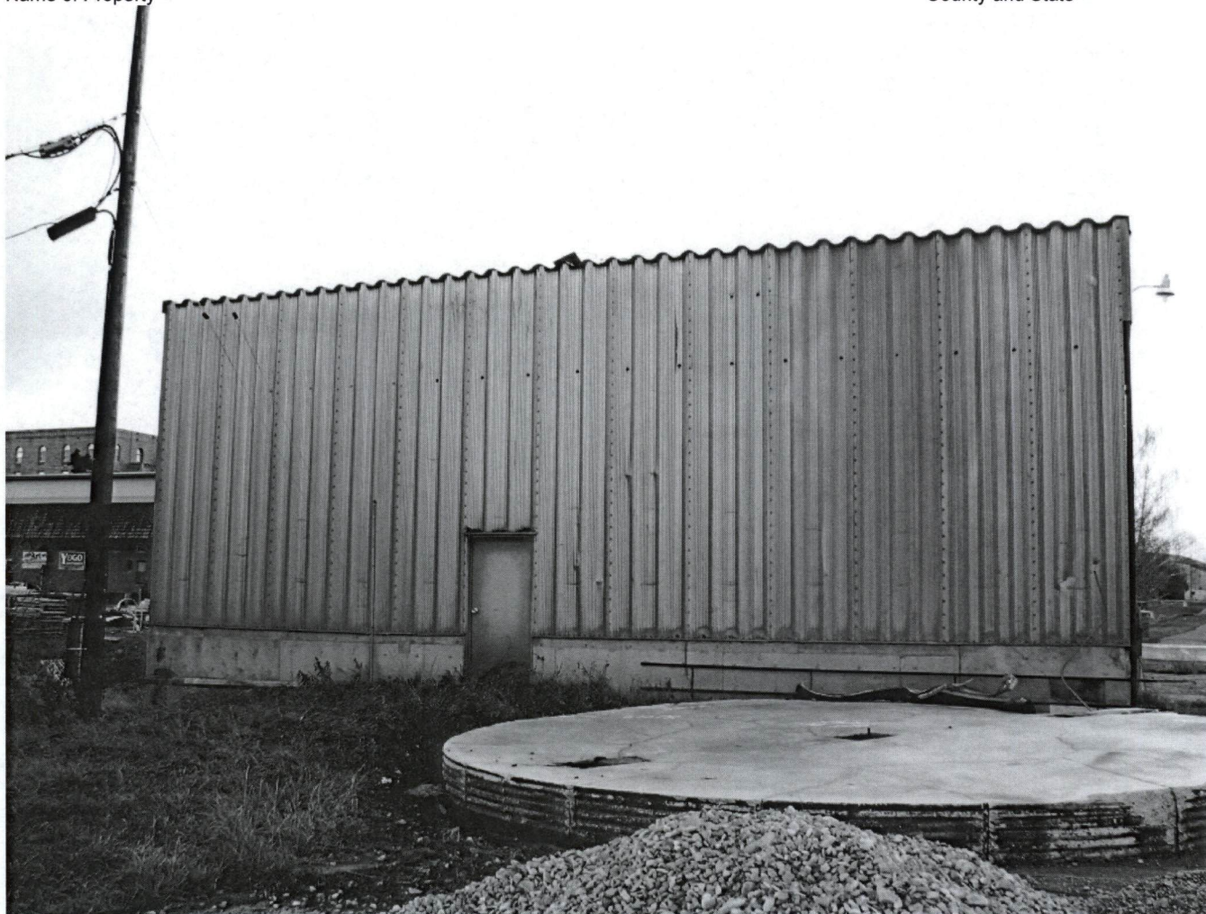
Photo MT_FergusCounty_Gamble-RobinsonCoWarehouse_0006. North "Rear" Elevation of Metal Addition, facing: SE