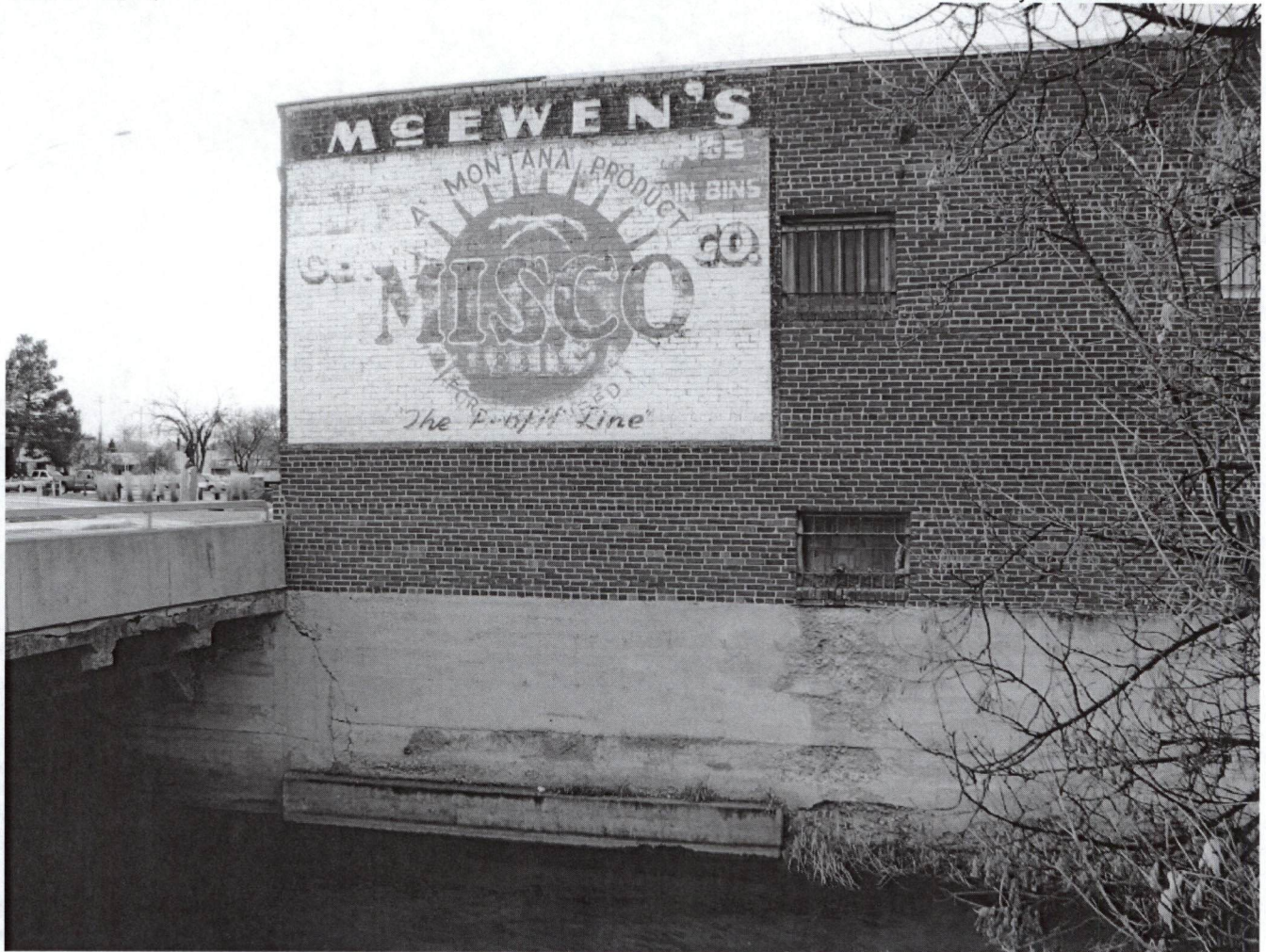
Photo MT_FergusCounty_Gamble-RobinsonCoWarehouse_0003. East "Creekside" Elevation, South End, facing: SW