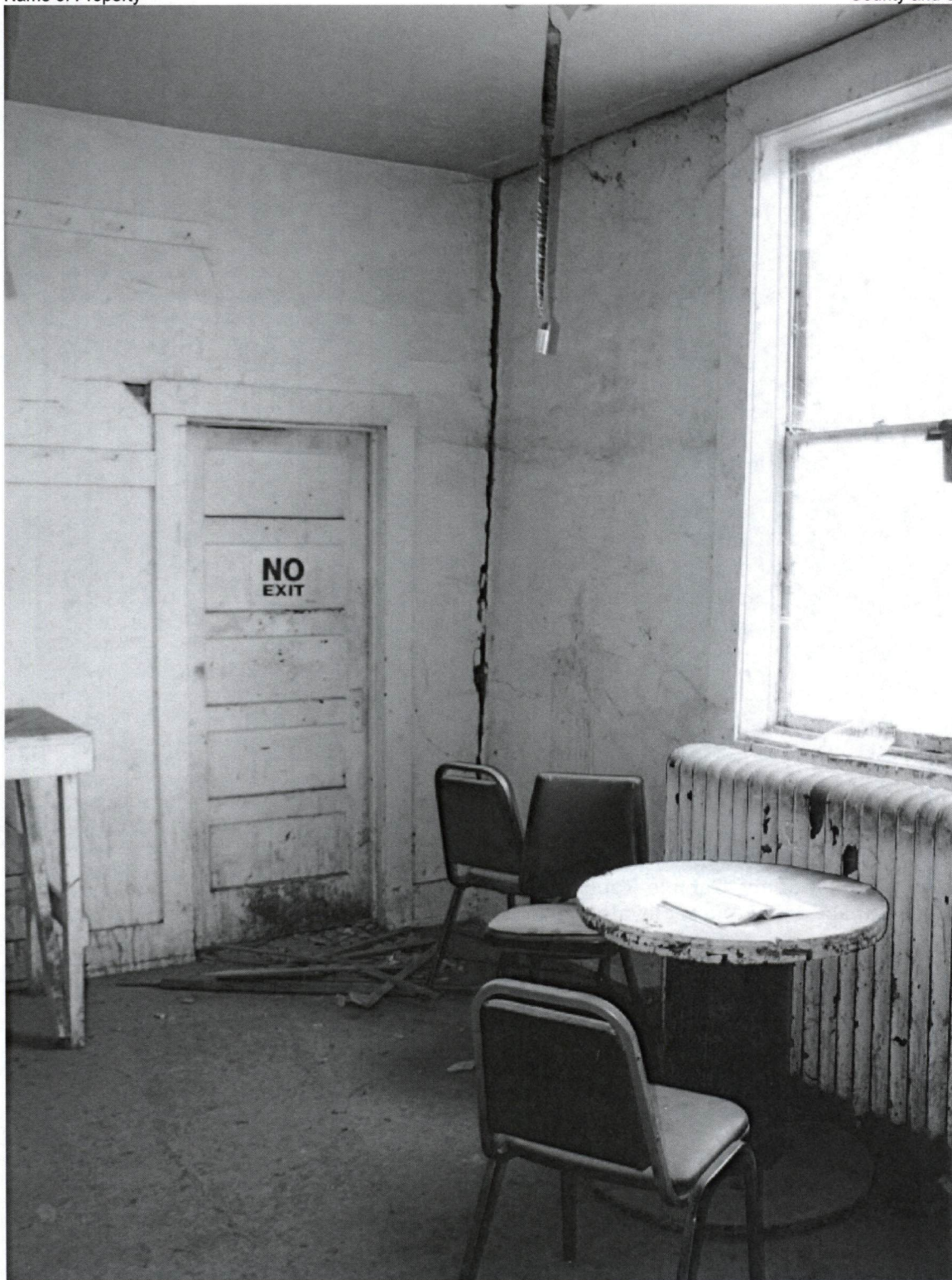
Photo MT_FergusCounty_Gamble-RobinsonCoWarehouse_0008. Interior, Detail of East Office, facing: SE