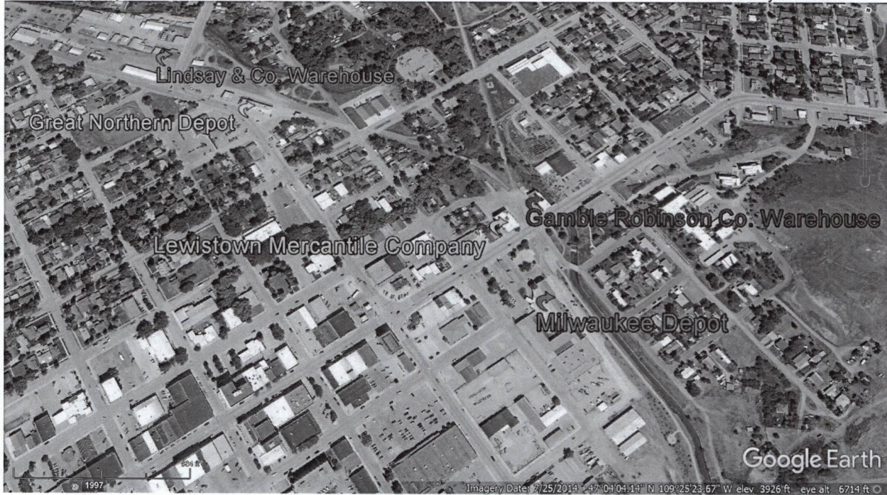
Aerial Image Showing Location of the Gamble-Robinson Co. Warehouse.