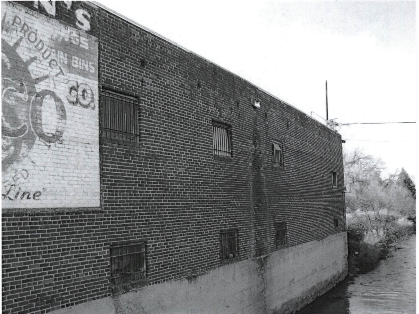
Photo MT_FergusCounty_Gamble-RobinsonCoWarehouse_0004. East "Creekside" Elevation, North End, facing: NW