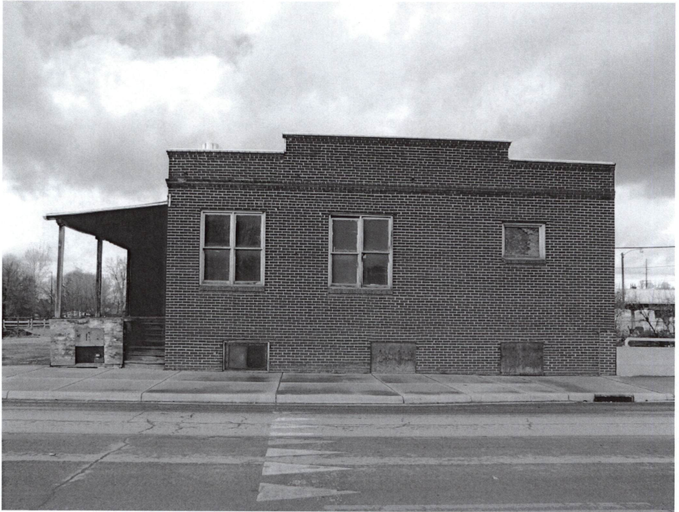
Photo MT_FergusCounty_Gamble-RobinsonCoWarehouse_0001. South "Main Street" Façade, facing: NW