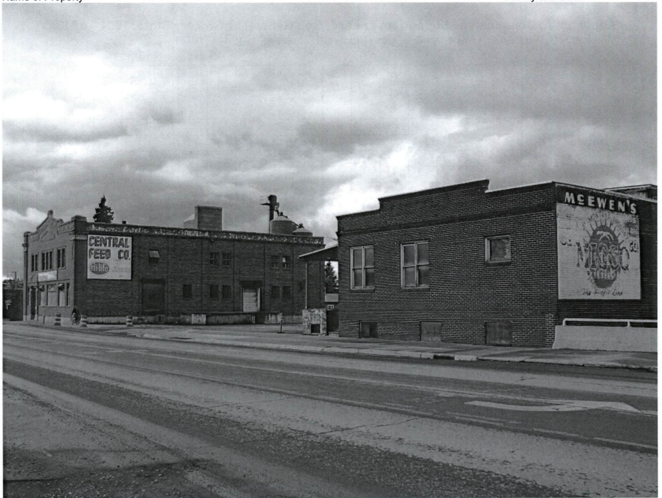
Photo MT_FergusCounty_Gamble-RobinsonCoWarehouse_0012. Overview of Gamble Robinson Co. Warehouse and Lewistown Mercantile Company (Nash-Finch Co), facing: W