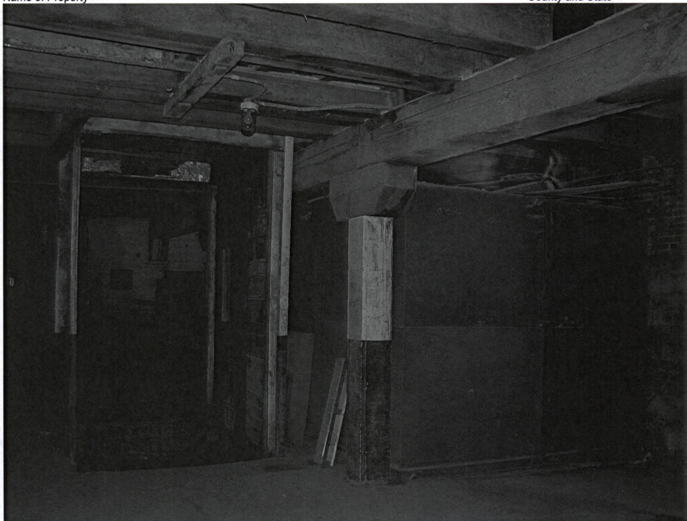
Photo MT_FergusCounty_Gamble-RobinsonCoWarehouse_0010. Interior, Basement with Freight Elevator, facing: N