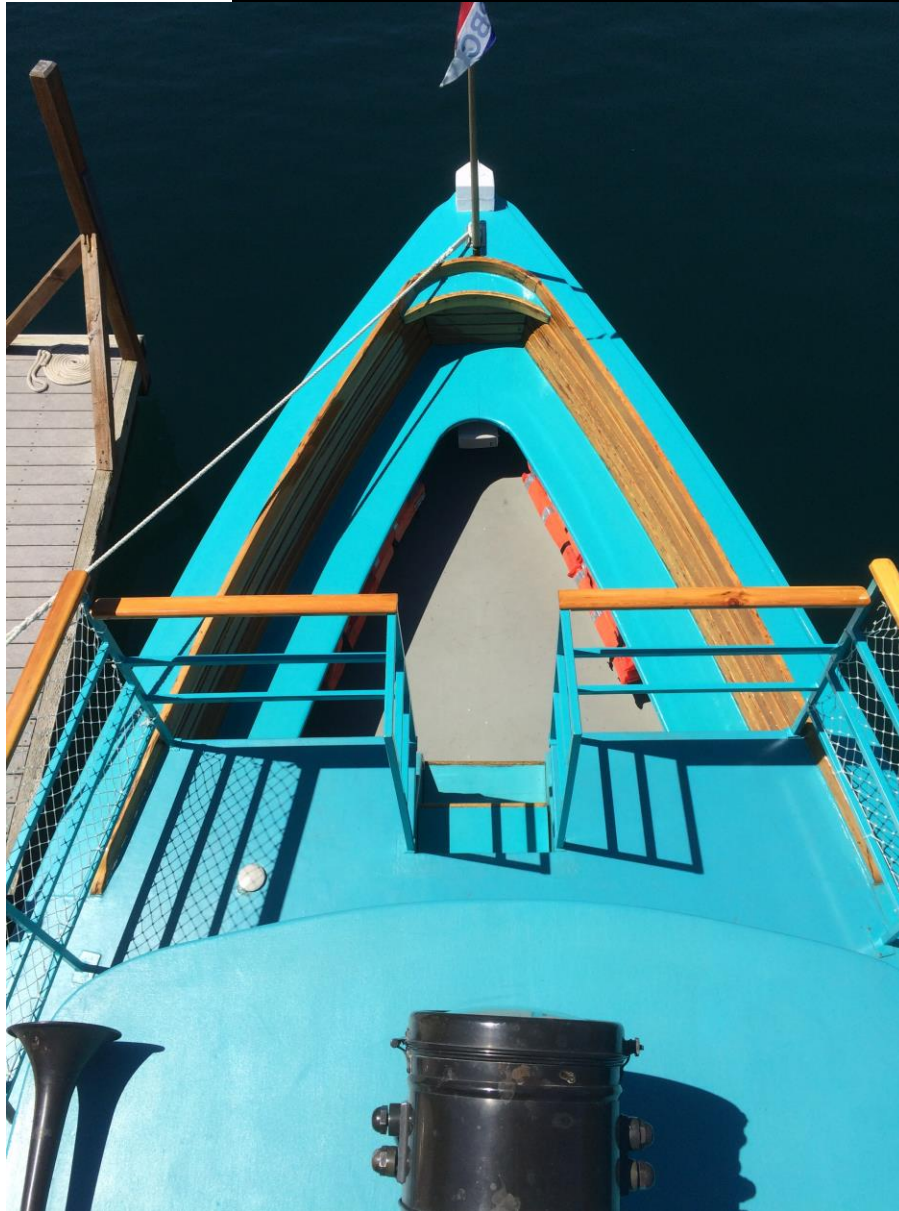
Name of Property: DeSmet City or Vicinity: Glacier National Park County: Flathead State: MT Date Photographed: 2016 Description of Photograph(s) and number: DeSmet Bow Deck Seating. MT_FlatheadCounty_ DeSmet_0002

Section number Additional Documentation—National Register Photographs Page 28