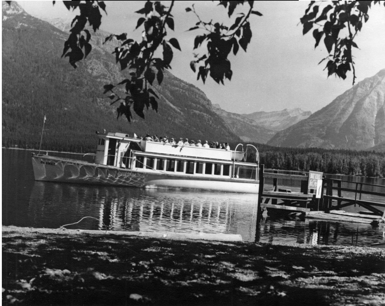
DeSmet , circa 1930.

Section number Additional Documentation—Historic Photographs Page 26