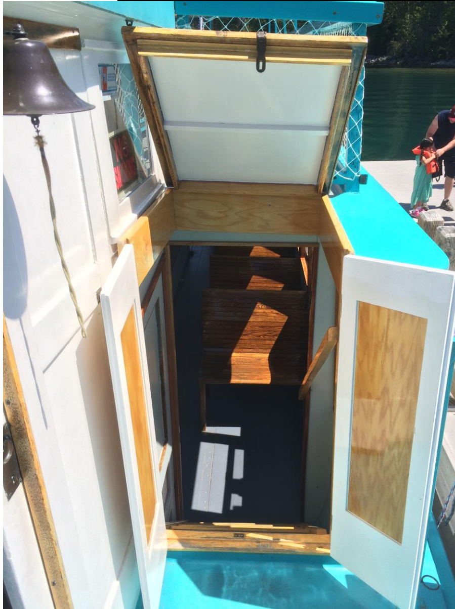
Name of Property: DeSmet City or Vicinity: Glacier National Park County: Flathead State: MT Date Photographed: 2016 Description of Photograph(s) and number: Companionway to lower cabin deck. MT_FlatheadCounty_ DeSmet_0008

Section number Additional Documentation—National Register Photographs Page 34