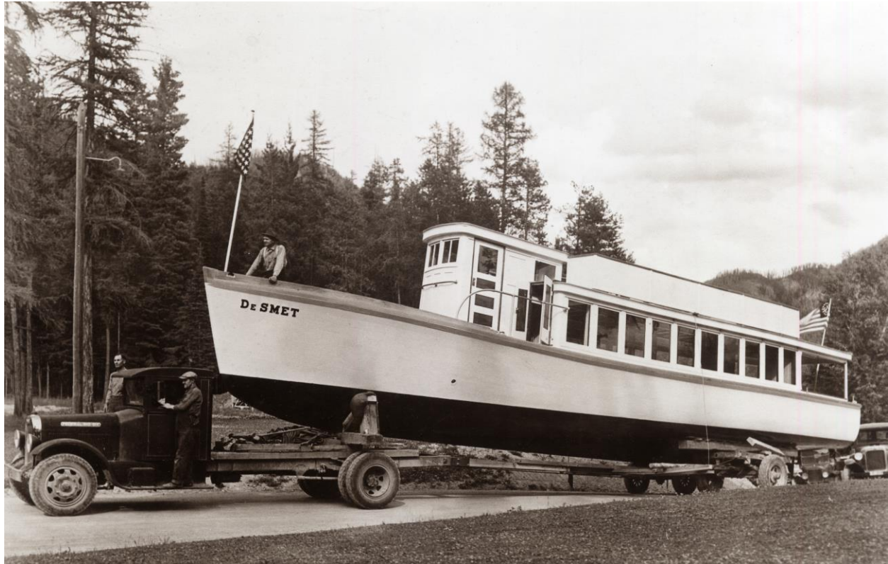
JW Swanson preparing to launch DeSmet 1930 Glacier National Park Archives.

Section number Additional Documentation—Historic Photographs Page 25