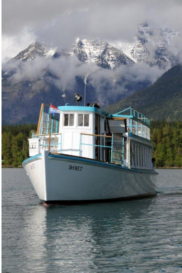
Name of Property: DeSmet City or Vicinity: Glacier National Park County: Flathead State: MT Date Photographed: 2016 Description of Photograph(s) and number: Desmet Bow Port. MT_FlatheadCounty_DeSmet_0001

Section number Additional Documentation—National Register Photographs Page 27