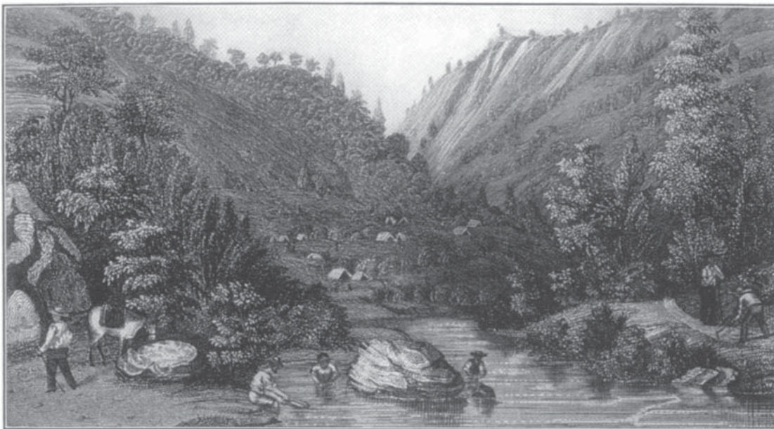
Placer mining was for many unsuspecting forty-niners surprisingly hard work. Men not used to exhausting physical labor had to stand in icy streams and creeks day in and day out panning and shoveling, as illustrated above in a rare woodcut drawing of a scene on the Mokelumne River in 1849.