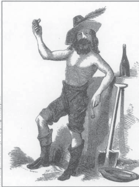
In California, xenophobia and prejudice, focused most on Mexicans, Chileans, French, and Chinese, could and did escalate into violence and inequitable laws like the miners’ tax. These argonauts spoke, behaved, and often dressed differently, as Francis Samuel Marryat indicated in the above illustration, titled The French Miner (1855).

differently. The same forty-niner who denounced the “outrage on the Mexicans” reported that when some toughs jumped the claim of Frenchmen who owned one of the richest mines at Nigger Hill, there “was a big excitement and a miner’s meeting called, which decided the Frenchmen’s titles were as good as anybody else’s and so the foreigners got the ground again.” “All this,” he continued, shows “that we have more regard for other peoples than the Mariposa miners [who drove