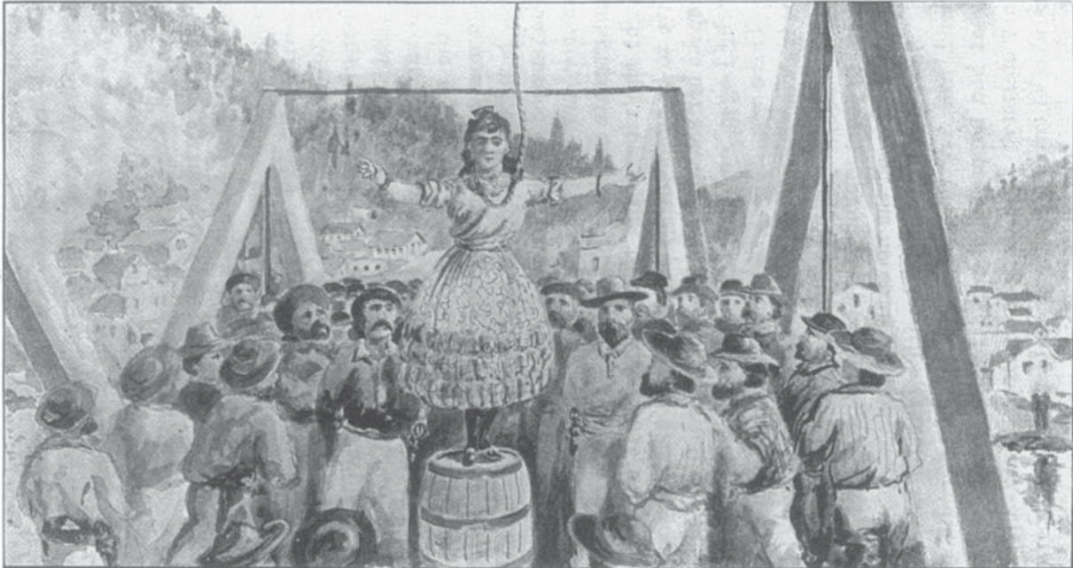
The hanging of a Mexican woman in Downieville in 1851 after she stabbed an Australian miner to death proved an exceptional incident that scores of men noted in their journals and memoirs. In the estimation of some, it also marked the end of an early, more orderly era in the mines and the advent of greater violence often born of prejudice.