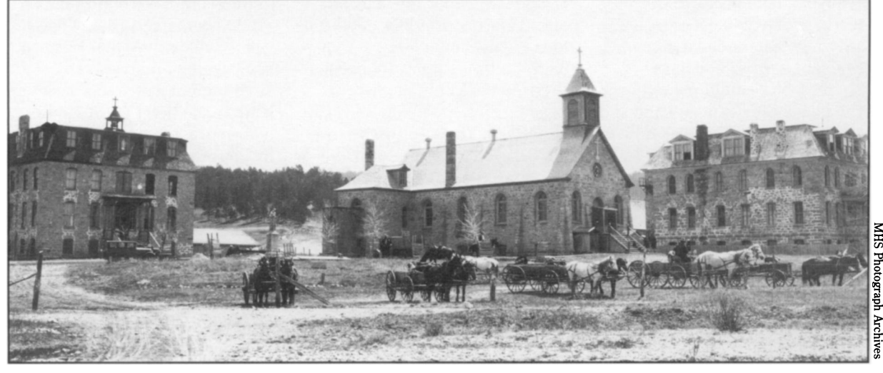
St. Paul's Mission in Hays as it looked in the late 1920s or early 1930s

became bums. That's a really hard term there, [but] they became more dependent on the federal government—the Bureau of Indian Affairs for commodities, or rations. They became more dependent on the BIA to help them, and the BIA seemed to like [it].