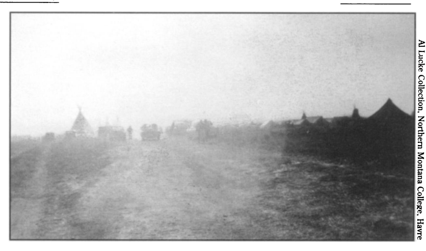
Tepees rise beyond agency buildings in Hays, in the southwest corner of the Fort Belknap Reservation, about 1953.

There were few automobiles. The house I lived in was a oneroom log house. On one side was the kitchen area and the other side was the sleeping area. As kids we usually slept four in a bed. I slept with my aunts in one bed and my grandfolks had their bed. That was during the winter months. During the summer months everybody slept outside in tents and tepees because the house seemed to get full of bugs. Different things came in at that