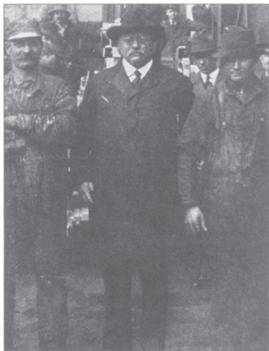
At Minneapolis, on his return from the West in September 1918, Roosevelt spoke to five thousand munitions workers on behalf of the Liberty Loan drive.