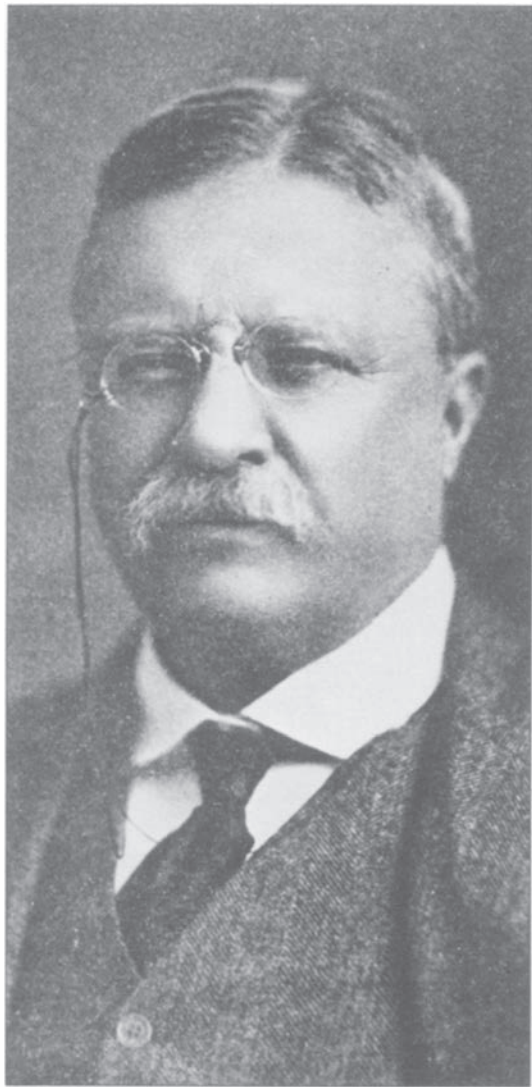
This photograph of Theodore Roosevelt at Columbus, Ohio, on September 26, 1918, was probably the last one taken of him before he died.

tion. 35 Privately, however, Roosevelt yielded nothing. He rejected Pinchot's argument for NPL integrity, he bolstered several state committeemen by letter, and he suggested to Chairman Hays that someone at Republican headquarters should be assigned to track "ultra-radical publications" like the League's papers in order that