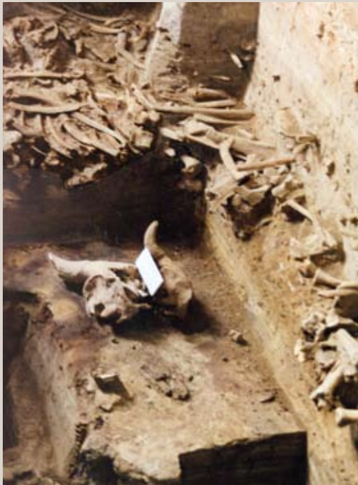
FIGURE 2.20: There are 360 recorded bison jump sites in Montana (plus about 50 natural traps and other kinds of kill sites) where people returned again and again to harvest and process bison. Here at Wahkpa Chu'gn in Havre, archaeologists have excavated the soil beneath the cliff to reveal many layers of artifacts and bison bones.

frightened them into a stampede. As the animals tumbled over the cliff, hunters at the bottom would kill any still alive. Others waiting alongside the cliff would move in for butchering and processing.