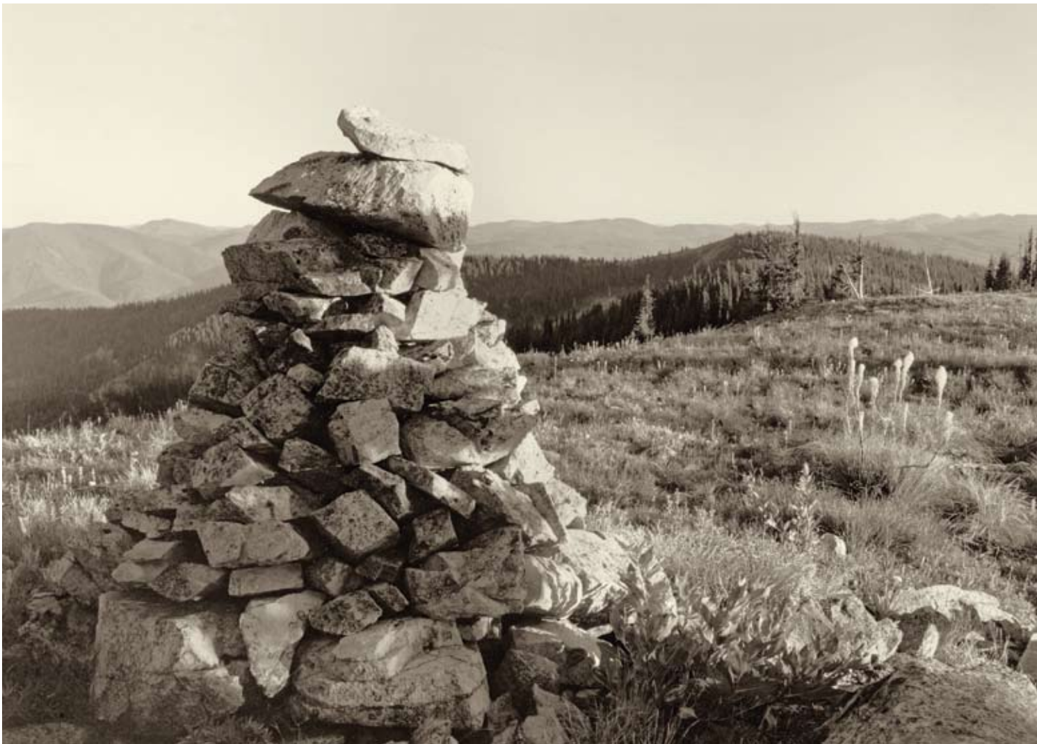
FIGURE 2.13: No one knows who first built this rock cairn on the Lolo Trail or when they built it. By the nineteenth century, it had become so widely recognized that some people began calling it the Indian Post Office—though it is doubtful any Indians ever called it that.

A Great Trek Long before Lewis and Clark “My father once told me of an expedition from the Blackfeet that went south by the Old Trail to visit the people with dark skins . . . They were absent four years. It took them twelve moons of steady traveling to reach the country of the dark skinned people, and eighteen months to come north again.” —BRINGS-DOWN-THE-SUN, BLACKFEET, 1910