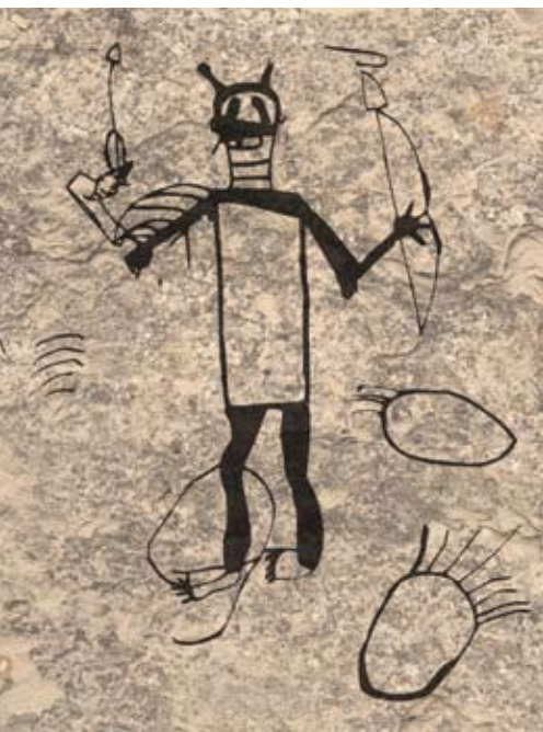
FIGURE 2.9: This reproduction of a pictograph depicts a man wearing a horned mask headdress and carrying a bow with a spear-like weapon attached to it. In his right hand, he holds an arrow, and his arm is decorated with personal power images. The original pictograph was painted at Pictograph Cave some time in the deep past.