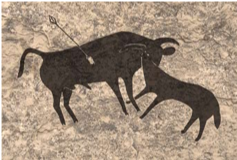
FIGURES 2.17 (left) and 2.18 (above): Not all pictographs are beautiful works of art, but some are. Archaeologists carefully reproduced all of the rock art they found at Pictograph Cave to preserve them for further study.

By about 500 years ago, 350 different languages were spoken in North America. People of many different bands and traditions thrived in a variety of landscapes, from coastline to mountaintops, from forests to high prairies. They had adapted to many changes over thousands of years. The arrival of Europeans was about to transform their world again.