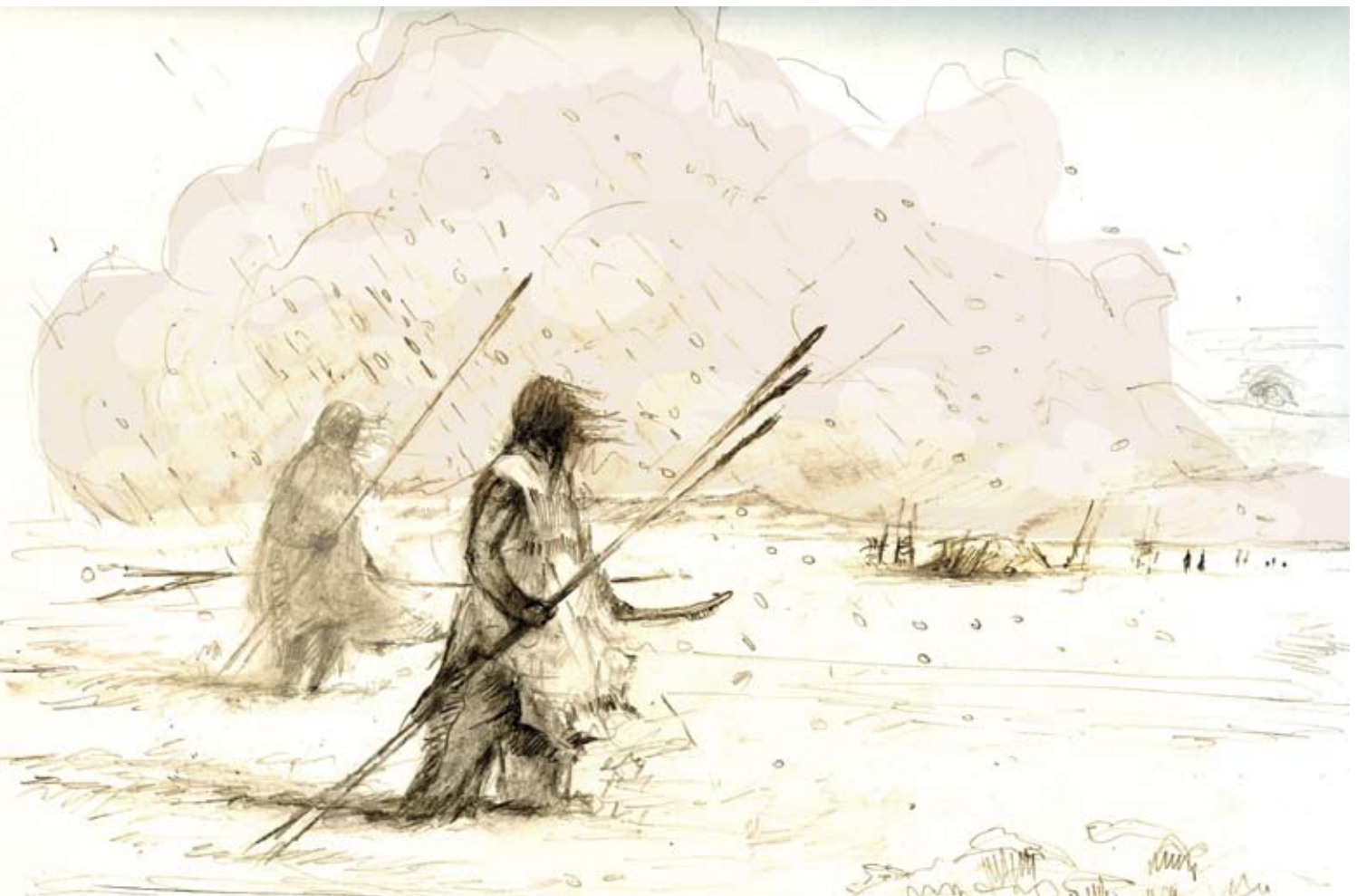
FIGURE 2.4: Just like you, the people of 12,000 years ago used tools appropriate to their environment. They lived in small family groups, moved around to gather supplies, and adapted to changes in their world. This illustration shows one artist's idea of what Ice Age Montanans might have looked like.

Now scientists are expanding their theories. Some believe that different groups of people may have moved to the Americas in several waves