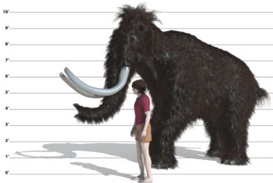
FIGURE 2.5: How would you bring down a woolly mammoth? Hunters of the Early Period killed giant mammals 10 or 20 times their weight with handheld spears at close range. Sometimes they lured the animals into swamps, bogs, or snowdrifts, where the giant mammals were immobilized (could not move).

Over time the glacial till developed a little topsoil. Wind and water erosion (wearing away) carved rivers, buttes, and benches onto the flat plain. Birches and willows began growing in the river valleys and grassland on the upland benches. The glacial lakes broke through their ice dams and drained, leaving dry sand that eventually blew into big dunes. Alpine glaciers became much smaller, and the tundra and muskeg dried out and began to grow dryland trees, shrubs, and grasses.