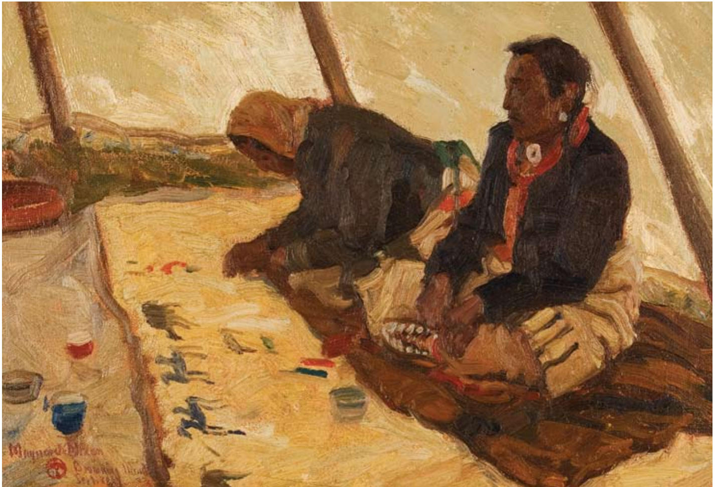
FIGURE 2.2: Many Plains people recorded important events on “winter counts”—hides painted with symbols marking events that happened to a group during the course of a year or “winter.” American artist Maynard Dixon (1875–1946) painted this scene, called Blackfeet Historians .

Oral histories are important stories that people pass down from generation to generation. Oral histories mix wisdom and information together to express what the world was like for the ancestors of a certain family or society. When your parents or grandparents tell stories about what