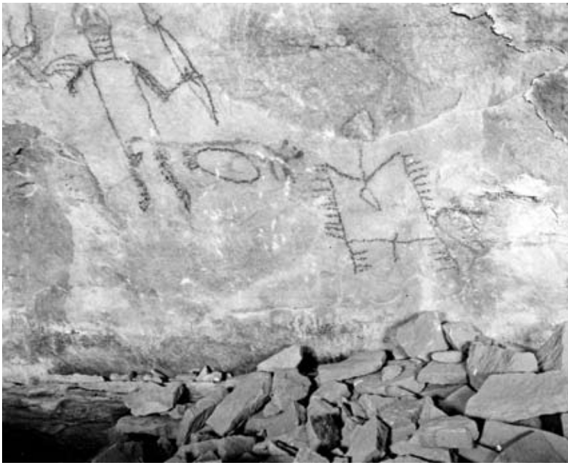
FIGURE 2.16: This pictograph, from Pictograph Cave near Billings, shows a V-necked warrior with an early form of a rifle, and another warrior with an older-style weapon. Some interpret this scene as a record of a battle between people who had firearms and others who did not.

recreational time. Some Montanans believe Pictograph Cave is the single most significant archaeological site in Montana because it has such a rich history of human activity.