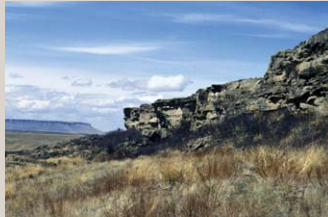
FIGURE 2.19: The First Peoples Buffalo Jump, south of Great Falls, made a perfect bison kill site. Hunters drove the bison down a gentle slope and over this cliff. Bison did not have to plunge too far to be disabled. Hunters hid in the rocks below to finish the kill. The people butchered the bison at the bottom of the cliff, then processed the meat on the grassy area below.

If a good buffalo jump was available, people set piles of stones in a large V-shape to create a drive line (a stone formation like a runway) toward the cliff. Often a “buffalo runner,” wearing the hide of a bison calf, would draw the lead cow toward the jump by bleating like a distressed calf. Others would startle the herd from behind, getting them moving toward the cliff. When the bison drew near the cliff, the people