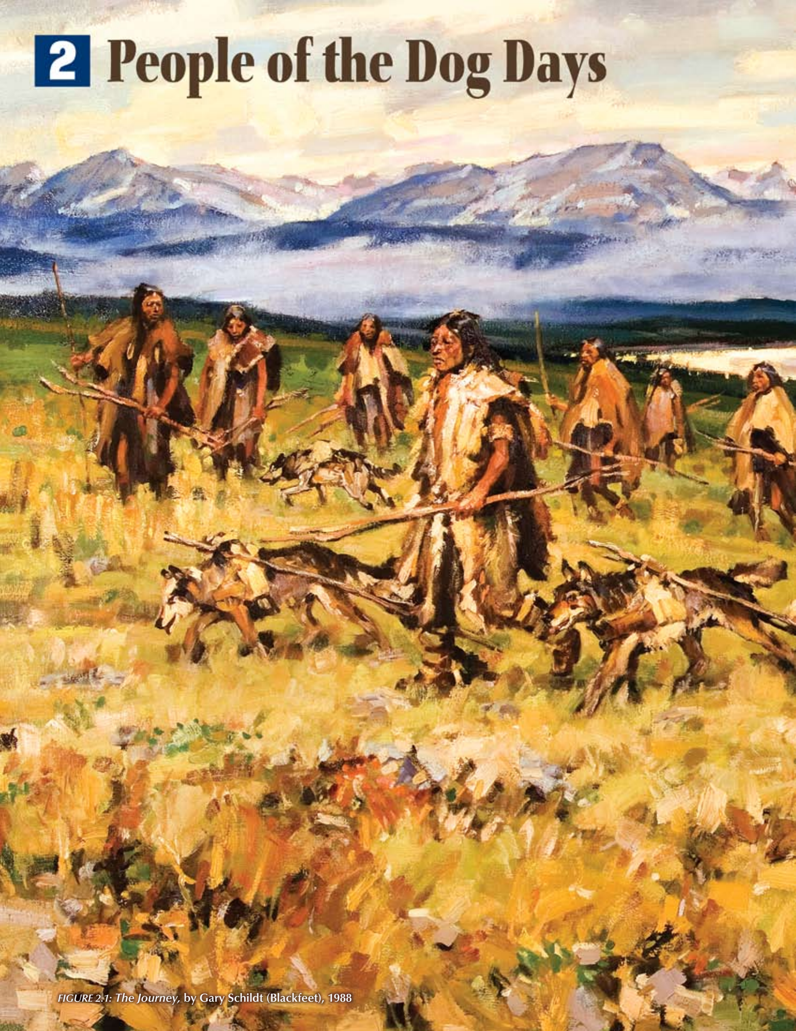
FIGURE 2.1: The Journey , by Gary Schildt (Blackfeet), 1988