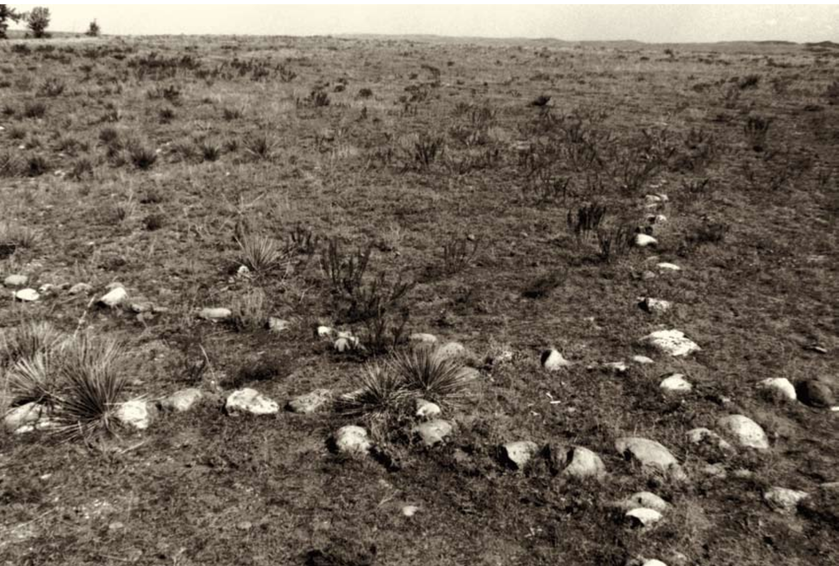
FIGURE 2.14: This medicine wheel site, near the Montana-Wyoming border, marks where spiritually important events have happened for many hundreds of years.

Medicine wheels (structures made of stones arrayed in a circle) are some of the most intriguing mysteries of the High Plains. Medicine wheels are stones set in a circle, with lines radiating out for many yards like spokes. The oldest of these wheels have been in place for perhaps