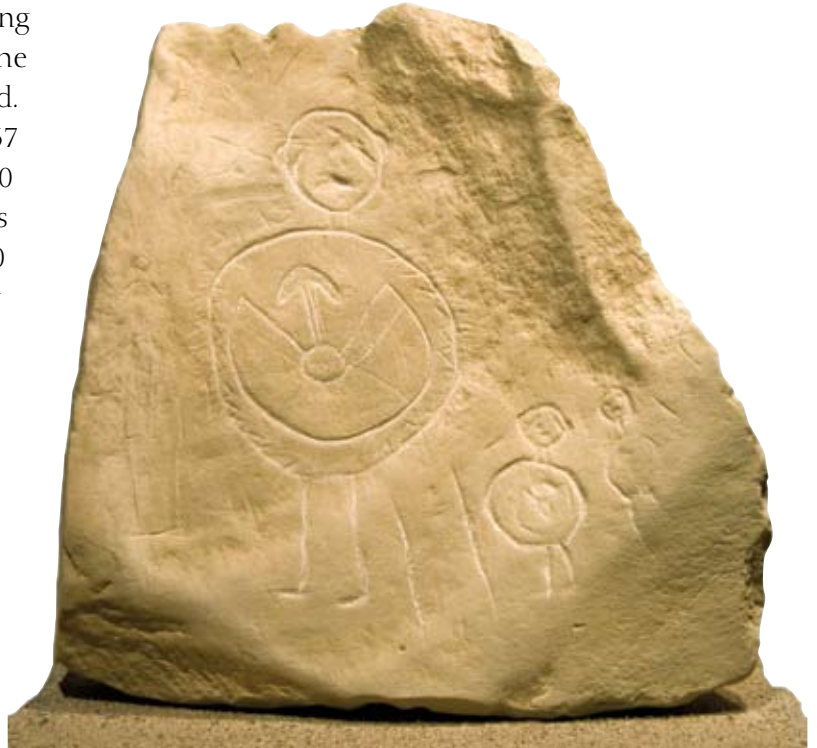
FIGURE 2.15: Six important petroglyphs, including this one, were found at Ellison Rock, near Colstrip in southeastern Montana. All were removed from the site and preserved before Ellison Rock was mined for coal in the 1980s. This one, now at the Montana Historical Society museum in Helena, shows three shield-bearing warriors.

It is very important to leave all artifacts where you find them and to help protect these precious links to Montana’s early ancestors. If you find an artifact, contact the local tribal office or the State Historic Preservation Office in Helena (406-444-7715).