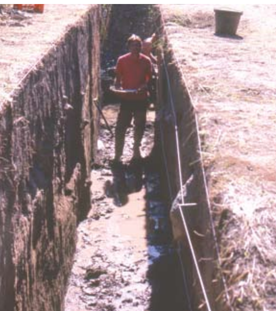
FIGURE 2.6: Archaeologists at the MacHaffie Site, near Helena, carefully hand-dug a trench with trowels to expose layers of soil. They recovered pollen from different soil layers and charcoal from cooking hearths, which told them what kinds of plants grew there during different periods of time. From that we can learn about climate changes in this place over the past 9,000 years.

Imagine the landscape of the time as a giant puzzle pattern of many different pieces: gravel mounds, tundra, muskeg swamp, sand dune, alpine glacier, forest, and grassland. All those areas have existed in Montana since the last Ice Age—and are here still. They simply shift around, expand, and contract as the climate changes.