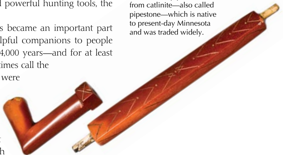
FIGURE 2.11: People throughout the world have used pipes for thousands of years. Early Plains people made pipes from bison bones, wood, and stone in a variety of designs. This ancient pipe was made from catlinite—also called pipestone—which is native to present-day Minnesota and was traded widely.

The tobacco plant, which has several varieties, was native to the Americas. Seeds and plants were widely traded. When tobacco was not available, people sometimes smoked other plants such as kinnikinnick. After Europeans arrived in Central and North America, the use of tobacco spread throughout the world.