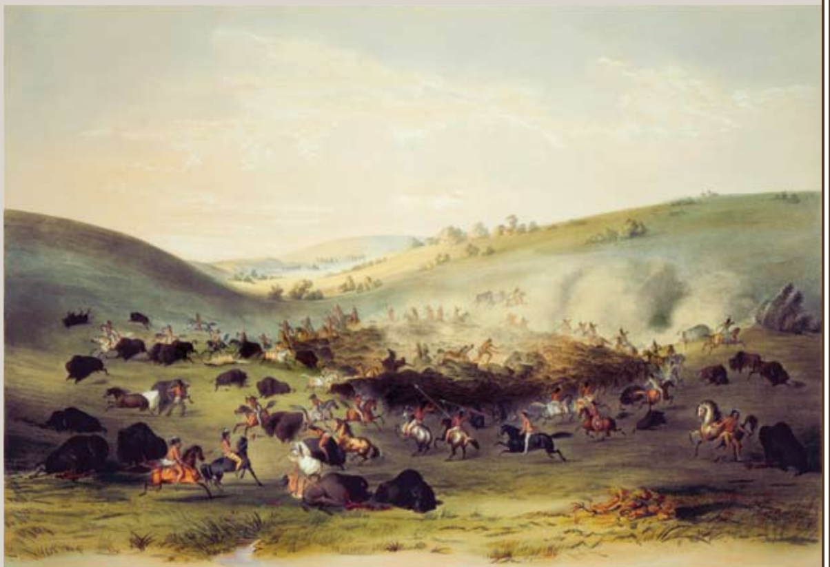
FIGURE 2.21: Horses changed the way Plains Indians hunted bison. Now they could go to the herd instead of moving the herd to a buffalo jump or a pound. American painter George Catlin (1796–1872) painted this scene of a bison hunt after visiting the Northern Plains in the 1830s.

The communal (shared) bison drive must be one of the more remarkable hunting methods ever devised. It was technically difficult: bison are huge, unpredictable, and flighty. Yet the people could somehow make whole herds move many miles. In addition to their tools and techniques developed over time, the people also used spiritual offerings, prayers, and ceremonial knowledge to bring the animals to the people.