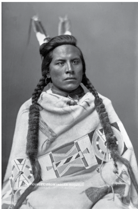
Curley, Crow Indian Scout, General Custer's Scout (Crow), 1883

As Euro-Americans moved West, Indians in Montana were losing their old ways of life. During this time many Indian people wanted to remember the old ways, so they drew them from memory, using the materials that were available to them. These new materials included different kinds of paper, like notebook paper or paper from books that kept track of sales in stores and the railroad (ledger books). They used pencils and colored pencils to draw their stories—the same sorts of stories that they had traditionally drawn on tipi liners and robes.