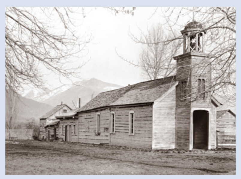
St. Mary's Mission, ca. 1895.

Founder's Day activities will continue with Salish drumming and dancing, guided tours of the mission, exhibits, demonstrations, children's Indian games, and the burying of a time capsule.