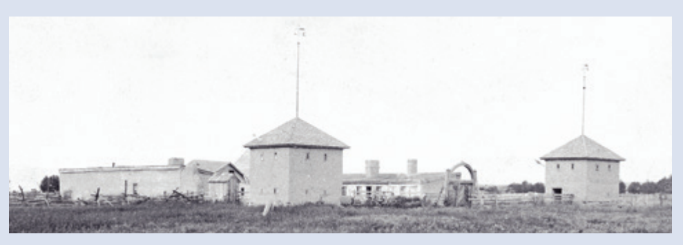
Fort Owen, ca. 1895.