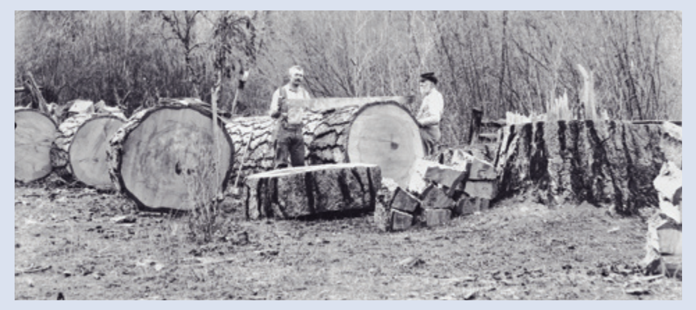
Bertie Lord and Father Cutting Firewood, Bitterroot Valley, ca. 1903. MHS Lord Collection

its evolution into a modern National Forest. She will detail how the valley communities and the forest grew up together, while profiling the sometimes colorful individuals and events that were key in their development.