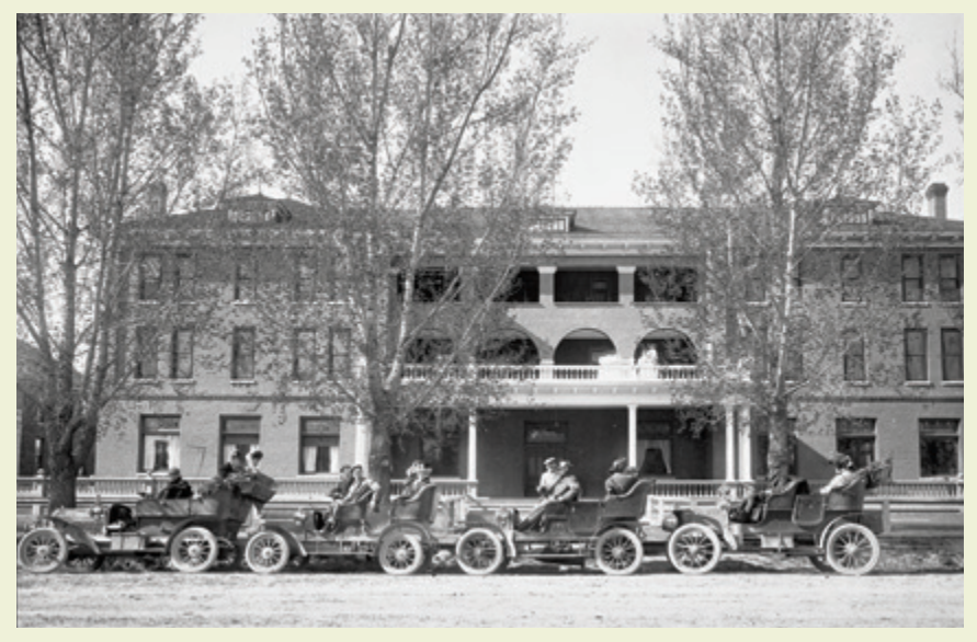
The Ravalli Hotel, Hamilton, ca. 1907. MHS 948-096