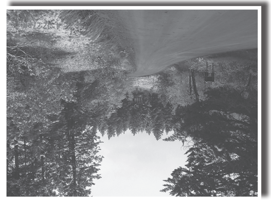
Montana mountain road.