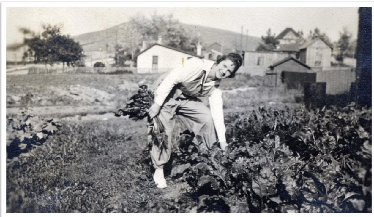
Unidentified Woman Working in her 'War Garden, Helena, 1918, PAc 2005-4 A1 p. 10

Swiss chard. —Those who like greens of any sort, and especially beet greens, should try this vegetable. It is a beet, but instead of the root, the leaves and their stalks are used, being prepared like greens. The stalks are sometimes prepared and served like asparagus. Planting and cultural directions given for beets apply to this crop, which does best under conditions favorable for growing beets. The size to which the leaves and stalks should grow before picking will be determined by personal preference. If the central bud or growing point is not injured in picking the leaves, new leaves will continue to develop until late in the fall. A row 15 to 25 feet long should keep an ordinary family well supplied with greens from mid-