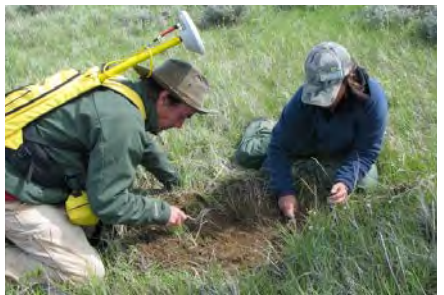
Rosebud Battlefield Field School, Rosebud County

planning in consultation with the SHPO. These efforts (further elaborated below, in Best Practices) include the $1.1 million insurance claim made by FWP in the successful recovery efforts at Bannack State Park following the disastrous flash flood of 2013. Other direct heritage stewardship efforts include repair and restoration projects in Virginia City, a National Register nomination of the MSU-Bozeman historic campus, cooperative research and documentation projects between FWP and the University System, the sensitive porch repairs of the Howey "Old Stone" House by DOA on the Capitol campus, and the preparation of a Historic Structure Report for the Original Governor's Mansion by the Montana Historical Society. Despite these notable efforts, the poor physical condition of many of our state's known heritage properties requires a greater investment of care and capital for basic repairs, renovations, and adaptive re-use.