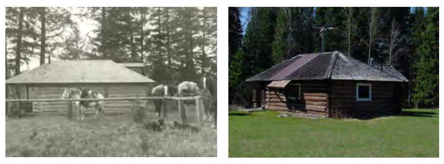
Swan River State Forest Station; Past & Present, Lake County