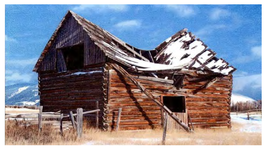
Matt Little Barn, Powell County

Finally, while limited by its current staffing and funding, the Montana Heritage Commission, Department of Commerce, continues to make inroads in the preservation of Virginia City.