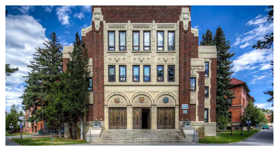
MT Tech Museum Building, Butte

Based upon the reports provided in 2014, 2.7% of the documented properties are endangered and 59.3% have a satisfactory status. While initially it appears that the relative number of endangered properties has significantly decreased since 2012, this decrease can be attributed almost entirely to the reassignment of 17 heritage properties (13 abandoned railroad grades and 4 archaeological sites) from "Endangered" to "Watch" after re-consideration of the respective definitions. In 2014, 27.9% of state-owned heritage properties are reported to be in excellent physical condition, while 13.1% are said to be in poor condition or have failed.