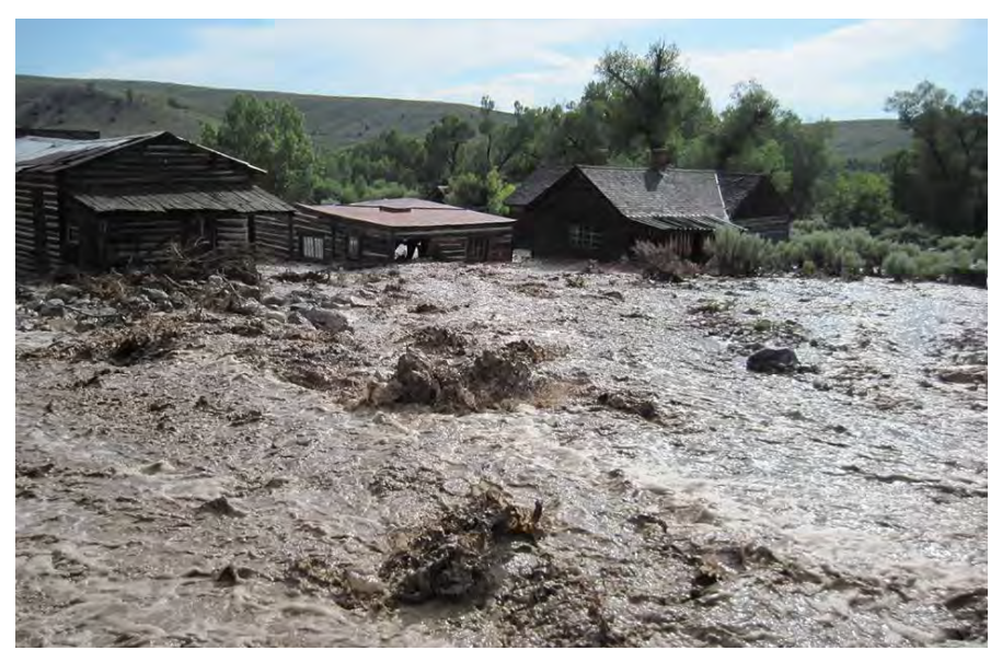
2013 Bannack Flash Flood, Beaverhead County