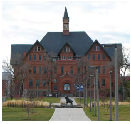
Montana Hall; MSU Bozeman, Gallatin County

In this reporting cycle, all twelve state agencies submitted reports, providing for a more comprehensive understanding of the state's heritage properties and their management. The 366 reported properties include 1,056 individual components. Of these, state agencies reported fourteen as endangered. Increased and improved consultation between state agencies and the SHPO is necessary to address these and other