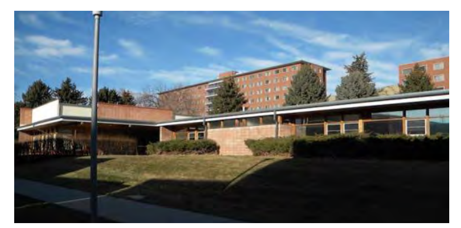
MSU Billings Academic Support Center, Billings

Further information on Montana's state-owned properties, including the 2014 State Agency Biennial Reports and individual property status and condition reporting forms, can be found at http://mhs.mt.gov/shpo.aspx.