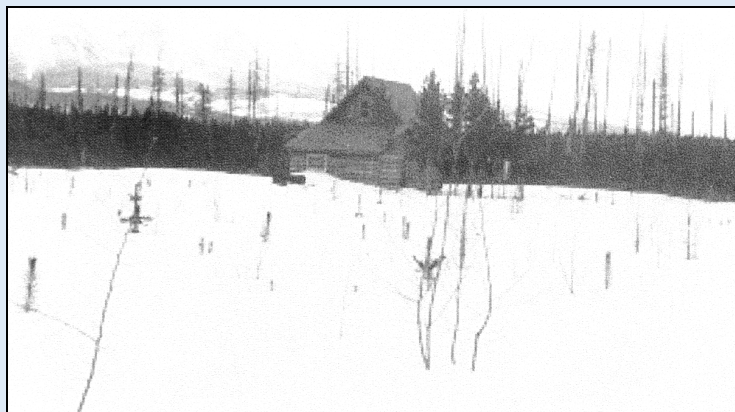
Billy Kruse Cabin, Flathead County

Hosted by the Montana State Historic Preservation Office of the Montana Historical Society