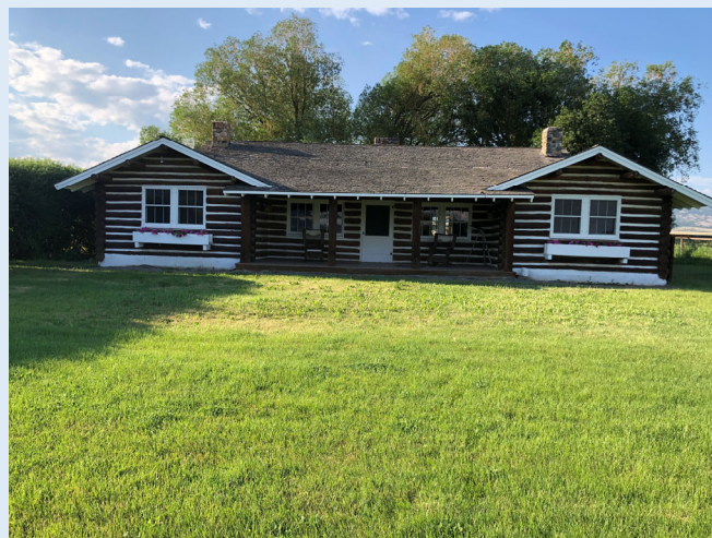
Patten House, Jefferson County