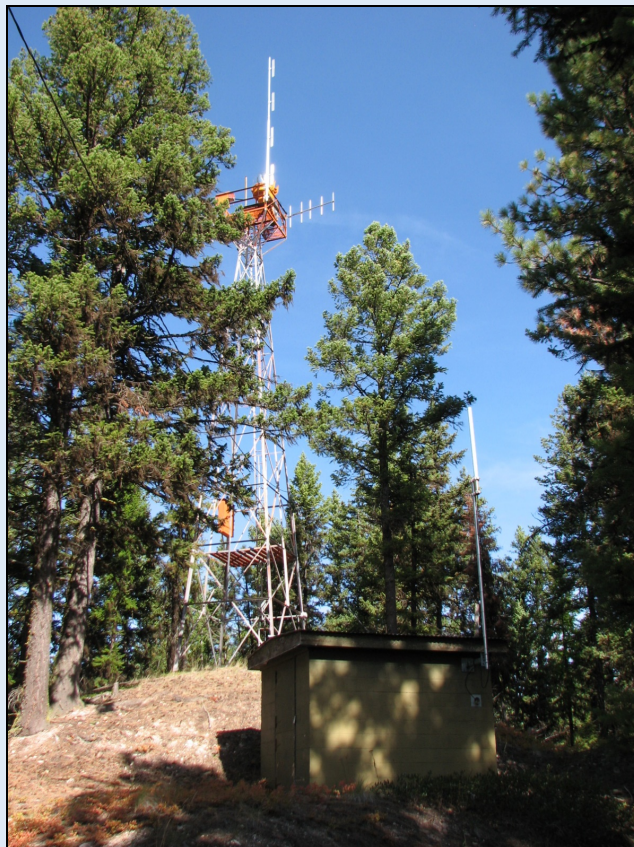
St. Regis Airway Beacon, Mineral County