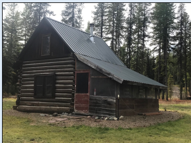
Billy Kruse Cabin, Flathead County