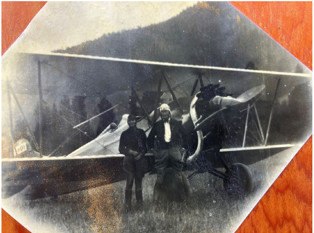
Barnstormers (Husband and Wife) Who Landed at the Homestead Property Due to Running Out of Gas, circa 1920s.