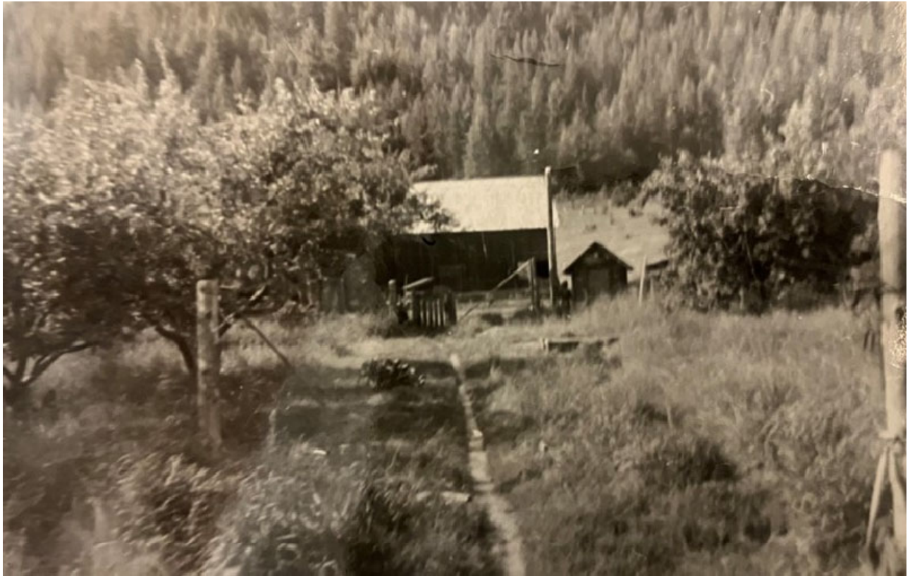
Swanson Homestead, Original Barn in Background, Looking South from House.