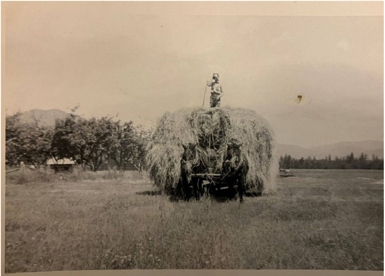
Homestead Looking East from Barn.