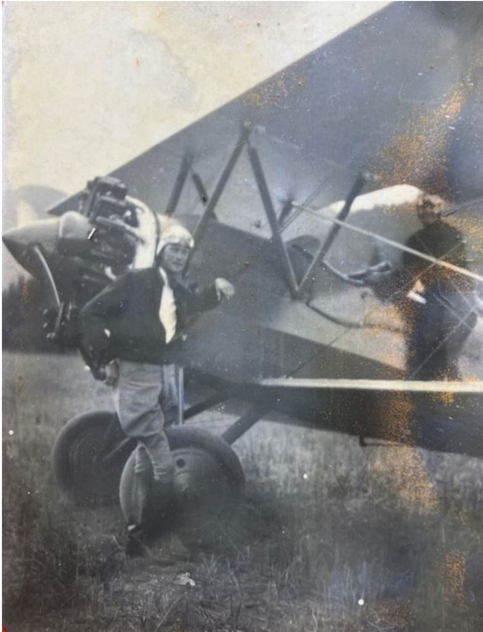
Barnstormers (Husband and Wife) Who Landed at the Homestead Property Due to Running Out of Gas, circa 1920s.