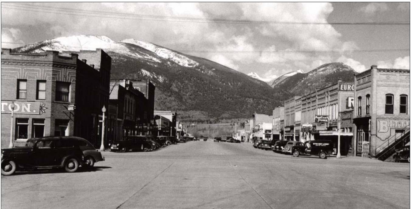
The view looking west up Main Street at the corner of First Street in 1927 when Main Street was paved with concrete. On the right corner is the Bitter Root Steam Laundry and the Hotel Hamilton is on the left.

The Bitterroot Stock Farm erected this building in 1908 at a cost of $10,000. It was designed for Margaret Daly by Missoula architect A. J. Gibson, who also designed the old County Court House (now the Ravalli County Museum), and the old City Hall (now the Fire Department). Three shop spaces were located on the main floor and there were 22 rooms on the second story. Those in the front were used for office space while the ones in the back were living quarters. Japanese families owned the Model Cafe, a main floor occupant, for over 20 years until the outbreak of World War II. In 1942 it became the Victory Cafe, and later the Rogers Cafe. This neo-Classical style building has undergone numerous changes that have altered the original appearance of the ground floor.