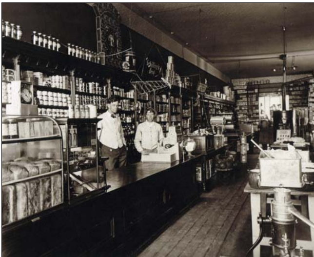
The interior of Spaulding's Store around 1919. It is now Red's Office Supply.