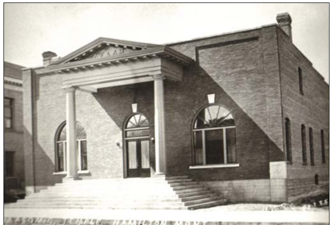
The original character of the Masonic Temple is still evident today.