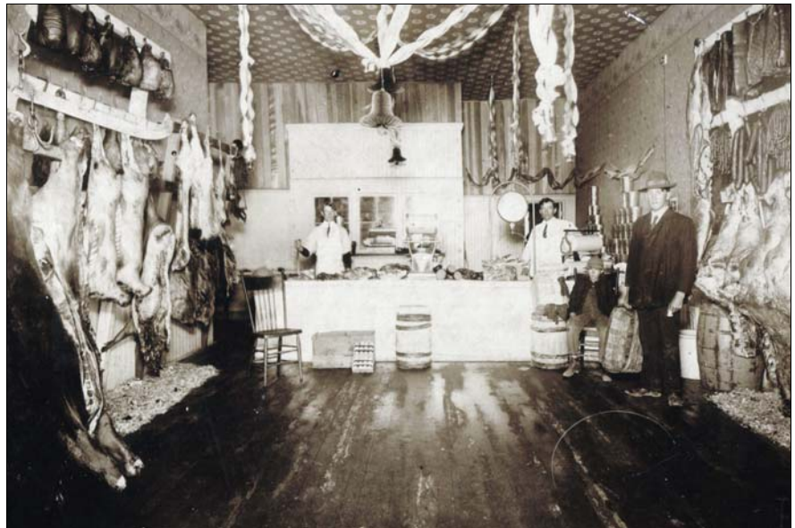
The Central Meat Market in 1890.

In its early days this building housed a grocery store with numerous owners. It has been extensively remodeled.