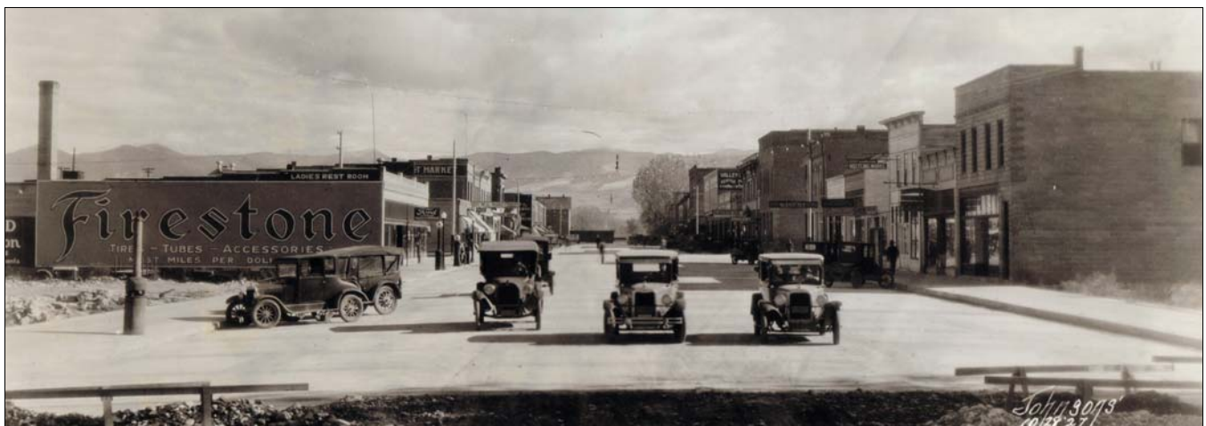
Looking east on the 3rd block of Main Street in 1927. On the left is the Theis Merchandise department store. Prominent on the right side of the street were the Ravalli County Bank, the Bitter Root Bakery, Central Meat Market, Good Year Shoe Shop and the Hamilton Bottling Works. This photograph was taken in 1927 just after Main Street was paved with concrete from the railroad tracks to Fourth Street.

Marcus Daly built this building in 1900 to house the RAVALLI COUNTY DEMOCRAT. It was one of the last masonry buildings attributed to him. When Daly was unable to buy any of the local papers he established his own. The paper did not last long after Daly's death in late 1900 and in 1902 the building was purchased as an office for another newspaper, the RAVALLI REPUBLICAN. When the RAVALLI REPUBLICAN moved across the street in 1923 this became the Bitter Root Bakery, known for its large loaves of bread baked in a "modern steam oven" which sold for 15 cents each. There was a small coffee parlor in the front of the bakery and the entire operation employed eight people. The building remained a bakery, under various names, until recent times. It has changed little over the years.