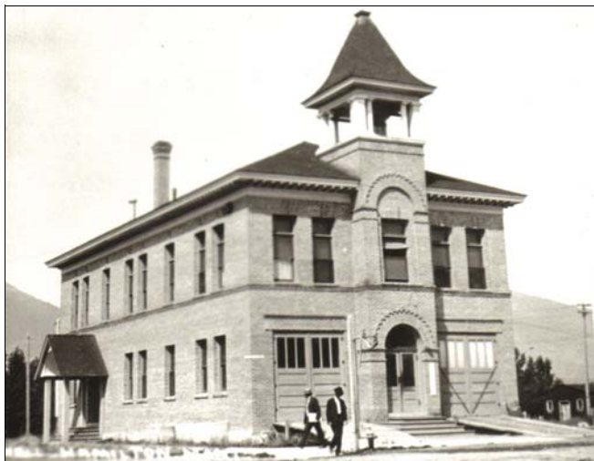
In 1906 the original City Hall also housed the fire department and public library. Today it is home to the Hamilton Volunteer Fire Department.

Hamilton's City Hall was erected in 1906 according to plans drawn up by architect A.J. Gibson (who also designed the original Courthouse and remodeled the Daly Mansion). The two-story brick building was designed to accommodate town officials, the fire department and a public library. The fire wagons and horses were kept behind the two sets of double doors flanking the main entrance to the building. The library was also located on the first floor with its entrance on State Street. Patrons often complained that library books smelled like horses. The city offices were on the second floor. Although the library and city offices were moved to their current locations the fire department is still here. The only major change has been the movement of the fire department truck doors from the front to the State Street side of the building.