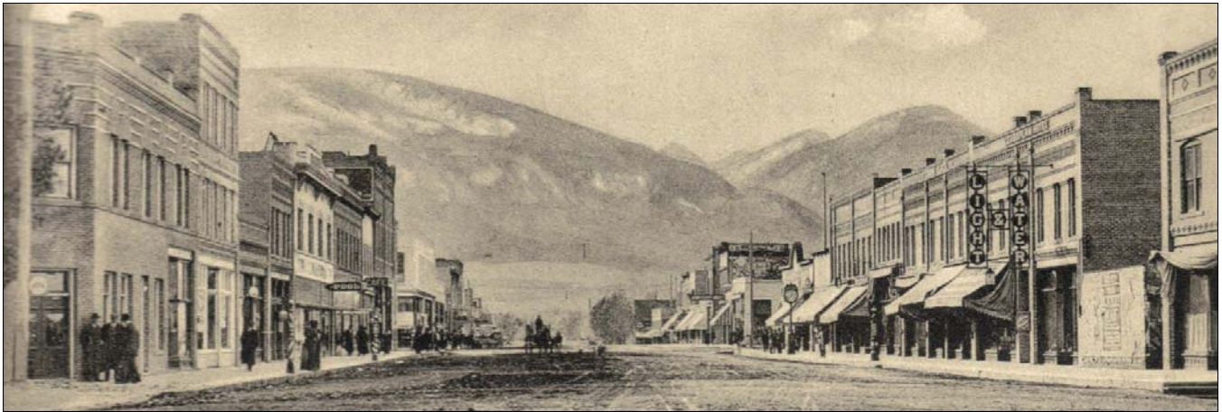
The first block of Main Street, circa 1915. The Peterson, Blindaur and Burns buildings can be seen on the right, The Hotel Hamilton is on the left corner and further down the street are the O'Brien, Daly, and "Yellow Front" buildings as well as the Lucas Opera House.