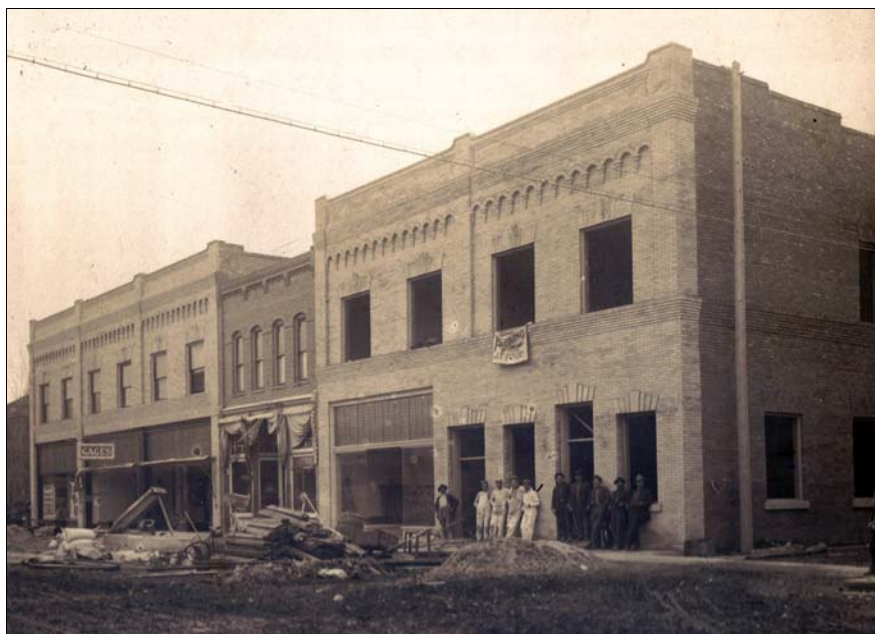
South Second Street under construction

This building was the first masonry building on South 2nd Street. It was built in 1895 in a simple vernacular style made of brick, which was later covered over with stucco. Perkins and Doran had a clothing store here. In 1911 it became the Star Theater and in 1919 the name changed to the Liberty Theater. In 1920 a pipe organ was installed at a cost of $8,000. The small 6-light window was the projectionist's window and still suggests its former use. This is the oldest building on this block and the only property to stop Drinkenberg and his associates from completing the entire quarter block in the 1910 style seen on either side.