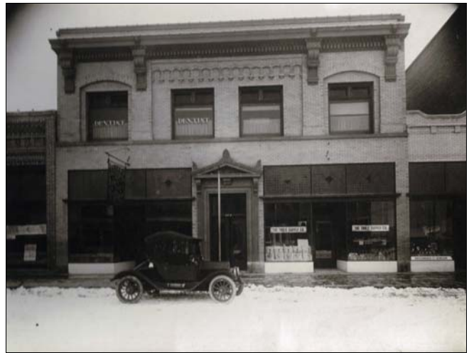
The McGrath building in 1912.