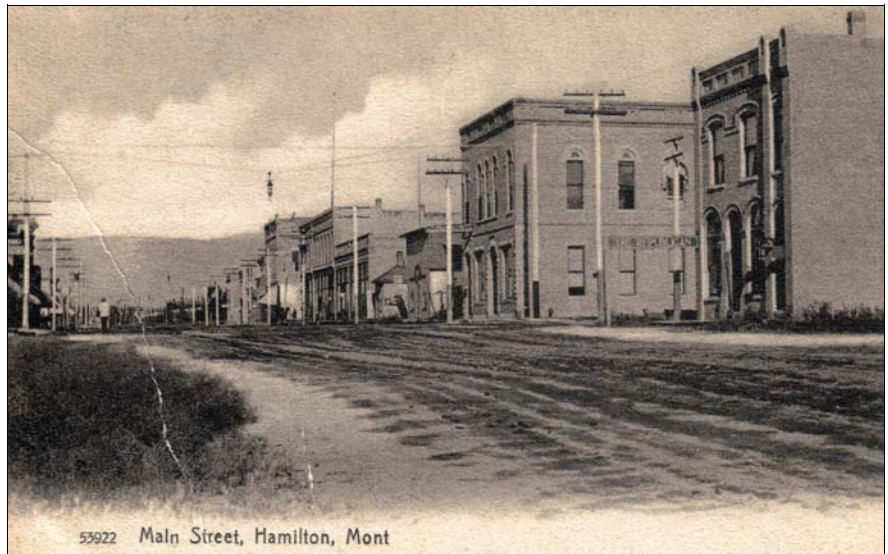
Main Street's south side at the 3rd and 2nd blocks. The buildings on the right were built by Marcus Daly and are still standing today. The first one was built in 1895 for the Ravalli County Bank, and the second (far right) was built in 1900 for The Ravalli County Democrat .

The post office was built in 1940 at a cost of $100,000 and remodeled extensively in 1997. The original entrance was located on Main Street, and the lobby has been preserved as a postal museum which includes a wonderful and now-rare WPA mural as well as historic postal equipment. The building has a timeless style with a contemporary classic motif and the original part of the building is the best example of late eclecticism of the modern style in Hamilton.