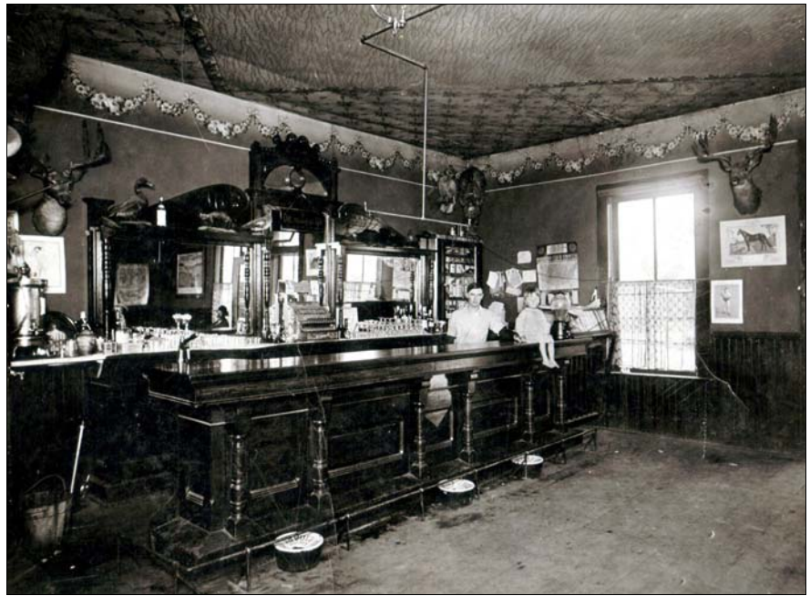
This was the bar of the Brunswick Billiard Parlor, located in the Peterson block.