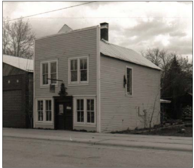
Built in 1895, this is the only remaining false front wood building to retain its original character. Photo courtesy of the Ravalli County Museum

Photo courtesy of the Ravalli County Museum