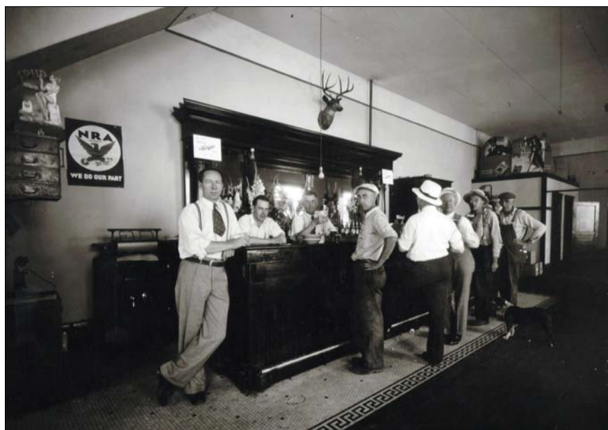
Before the Spice of Life there was Haigh's Pool Hall. This photo was taken in 1932, when women weren't allowed inside. While some things have improved it still retains a lot of its original character.