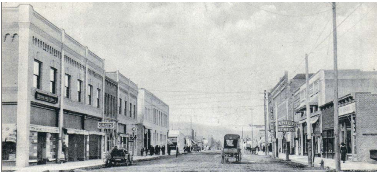
South 2nd Street in 1915.