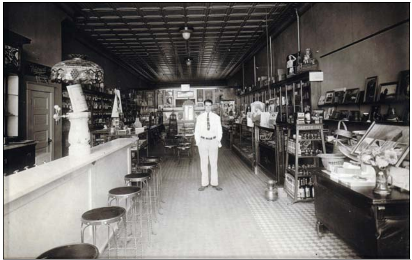
The Kendall Drug Store was well known for its soda bar in the 1920's. Notice the spittoon located for the convenience of the customers and all drugs are behind the counter. You can still get great refreshments at the same location in what is now A Place To Ponder.

room Hamilton Hospital, where it remained until the Marcus Daly Memorial Hospital opened in 1931. When the Chamber of Commerce vacated the building, the Kendall Drug Store, noted for its soda fountain featuring homemade ice cream, took its space. The Bitter Root Stock Farm offices, in turn, replaced it. In 1937 the Economy Grocery Store was located here, where it remained until the 1950's. Various businesses have occupied this building in more recent years but its appearance has not been significantly altered.