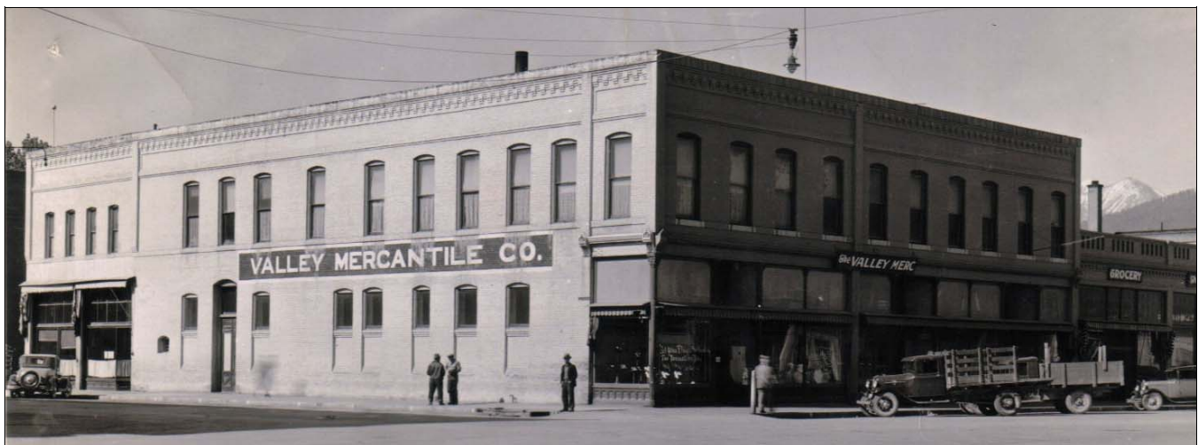
The Valley Mercantile was Marcus Daly's company store. This shot was taken in 1936, just before it burned down on March 5 of that year. It stood on the corner of Main & Second where the Bower Building now stands.