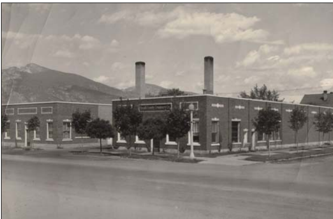
The Ravalli County Creamery Company as it looked in 1946. The original building on the right was built in 1933.