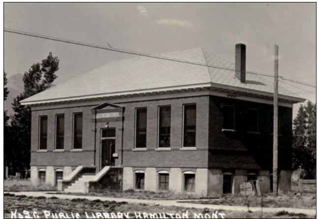
The Bitterroot Public Library retains much of its original character.

Built in 1916, on a site contributed by Margaret Daly, this library is one of the many erected throughout the United States with the funds donated by steel Magnate Andrew Carnegie. The architectural style is similar to other Carnegie Libraries of the period. Constructed of pressed red brick, the structure had the first slate roof in the town. The main floor consisted of a reading room and librarian's room while the heating room, storeroom and bathrooms were in the basement. The total cost of the building was $7,650 with $730 worth of furniture inside. Changes to the front entrance and a recent addition have not detracted from the original appearance of this building.