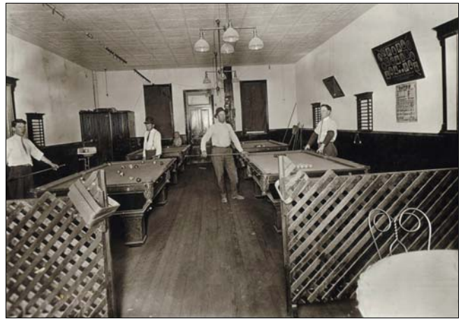
Playing pool in the Owl Pool Room was popular in 1915. Even though it has been remodeled, you can still play pool there today in what is now the Rainbow Room. Back in the old days Joseph Haigh sold cigars in the front of the pool hall.