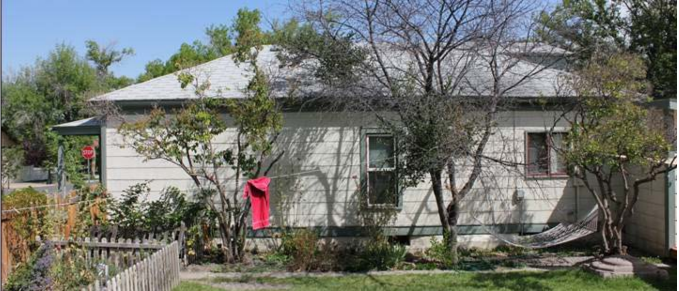
(above) View to the north, showing south elevation of original house. Photo by Kate Hampton, 2016.