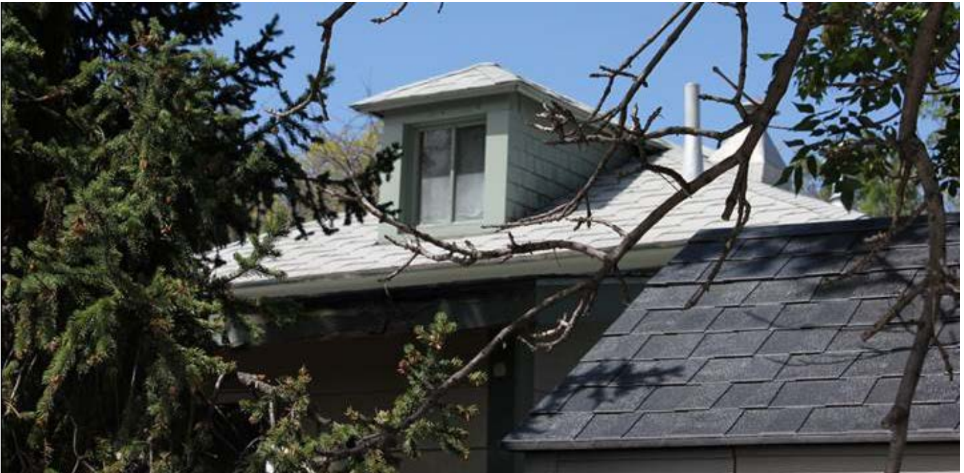
View to southwest, detail of east slope dormer (roof of modern metal shed in foreground).