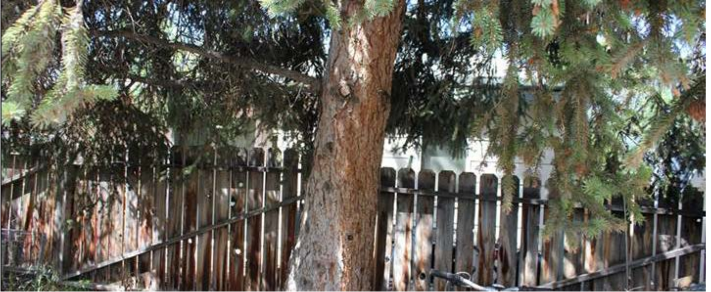
View to southwest, east elevation of modern addition.