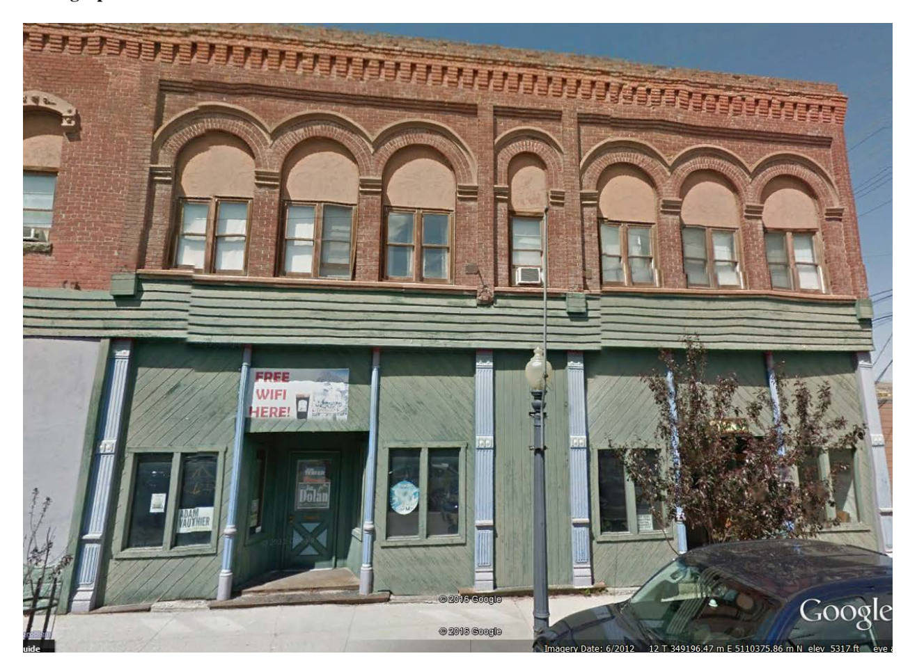
104-106 East Commercial Anaconda, MT South Façade, view North