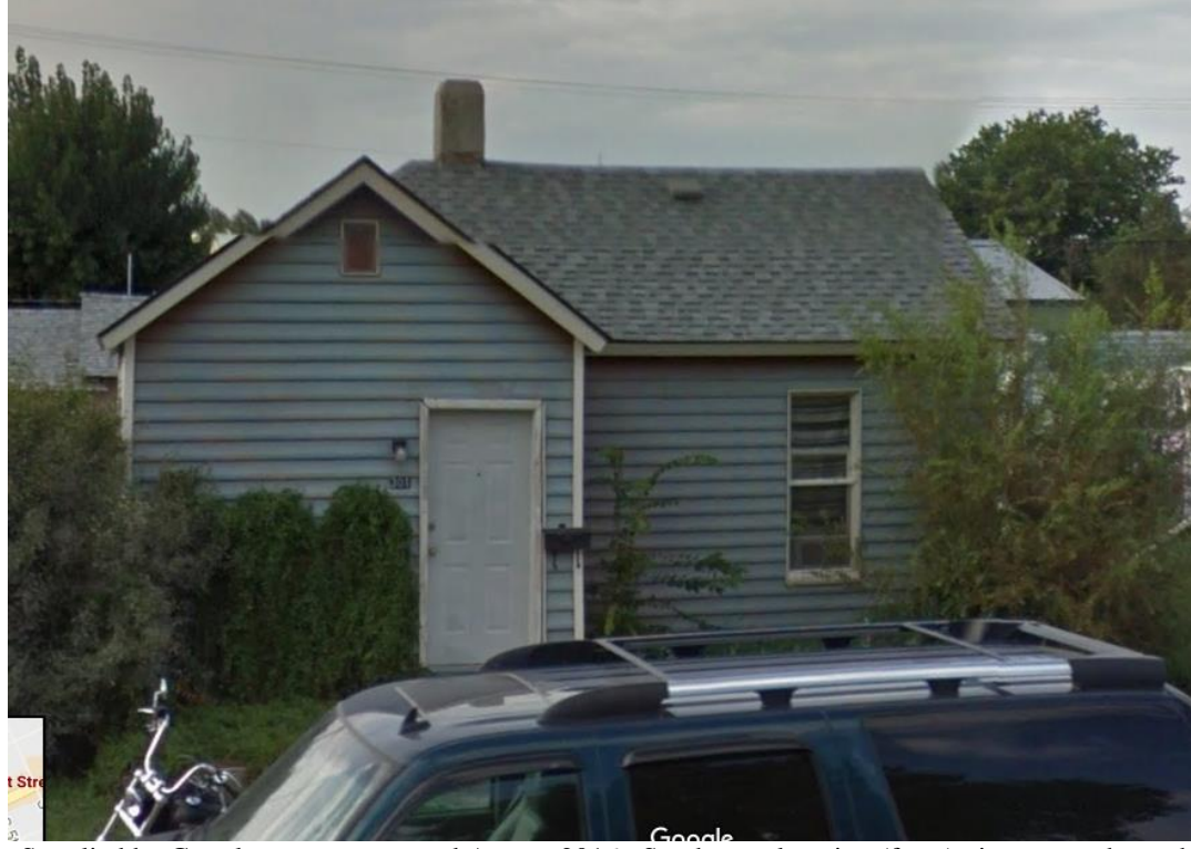
Southeast elevation (front) view to north-northwest.