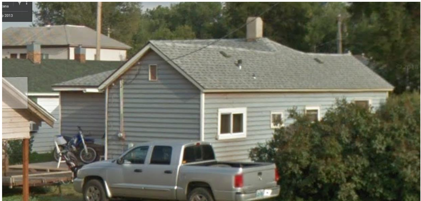
Northwest (rear) and southwest (side) elevations, view to east.