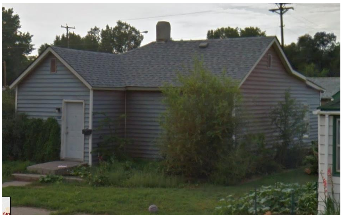
Southeast and northeast elevations, view to west-northwest.

Property Name: Charles and Milley Brown Home