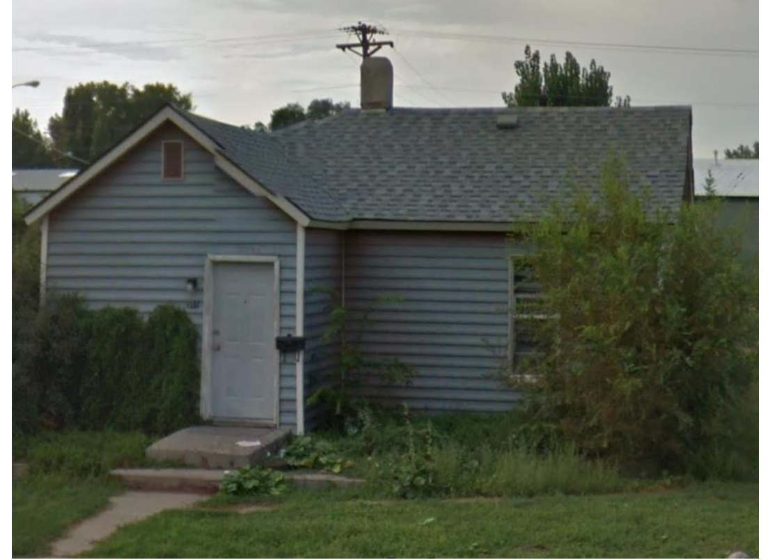
Photo Supplied by Google maps – accessed August 2016. Southeast elevation, view to northwest.