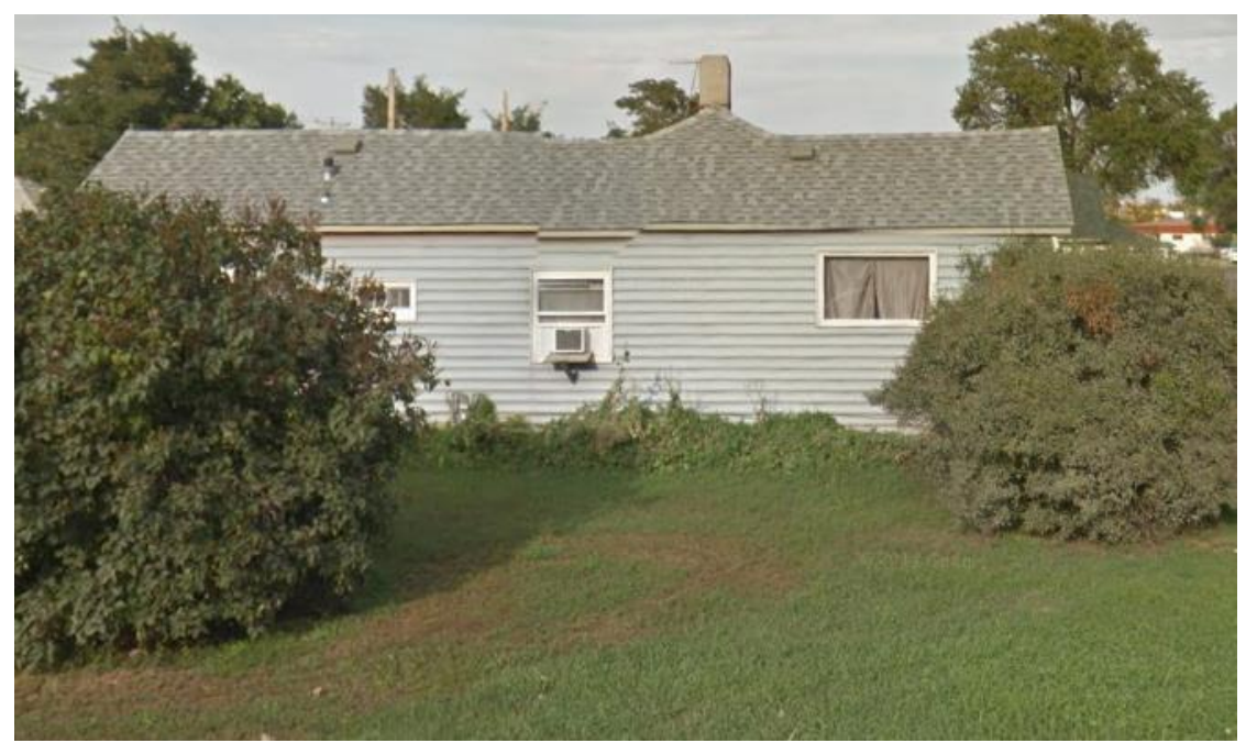
Photo Supplied by Google maps – accessed August 2016. Southwest elevation, view to northeast.