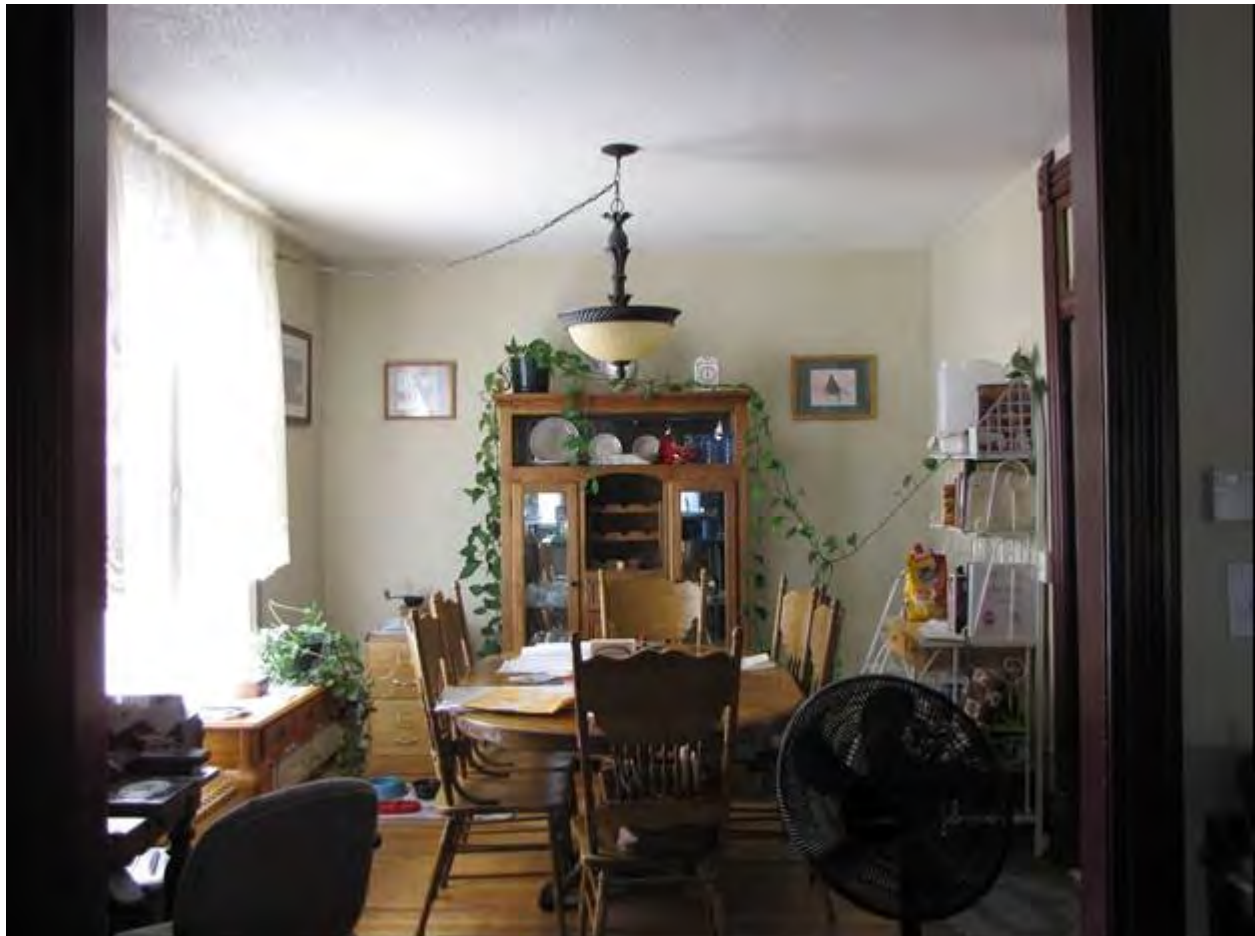
MT_LewisAndClarkCounty_Crump-HowardHouse_0006, Main House, interior, dining room, view to S from living room (from same angle as ca. 1923 photo appended above)