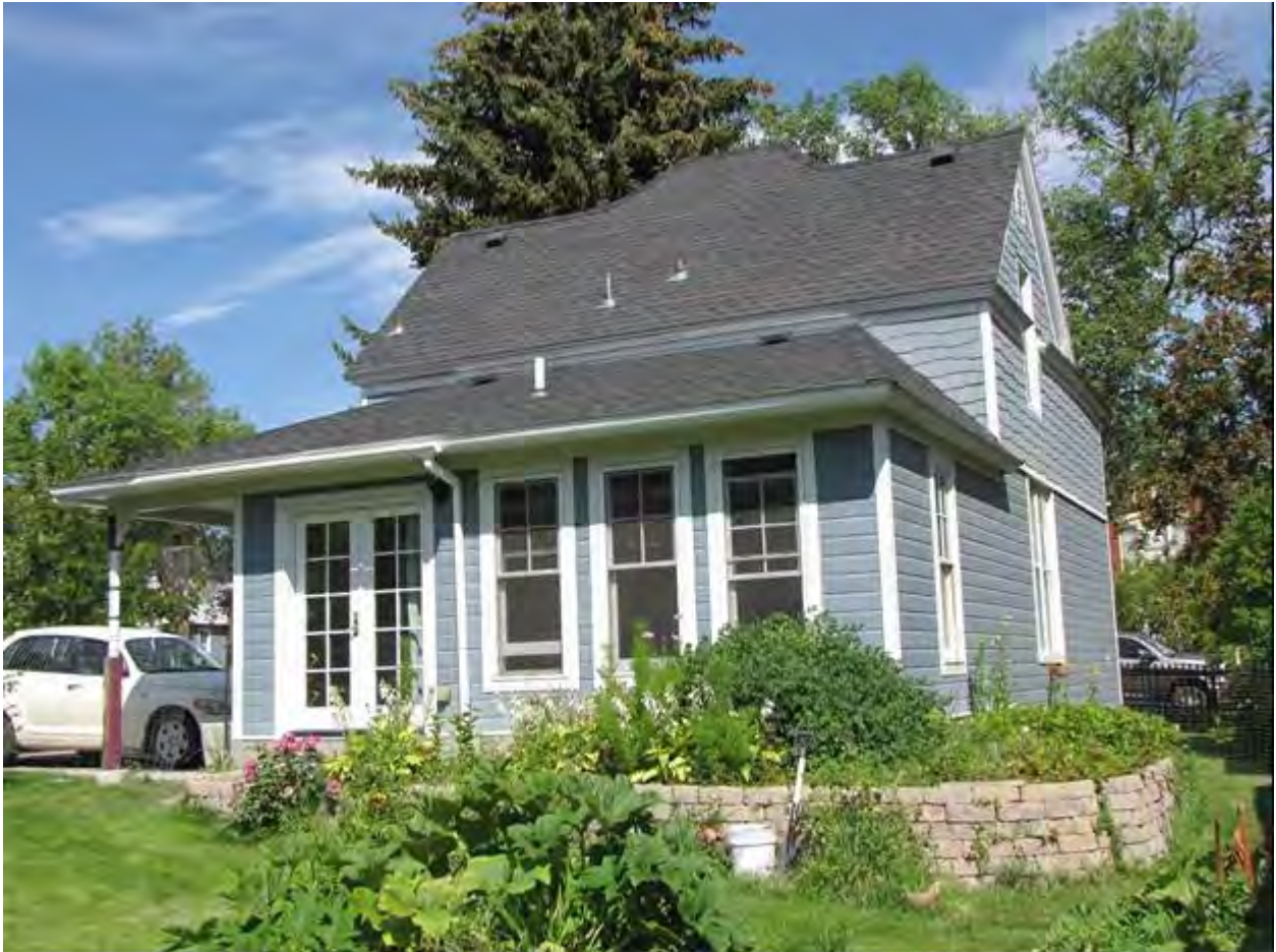
MT_LewisAndClarkCounty_Crump-HowardHouse_0005, Main House, south and east walls, view to N/NW