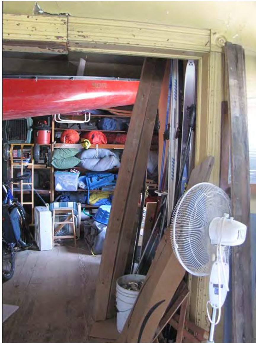
MT_LewisAndClarkCounty_Crump-HowardHouse_0012, Rear House, interior, original bedroom area in SW corner