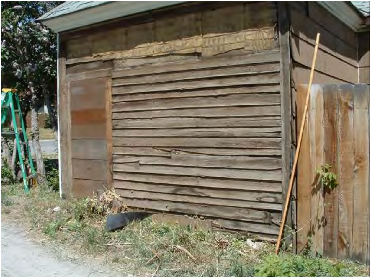
Historic Photo Figure 14: Rear house, south wall, with original siding and door opening

Section number Additional Documentation—Historic Photographs Page 44