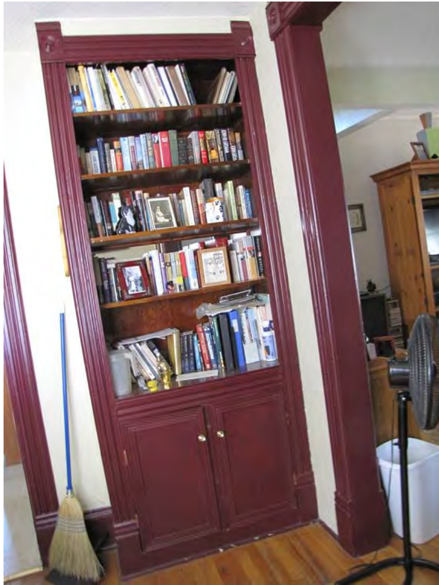
MT_LewisAndClarkCounty_Crump-HowardHouse_0007, Main House, interior, detail, built-in cabinet in NW corner of dining room