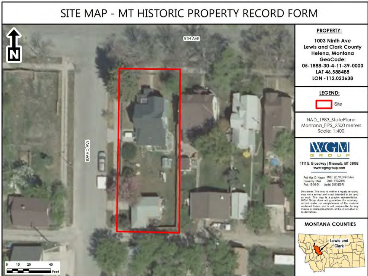
Aerial view of Crump-Howard House.