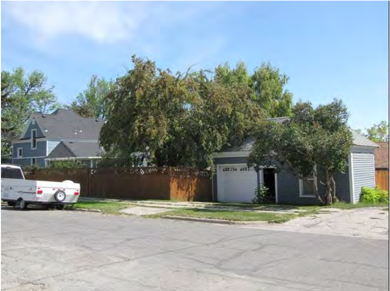
MT_LewisAndClarkCounty_Crump-HowardHouse_0002, Rear House, overview, view to NE