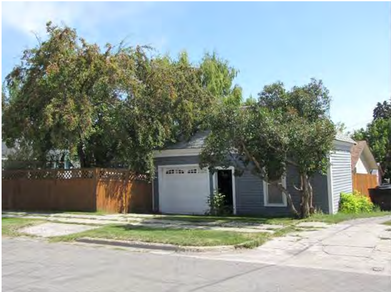
MT_LewisAndClarkCounty_Crump-HowardHouse_0009, Rear House, west and south walls, view to NE