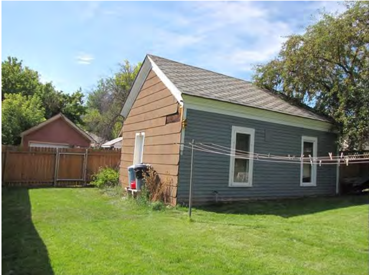
MT_LewisAndClarkCounty_Crump-HowardHouse_0011, Rear House, east and north walls, view to SW