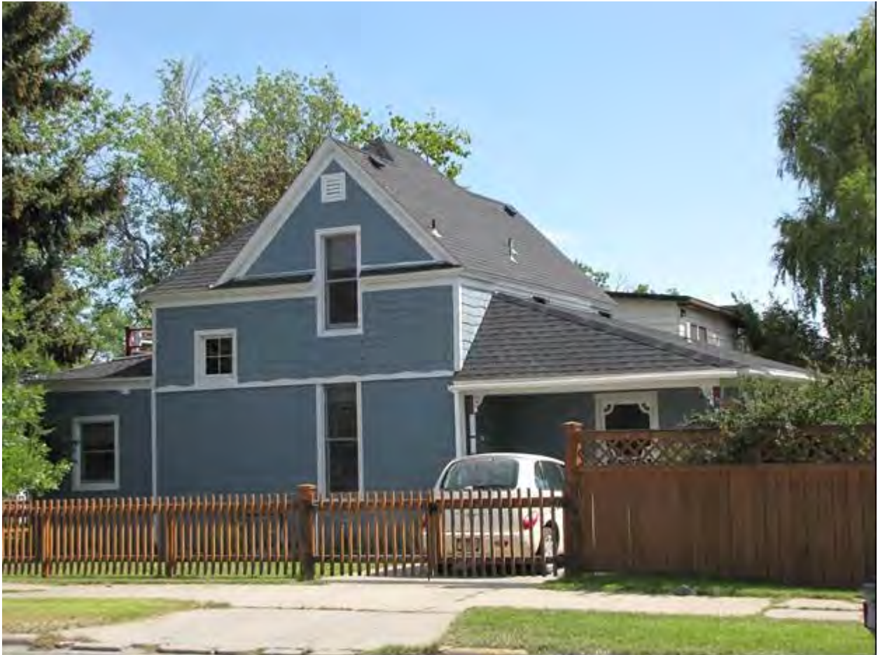
MT_LewisAndClarkCounty_Crump-HowardHouse_0004, Main House, west wall, view to E/NE