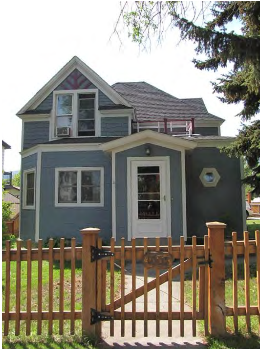
MT_LewisAndClarkCounty_Crump-HowardHouse_0003, Main House, north wall (façade), view to S