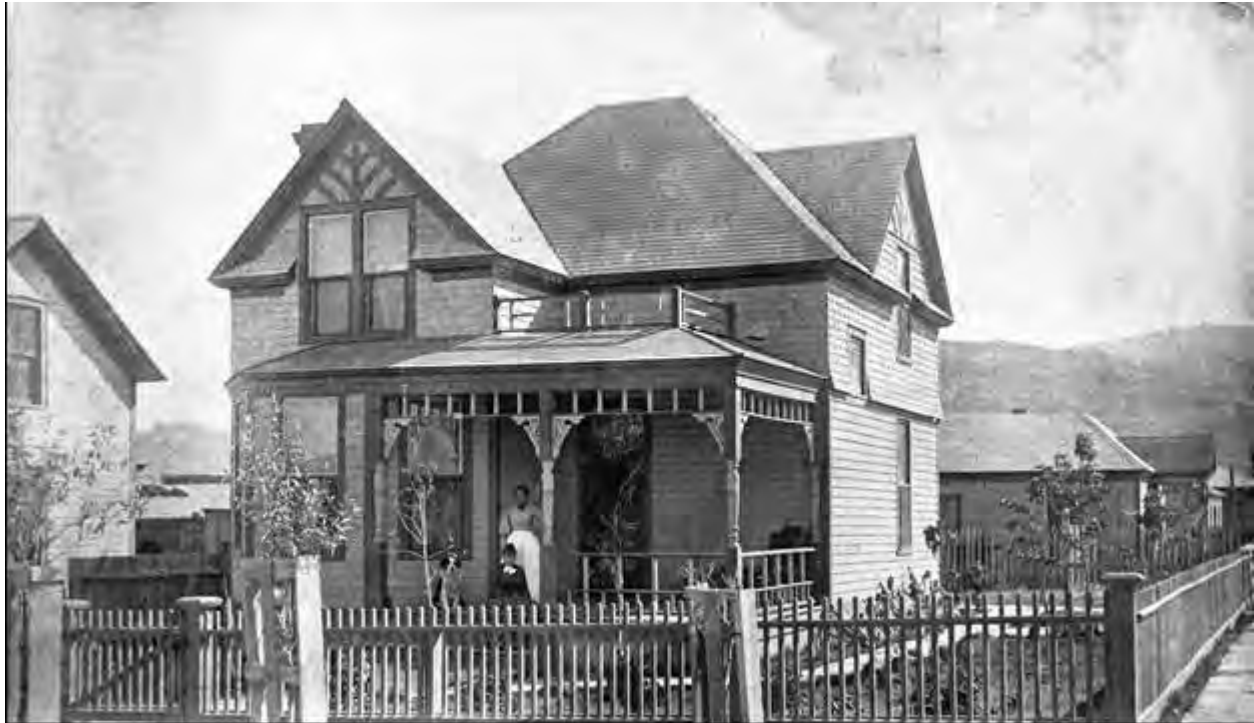
Historic Photo Figure 3: 1003 Ninth Avenue, Crump-Howard House, c. 1895. Montana Historical Society Research Center, Helena Montana, Catalog #Pac 79-53.1

Section number Additional Documentation—Historic Photographs Page 33