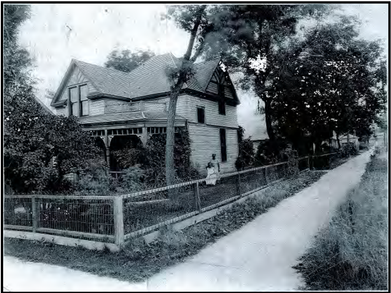
Historic Photo Figure 10: Clarissa Crump seated next to her home (with rear house visible)

Section number Additional Documentation—Historic Photographs Page 40