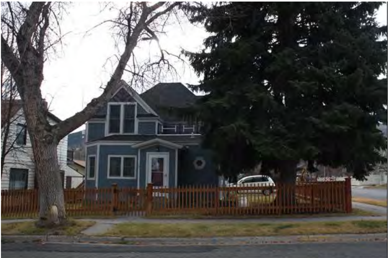
MT_LewisAndClarkCounty_Crump-HowardHouse_0001, Main House, overview, view to S.

Name of Property: Crump-Howard House (1003 9 th Avenue) City or Vicinity: Helena County: Lewis and Clark State: Montana Date photographed: November 18, 2015 and August 23, 2016