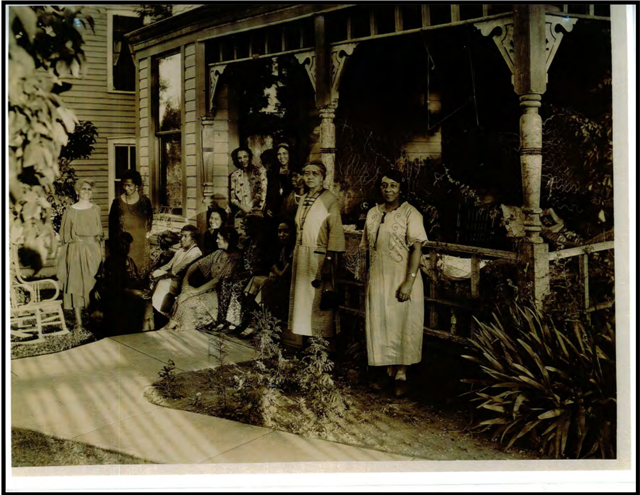
Historic Photo Figure 9: Pleasant Hour Women's Club in front of Crump home

Section number Additional Documentation—Historic Photographs Page 39