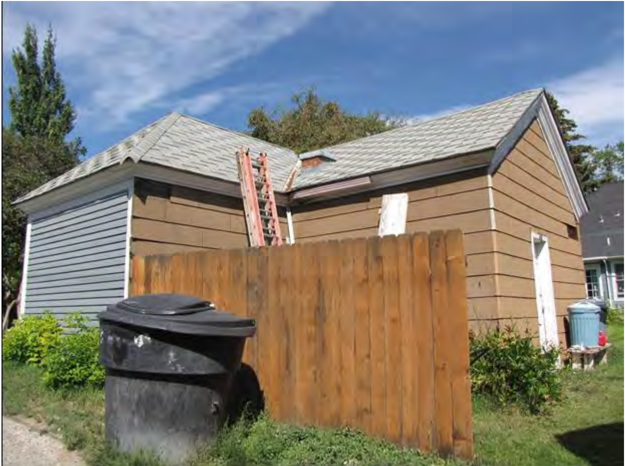
MT_LewisAndClarkCounty_Crump-HowardHouse_0010, Rear House, south and east walls, view to NW