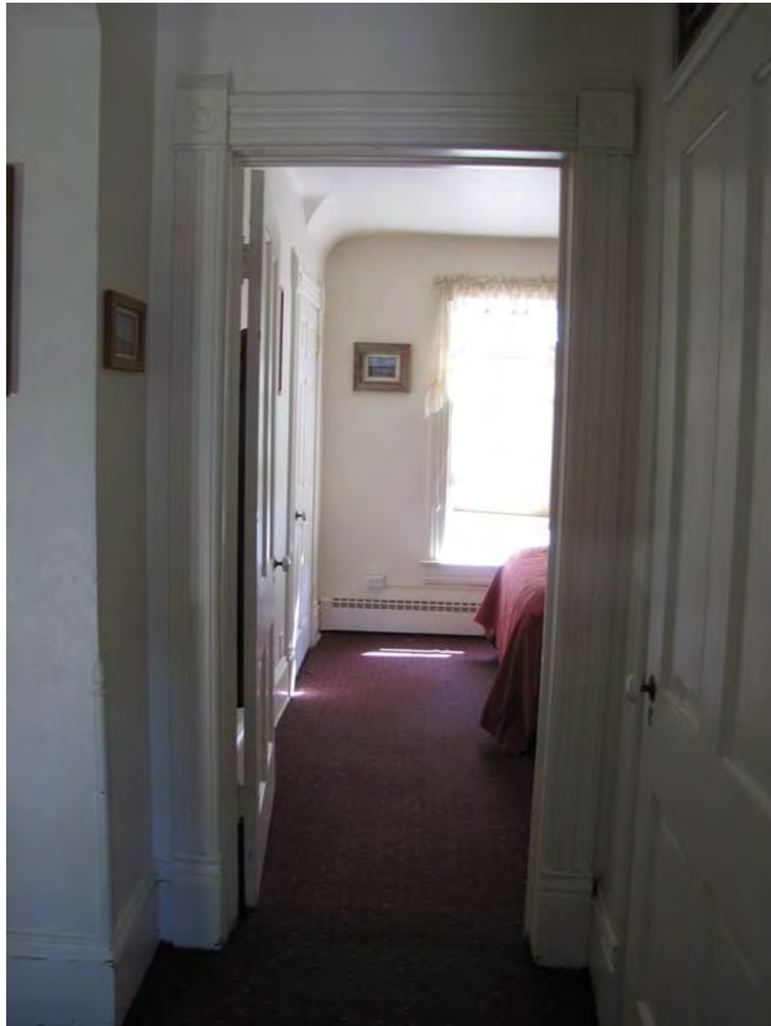
MT_LewisAndClarkCounty_Crump-HowardHouse_0008, Main House, interior, upstairs SE bedroom from hallway with bathroom door at right