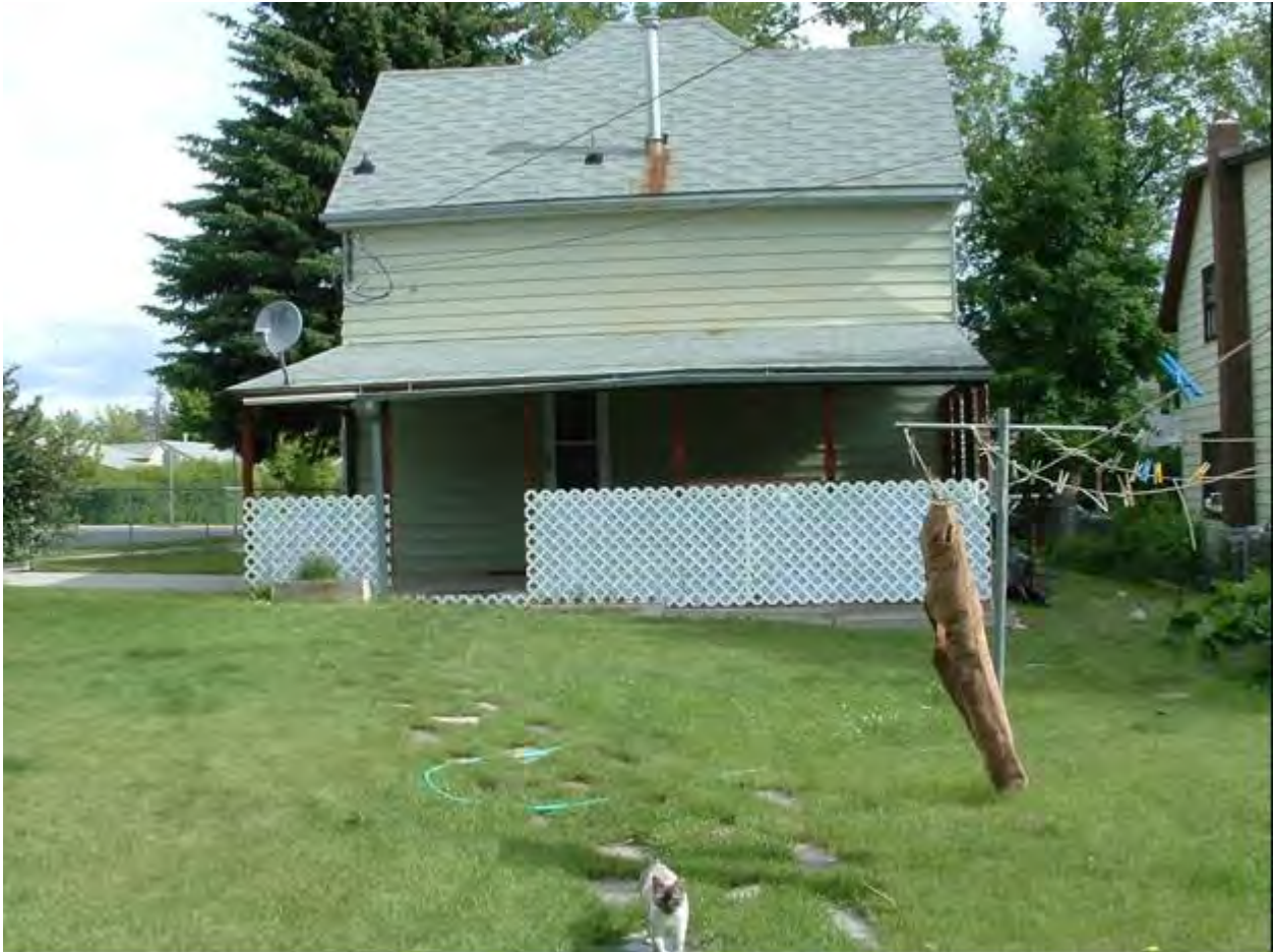
Historic Photo Figure 12: Carport on south wall (built 1960)

Section number Additional Documentation—Historic Photographs Page 42