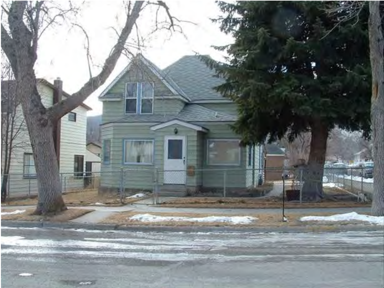
Historic Photo Figure 13: 1003 9th Ave. during aluminum siding era (1962-2008)

Section number Additional Documentation—Historic Photographs Page 43