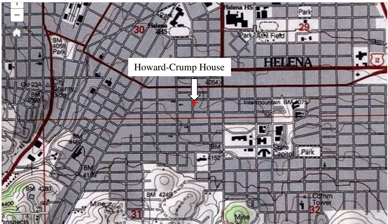
Location of the Crump-Howard House. Found on the Helena 7.5' quadrangle map.