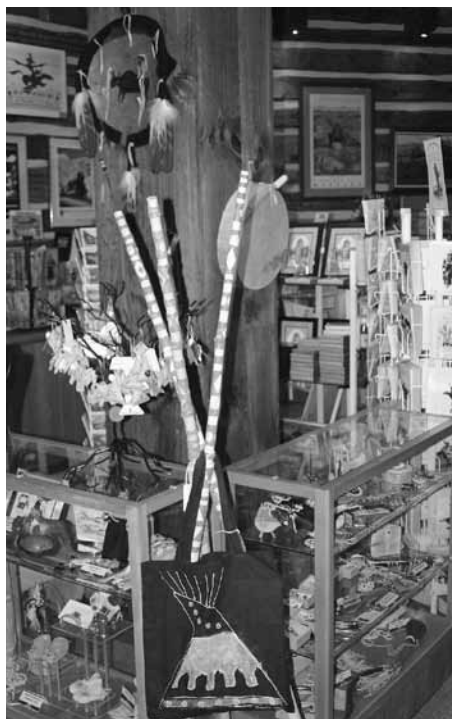
The Museum Store features a great collection of Native American art and authentic reproductions of traditional items made by Montana Native Americans.

"It's vital to us to offer made in Montana items, original art from Native Americans, and other materials that speak to our Montana and Western America history buffs," she said. ⚡