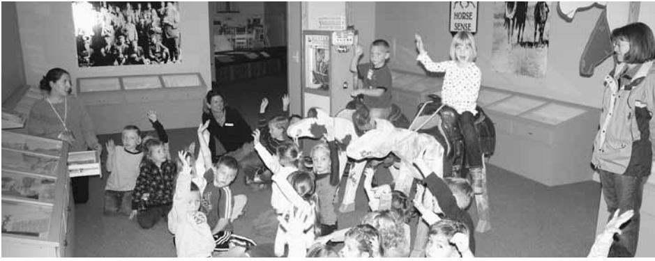
Kids of all ages have fun in the Society's new "Young at Heart Montana" exhibit. A joint venture of the Museum, Research Center and Outreach and Interpretation Programs, the gallery is by the "Montana Homeland Exhibit," and helps parents, grandparents, and guardians engage youngsters in learning about their past in an exciting, hands-on way.