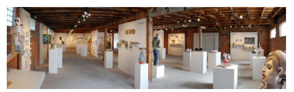
Archie Bray gallery

When you come to MHS, the State Capitol building and the Original Governor's Mansion this summer, consider adding a stop at the Bray.