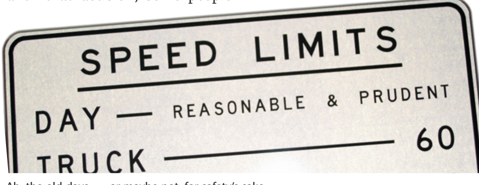
Ah, the old days . . . or maybe not, for safety's sake

The Montana Department of Transportation reproduced this sign that was once posted along the state's highways, and it has been added to the Society collection. It will be featured in the exhibit, which is scheduled to open in January 2014. It is a reminder of how fast history goes, even in the rearview mirror. 😚