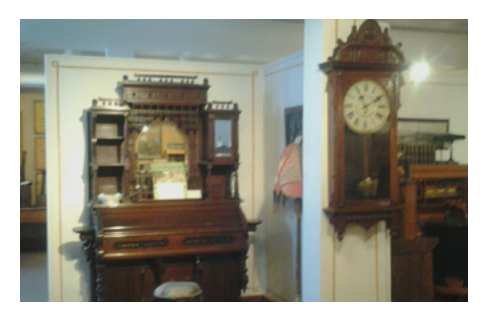
Copper Village tells the timeless history of Anaconda.

Copper Village's historical archives are a work in good progress and are an important part of