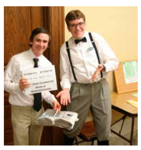
Even the House pages dressed in period costume for the reenactment.

The new wings of the Capitol were built in 1911 and 1912 and finished for the 1913 session. The Senate passed a resolution in 1913 thanking the three artists for their work in not only making the Capitol beautiful but also reflecting