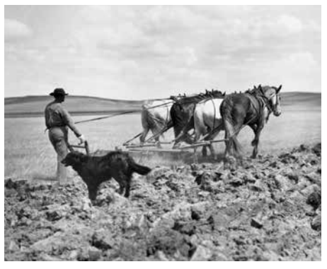
This L. A. Huffman photo titled "The Honyocker" from the MHS collection starred in the Super Bowl and on our social media network. (981-176)

We are now streaming some of our programs and events on YouTube so that people across the state and the world can enjoy them. We also are blogging and posting on Pinterest, Twitter, and Flickr. Go to our home page at www.montanahistoricalsociety.