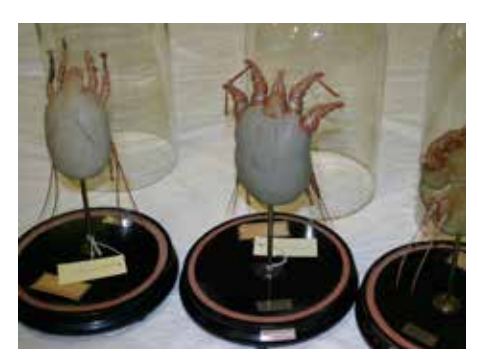
Now MHS really has what has been bugging you (actually, your livestock) in its collection.

When he got back to Montana, the models and their glass cases arrived as a gift to his office. Recently, the Department of Livestock donated the models to MHS so that people in the future won't