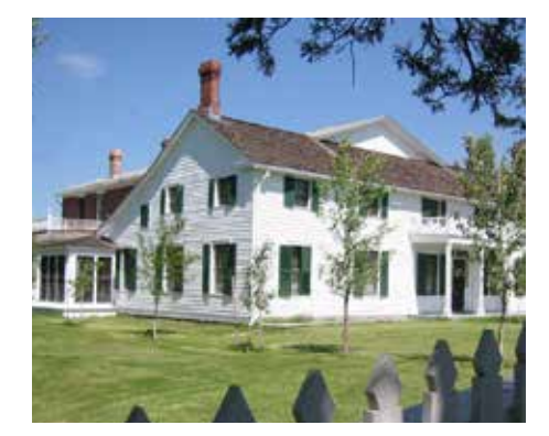
A visit to the Grant-Kohrs ranch near Deer Lodge will "get your cowboy on."

The ranch can bustle with activities or seem quiet. Tours of the main ranch house are offered yearround. Other ranger-led activities, such as chuck wagon programs, cowboy talks, blacksmith demonstrations, hands-on ranger choice programs, and wagon tours, are offered seasonally. For kids, there are junior ranger booklets, roping lessons, and visiting with the horses, cows, and chickens. The ranch also has seven miles of walking trails.