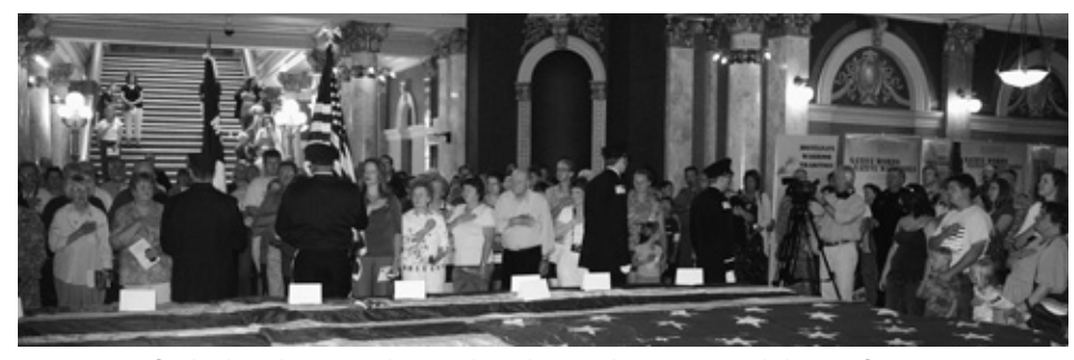
Montanans flocked to the Capitol rotunda to honor the nation and the 911 flag.

The Society was saddened in November with the news that Gen. Womack had died. But his legacy and that of the others will continue.