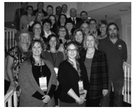
The staff of the Montana Historical Society pitched in to make a great Mountain Plains Museums Association conference—the best they've ever had up north!

But 329 members were drawn to Big Sky Country for the con-