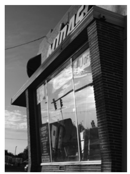
The design and materials make this storefront a part of "Modern Montana."

Montana Modern (cont. from p. 1) expansion in the late 1940s through the 1950s, and many public buildings and storefronts date to that era.