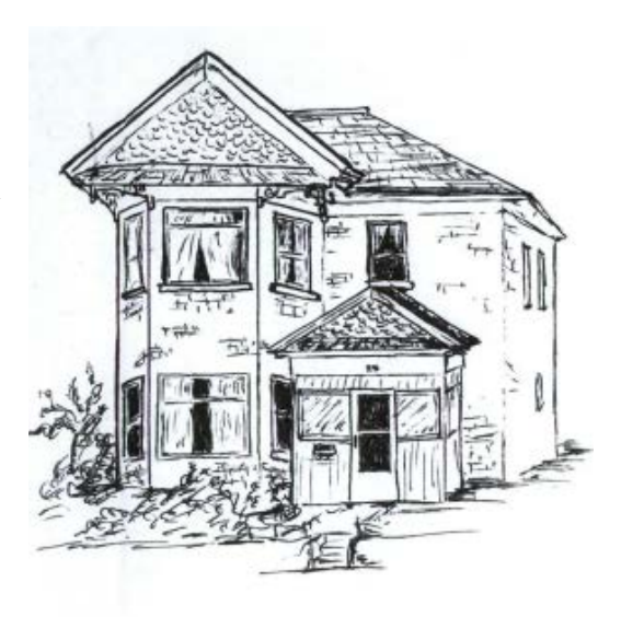
715 W. PARK, BUTTE, MT

A stone retaining wall defines the south side of 715 West Park's small front lawn. A flight of four concrete steps lead from the sidewalk to a decorative metal gate. The gate connects to decorative metal fencing that runs along the top of the retaining stone wall. Behind the gate, a concrete path leads to a half-step at the front door of the home. Both buildings on either side of 715 West Park are extremely close in proximity to the house, therefore the sides of the home have little space and are mostly empty. The rear yard of the house contains a detached rectangular wood frame garage. A wooden privacy fence running from the southeast corner of the garage to the neighbor's garage to the east blocks any view of the rear yard.