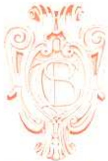
Old Silver Bow Club design on the second story of the Miners Union Hall. No. 13