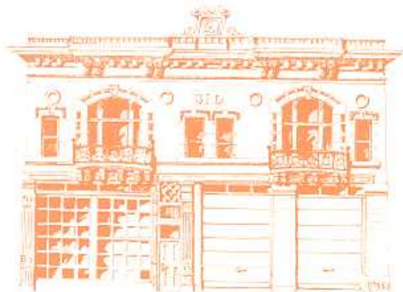
The Old Butte Fire Hall, No. 17; now houses the Butte-Silver Bow Public Archives in its second floor.

Continue north on Washington Street for one more block to your point of origin. We hope you enjoyed your tour. A walking tour of the west side mansions is available in the Arts Chateau (Charles Clark Mansion). Please let us know if you have any further questions.