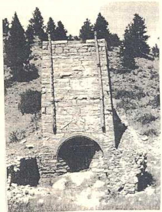
Montana Historical Society