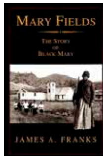
Mary Fields: The Story of Black Mary is a best-seller at the MHS Museum Store.

Mining Childhood , also published Books (cont. on p. 4)