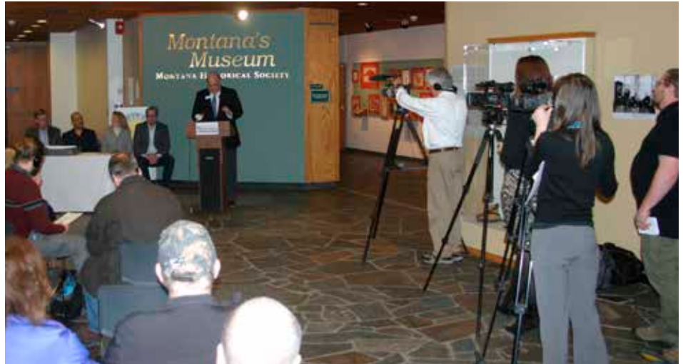
Electronic and print reporters gathered at MHS for a major press conference on the Anzick Collection.