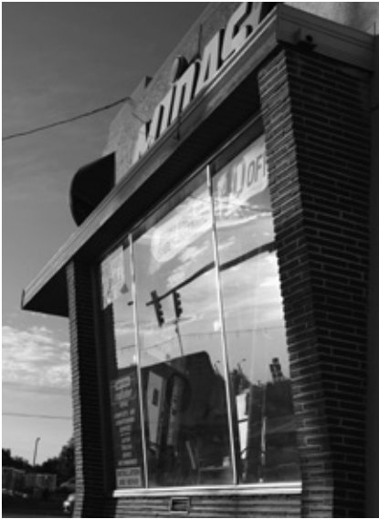
The design and materials make this storefront a part of "Modern Montana."

Montana Modern (cont. from p. 1) expansion in the late 1940s through the 1950s, and many public buildings and storefronts date to that era.