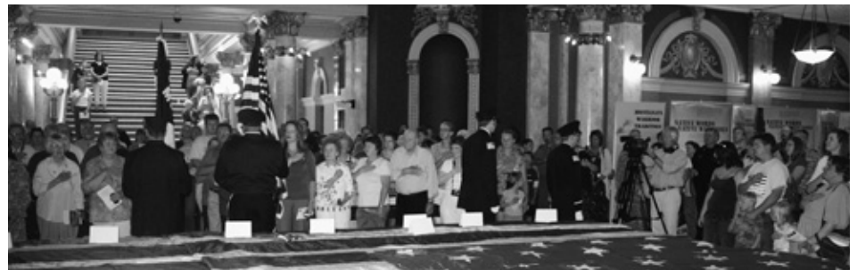
Montanans flocked to the Capitol rotunda to honor the nation and the 911 flag.