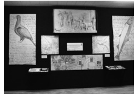
The Gateway Museum in Livingston has a new look.