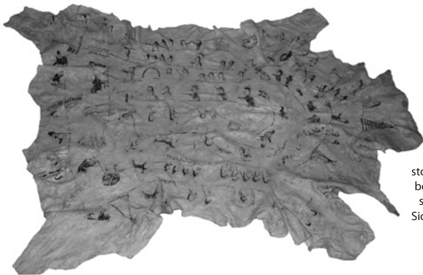
The art of storytelling can be beautiful as shown by this Sioux history in the exhibit.

You can log on to www.montanahistoricalsociety.org to learn more about the Society's great archives. ⚡