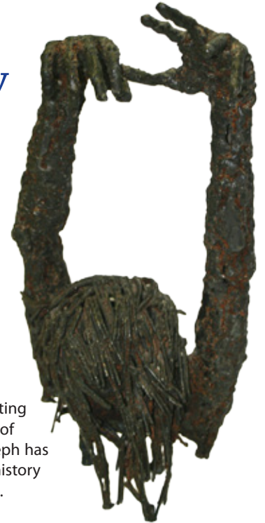
This haunting sculpture of Chief Joseph has a mystic history of its own.