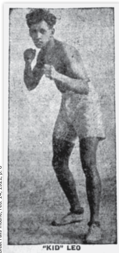
Great Falls Tribune, Feb. 14, 1921, p. 6

In 1920, the federal census recorded 209 black residents of Great Falls. Of the 85 people who responded to the AME Church's 1922 survey about employment questions, most worked in low-paying