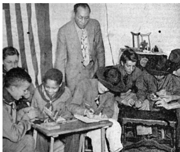
Great Falls Tribune, Feb. 10, 1946, Parade sec., 12