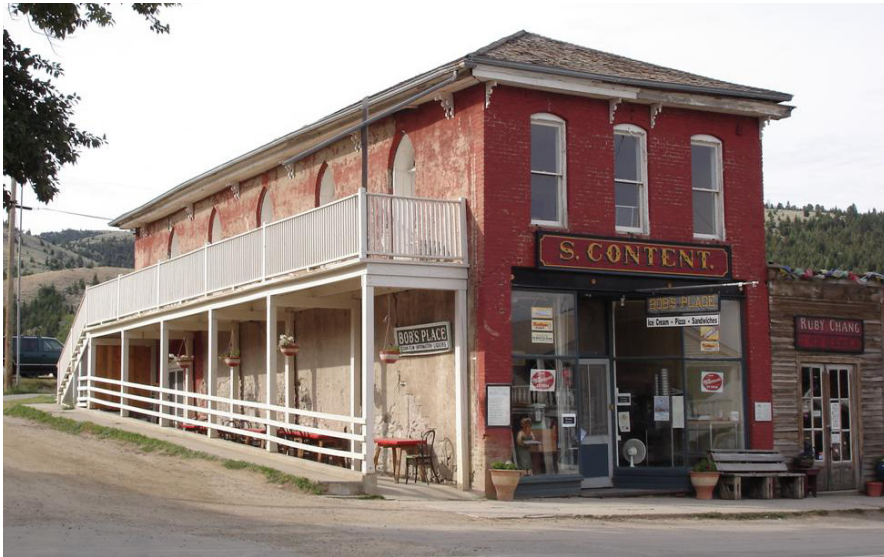
Virginia City National Historic Landmark, Madison County