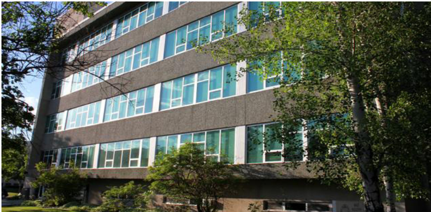
Walt Sullivan Building (Department of Labor and Industry), Helena

This amendment to the State Antiquities Act added new stewardship responsibilities to the SHPO and the Board. The SHPO is a department of the Montana Historical Society, staffed with preservation professionals with expertise in evaluating and listing properties in the National Register of Historic Places; maintaining an inventory of all heritage properties; disseminating information regarding historic properties; assisting local, state, and federal government agencies in comprehensive planning for the treatment of heritage properties; and consulting on the impact of projects on heritage properties, among other duties outlined in MCA 22-3-423. SB3 further requires SHPO to report the information received, and the ensuing recommendations, from this agency reporting to the appropriate legislative interim committee.