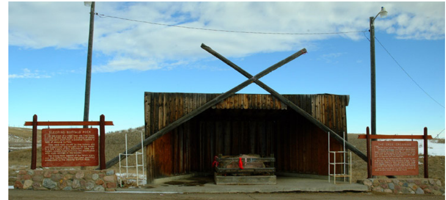
Sleeping Buffalo Rock near Saco

As with any such varied group of reporting agencies, with distinct missions and staffing, and different funding levels, several best practices became apparent. These practices resulted in successful outcomes for the agencies and the heritage properties under consideration. Several agencies benefited from compliance with the existing State Antiquities Act, primarily in taking advantage of the consultation offered by SHPO and of this reporting effort. The act of reporting in accordance with SB3 was approached by some agencies as an opportunity to evaluate their preservation practices and by others as a validation of their efforts. Some agencies demonstrated lack of commitment and understanding, which becomes an excellent starting point for improvement. This also indicates the need to consult with SHPO and to view SHPO as a resource and not an impediment. For instance, Montana State Parks' report presented a straightforward practice of consultation with SHPO, ensuring that the work complied with the Secretary of the Interior's Standards for the Treatment of Historic Properties . Other agencies, such as MDT, have entered into programmatic agreements with SHPO that outline procedures for addressing certain projects that impact heritage properties. MDT rightly perceives this as an effective management tool for a state agency to administer its heritage properties.