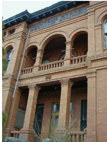
Historic Montana School for the Deaf and Dumb Administration Building, Boulder

Of the 437 documented heritage properties, only 265 were reported on in 2012. Many of the unreported properties are those managed by DNRC, which has proposed to report on twenty to thirty properties each year over a 10-year period, in an effort to address their responsibility for 244 of the known heritage properties, more than half of the total. It is common knowledge that there are also numerous unknown, undocumented, and unresolved state-managed potential heritage properties throughout Montana. Other unreported properties represent outstanding questions of responsibility for the management of properties on state-owned land. Grey areas exist with the properties managed by several agencies, such as DNRC, MDT, and DMA. For instance, MDT manages small tangential sections of larger archaeological sites owned or managed by others. The number of sites with such divided ownership is undocumented.