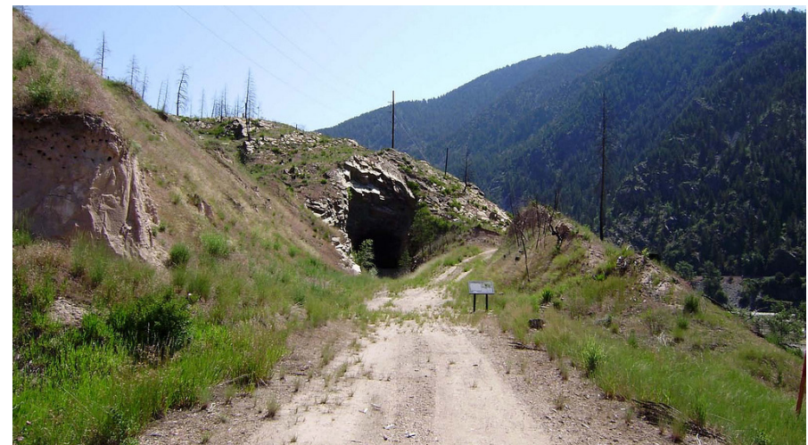
Point of Rocks Historic Transportation Corridor (Mullan Road & Milwaukee Railroad), near Alberton

Four of the agencies – MDT, DNRC, Parks, and UM – have a consistent history of consulting with SHPO. Three agencies – DNRC, Parks, and the University System (Regents Policy) - have their own rules, methods and procedures for consideration of impacts to heritage properties and consultation with SHPO. Consultation – and in-depth understanding of the process – is aided greatly by those agencies which have heritage specialists on staff: MDT, Parks, Montana Heritage Commission, and DNRC.