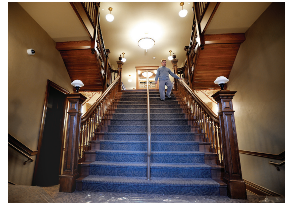
Flathead County Courthouse $2.7M building rehabilitation, Kalispell

Nonetheless, the overall stewardship costs are reported to have been $5 million. Of this, nearly $3 million was dedicated in 2010-2011 to restoration projects and $1.1 million to maintenance. Of this, some success stories shine out as excellent examples. Montana State Parks utilized a National Park Service Save America's Treasures grant of $293,400 to stabilize seven buildings at Bannack State Park and other funds to make various repairs to Chief Plenty Coups House, including a new fire protection system. The Bannack State Park work included re-plastering of the Hotel Meade and leveling of the foundation with helical piers. The Montana Heritage Commission continues to preserve buildings in Virginia and Nevada Cities, supplemented by a $100,000 HB645 preservation grant awarded in 2009. The University of Montana has expanded their recognized historic district to include buildings of the modern era. These examples of creative funding and forward thinking generate greater preservation opportunities.