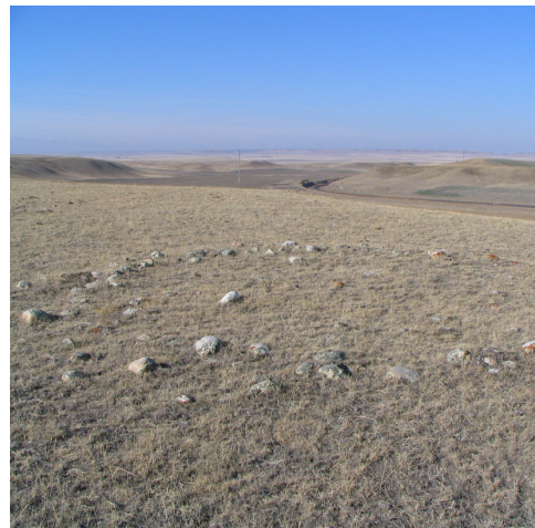
Stone Circle (Tipi Ring) Archaeological Site, Pondera County