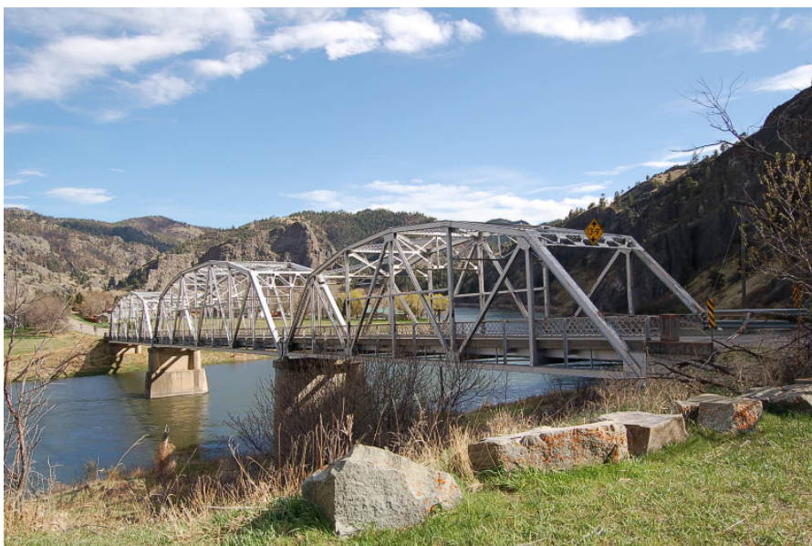
Hardy Bridge, Cascade County