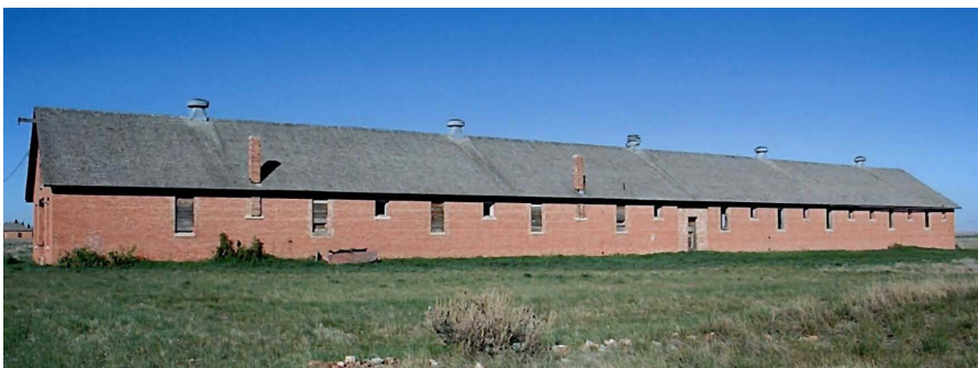
Fort Assiniboine Post near Havre, Hill County

This first biennial report to the Montana State Legislature fulfills the intent of the revisions to MCA 22-3-422, 22-3-423, and 22-3-424. This report is based upon the information submitted by eleven state agencies that manage heritage properties on state-owned land and provides insightful information to their administration, interpretation, and operation. In assessing the strategies employed by the agencies, the SHPO and Montana Preservation Review Board have articulated twelve key findings about the current state of property stewardship. These have generated six overarching recommendations on how the state can continue to improve performance in these areas.