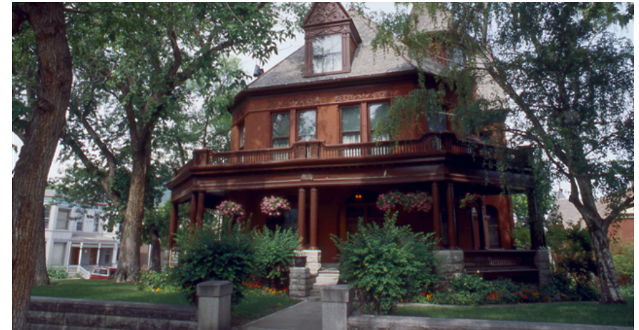
Original Governor's Mansion, Helena