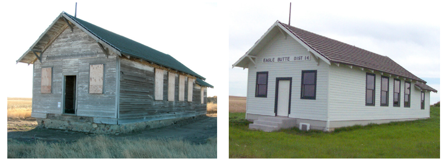
Eagle Butte School - before and after restoration by volunteers, Choteau County