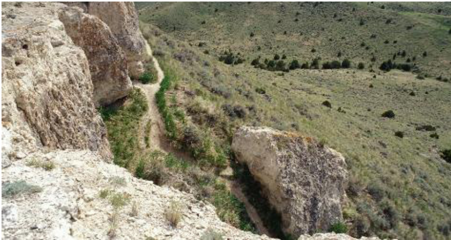
Madison Buffalo Jump State Park, Gallatin County Cover photo: Masonic Hall; Bannack State Park, Beaverhead County