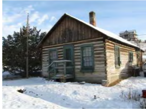
Governor Meagher Cabin

In 2015-2016 MHC preservation crew have replaced the flooring; roof and are in process of electrical and plumbing upgrades. Please see 2015 MHC Annual Report for detailed information.