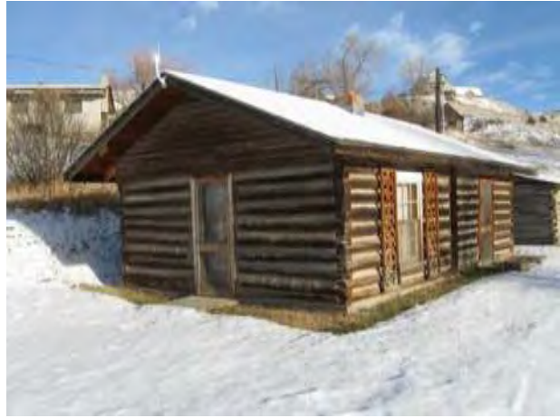
School House Cabin

This was the Home Park School which was moved here in 1977.