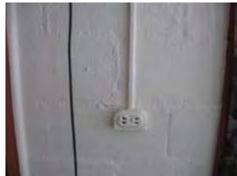
Electrical upgrades needed