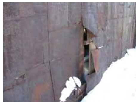
North wall failing