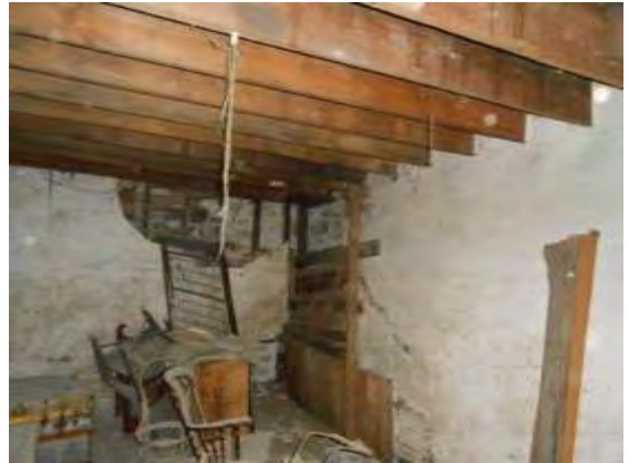
Major stabilization repair needed to ice house