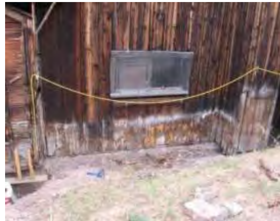
Before - False concrete foundation is removed from the south side of Corbett house which then reveals rotten boards.