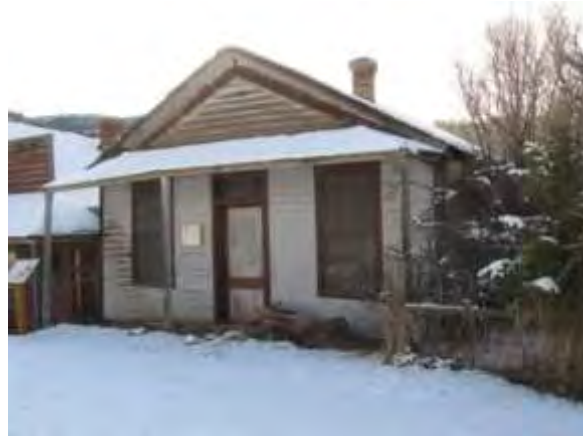
The cabin needs a new foundation, roofing and framing stabilization and a new roof