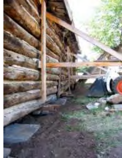
Stabilization treatments were done to the building including digging five footings