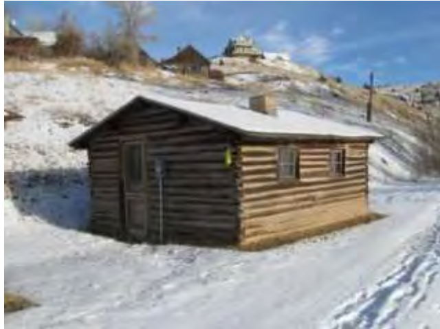
Axolotl Lake Cabin

Charlie Bovey moved this cabin to its current location from Perrault Ranch in 1977.