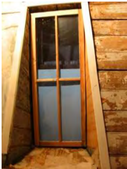
Skylight after preservation work