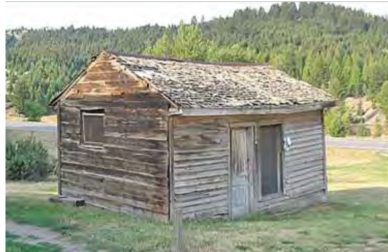
New siding, foundation, roof needed