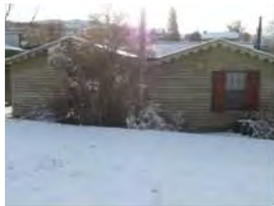
Cabins 5 & 6