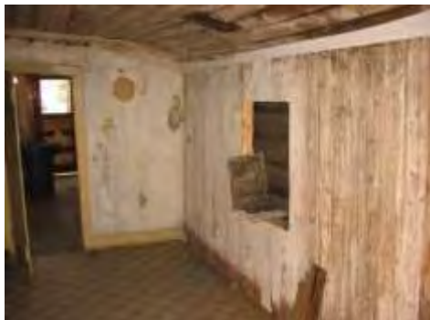
Before - preservation of western wall