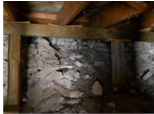
Stabilizing timbers are a temporary solution for this unreinforced wall