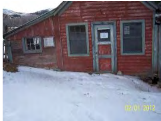
Left side – unpreserved "Hotel"