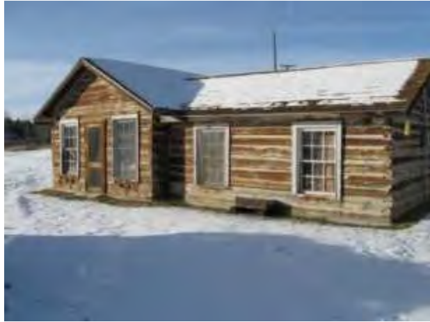
New roof is needed