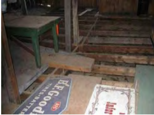
Floor is deflecting and in need of stabilization