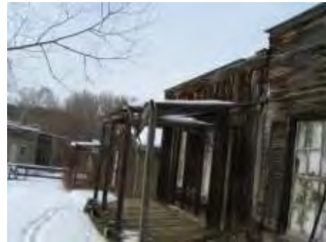
False fronts need to be stabilized and repaired throughout all the cabins