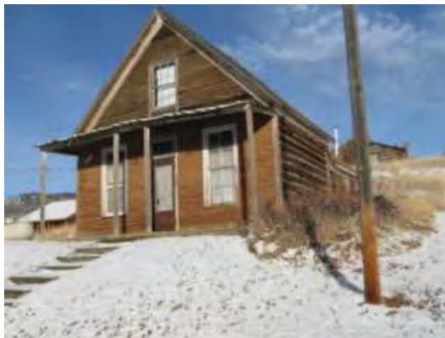
Lightning Splitter needs a new roof