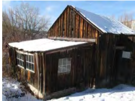
Cabbage Patch Barn. Entire Cabbage Patch complex needs to be jacked up, stabilized and sill logs and plates replaced.