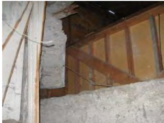
East wall removed