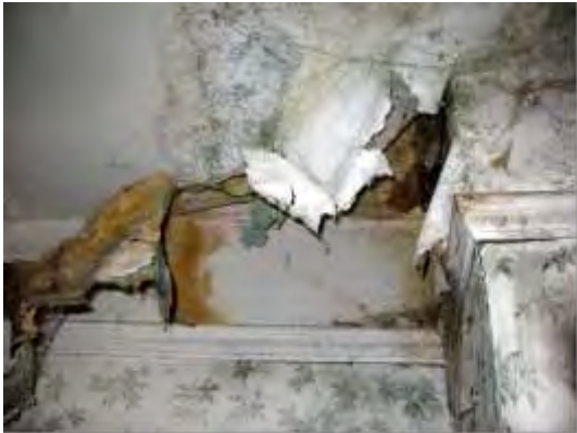
Above – Water damaged lath and plaster is assessed to provide an access point to the attic.