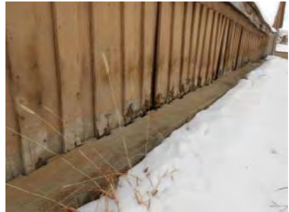
North wall needs repair