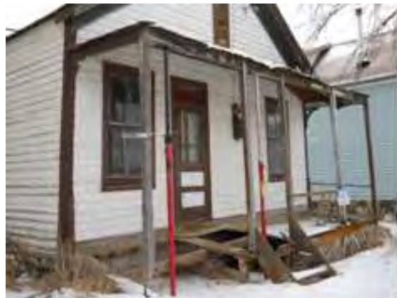
Rotten and unstable front porch