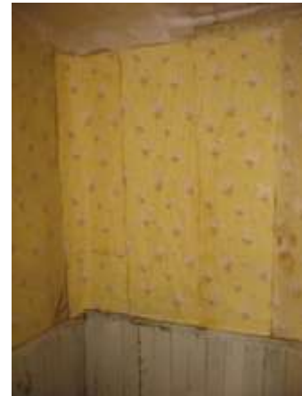
Eastern wall covering and ceiling conservation in kitchen and side room with original paper samples