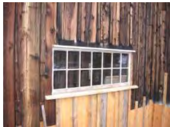
After- board and batten siding is replaced and the old broken window and frame is replaced with a fixed window