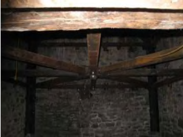
Remove the steel structure from inside malting tower