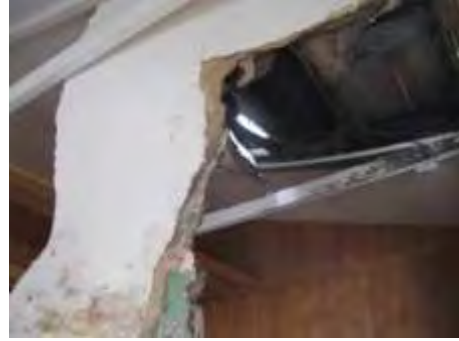
New roof and ceilings needed throughout all the cabins