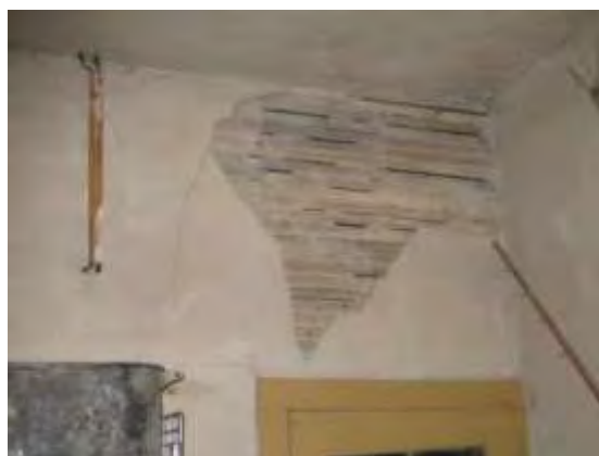
Jewelry Store Outhouse