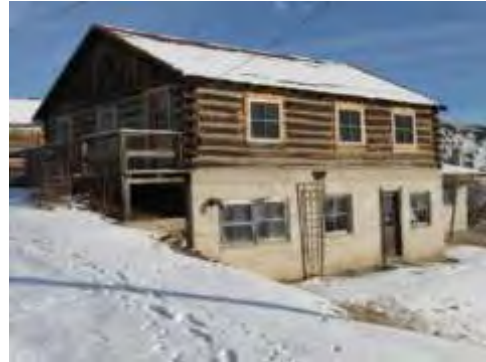
New roof needed