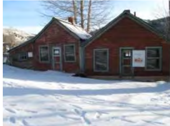
Hotel on the left and Restaurant on the right