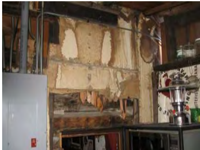
Back room needs to be refinished