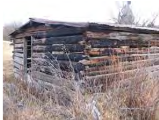
Before – Fire damage to northwest corner, weathered logs, and overgrowth