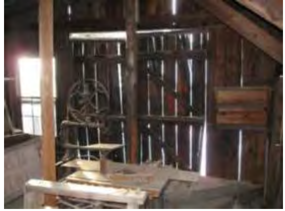
Back doors need to be repaired