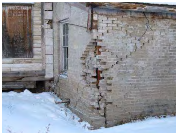
Failed brick on NE corner