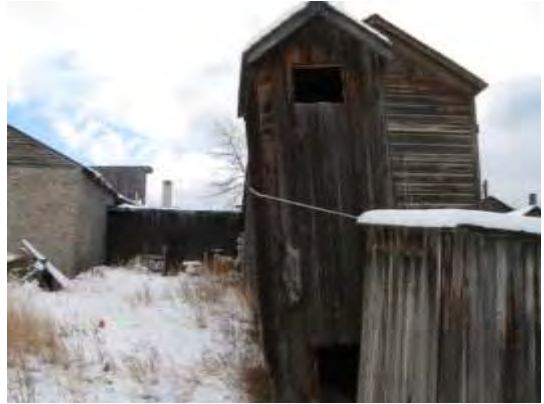
Outhouse needs to be leveled and stabilized