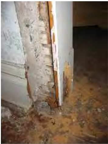
The facing section of wood trim is removed from the opening in the stone portion to gauge the extent of Carpenter ant activity. Damage is visible on the remaining portion of trim where it meets the floor.