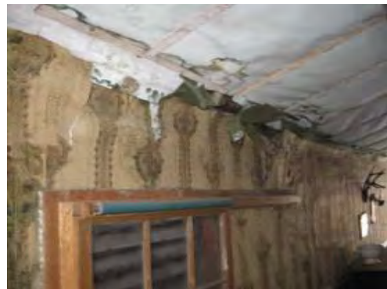
Interior damage from leaking roof