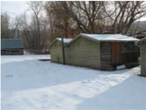
Cabins 9 & 10