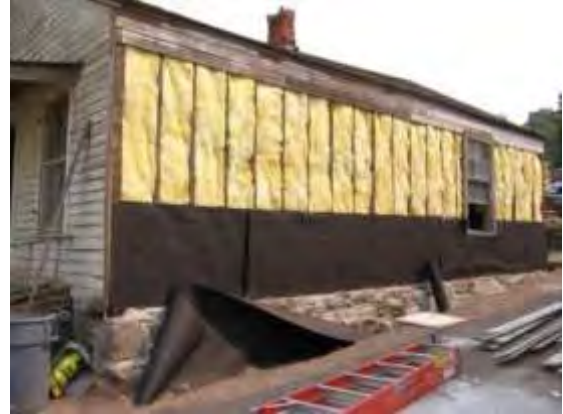
Clapboard siding removed in order to install fiberglass insulation and a felt barrier