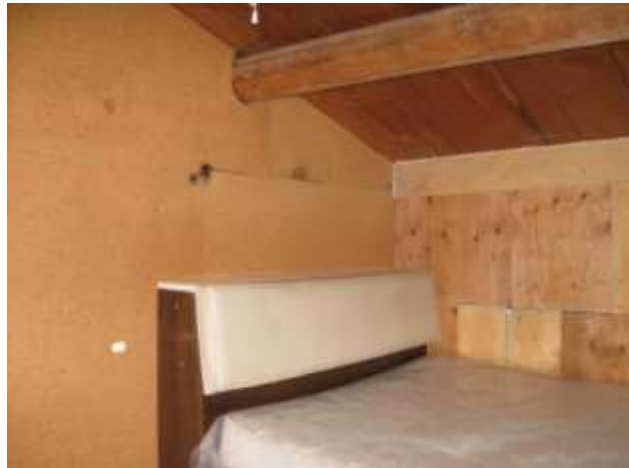
Walls and ceiling need sheetrock