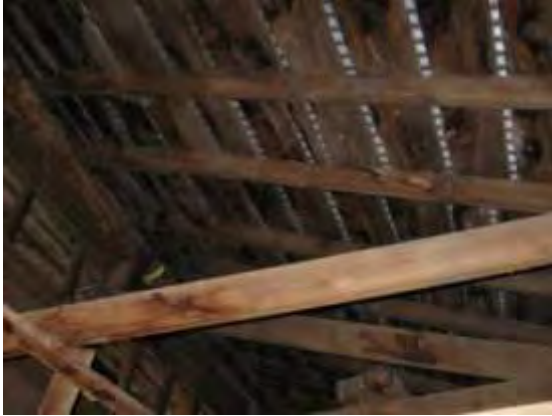
Metal roofing & sheathing will have to be removed to try and pull the deflection out