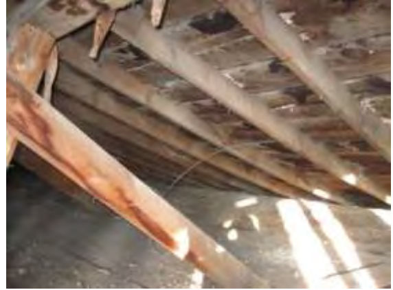
New roof will need to be installed