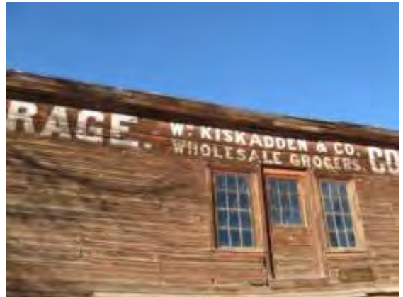
False front is starting to fail on the top. Rotten wood will need to be removed and then framing and planks installed. Siding needs to be repaired or replaced.