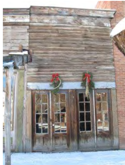
Front of building