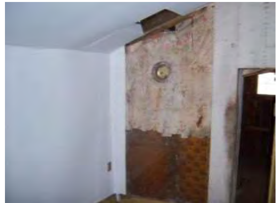
After- 3 rd room walls complete and plexiglass over northern wall to protect historic wall coverings