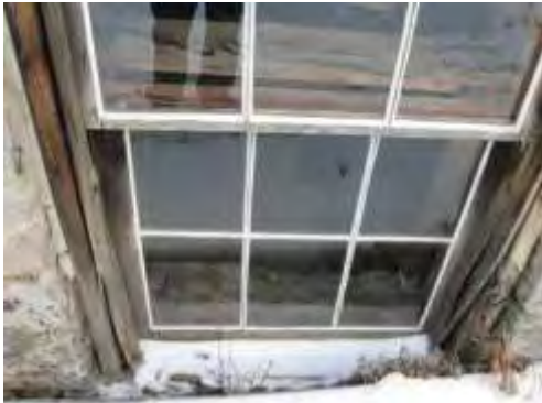
Rotten window sills