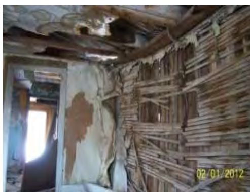
Replace and repair wall