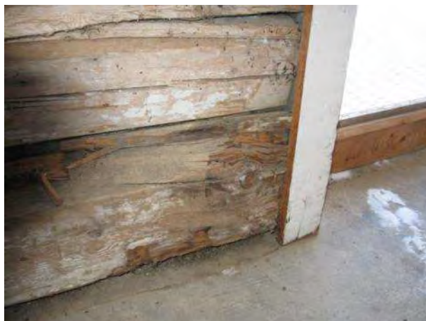
Logs showing sign of deterioration