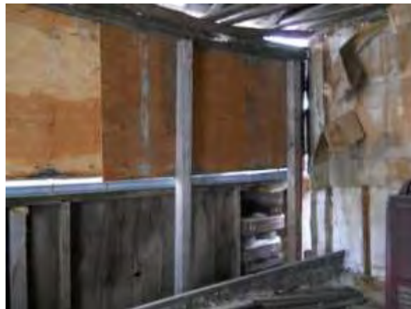
The south interior wall is gone exposing it to the outside elements