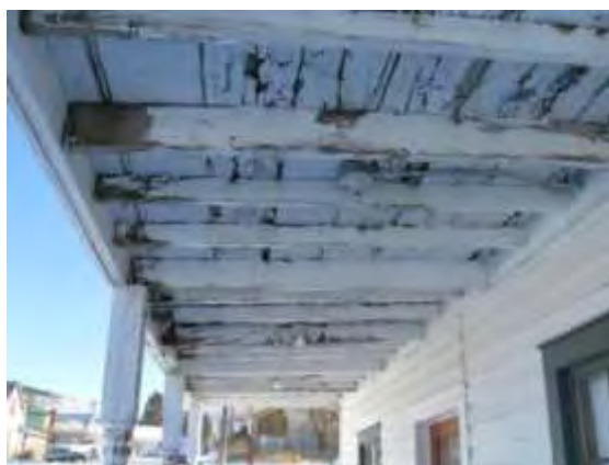
Porch railing and trim needs to be repaired and stabilized