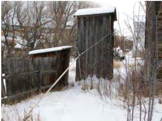
Outhouse held up currently by ratchet straps