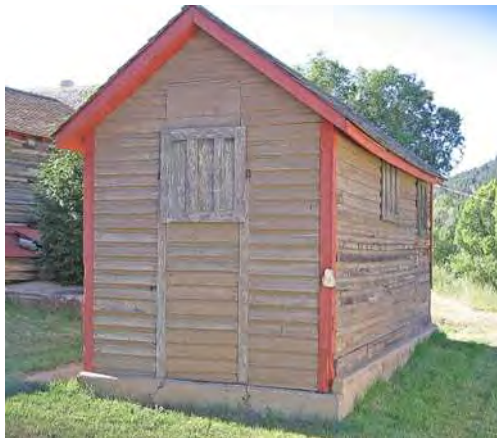
Coal Shed needs new boards and paint