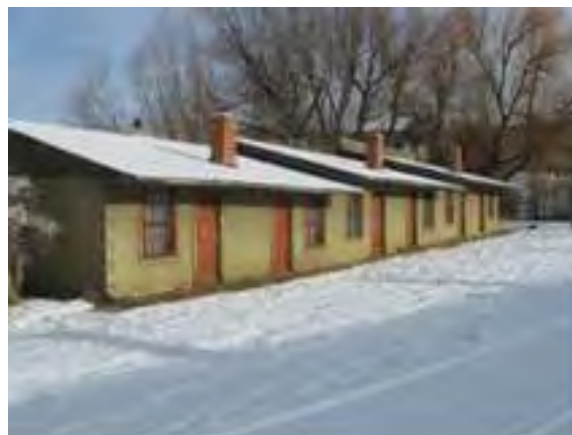
Building on East End (Boys Cabin)