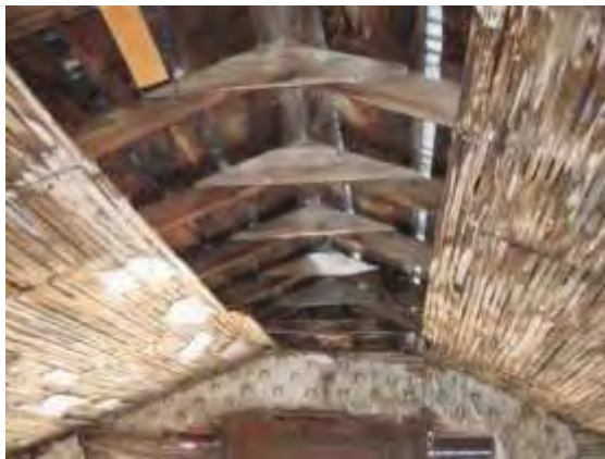
Entire roof framing needs to have new framing sistered to it