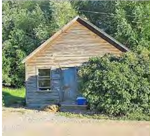
After – North facade after preservation