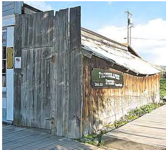
Shingle Shed roof starting to fail