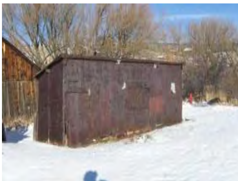
Tin Clad Shed