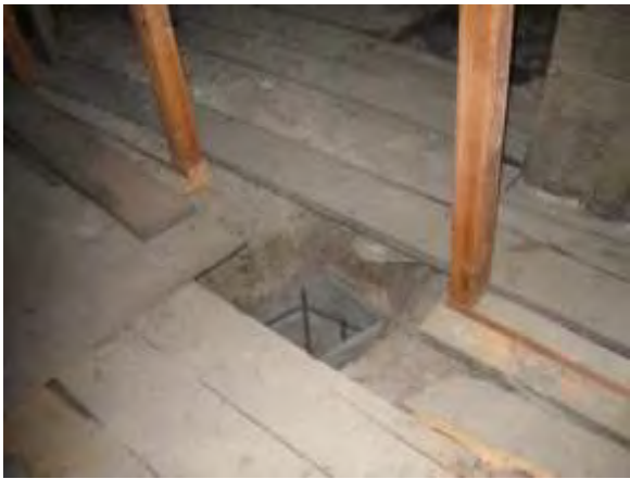
The footings need to be poured for timber framed structure