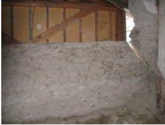
East wall failed