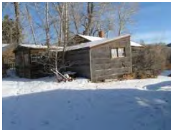
Mutt Dixon House (Costume Shack) – siding needs to be repaired or replaced. Needs door and window preservation