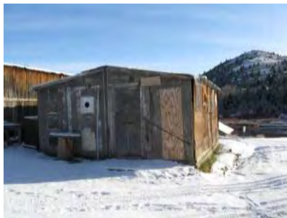
Opera House Shop – Needs to be stabilized and siding needs to be applied to protect the plywood sheathing from further damage. Needs door and window preservation.