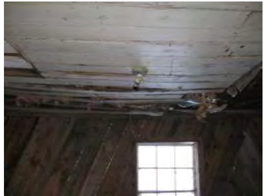
Daylight shows through a wall, along with missing ceiling boards