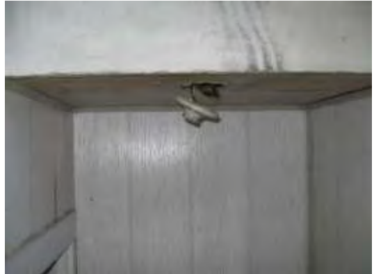
Electrical upgrades needed