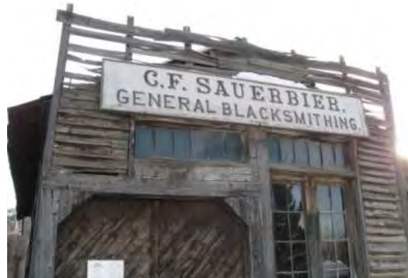
False front needs to be repaired; New Roof