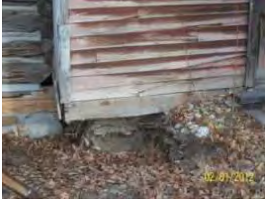
Preserved restaurant side on the left has new foundation and sill logs compared to the right side with no foundation and rotted sill logs