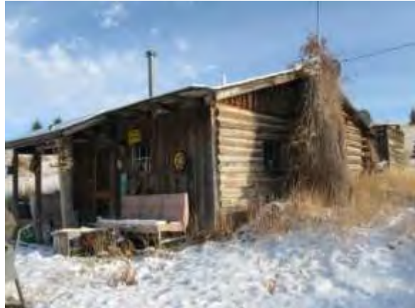
Ron Abbie Cabin