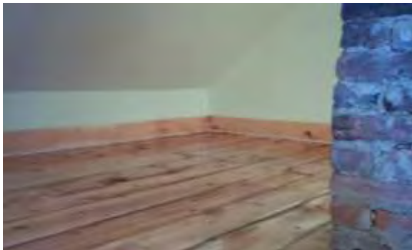
After – finished floor complete with baseboard trim in the loft area