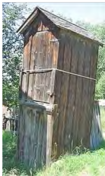
Two Story Outhouse