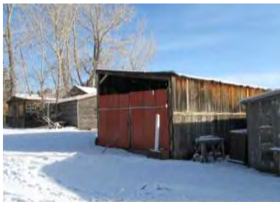
Scenery Shed – Needs foundation and siding applied to protect from further damage