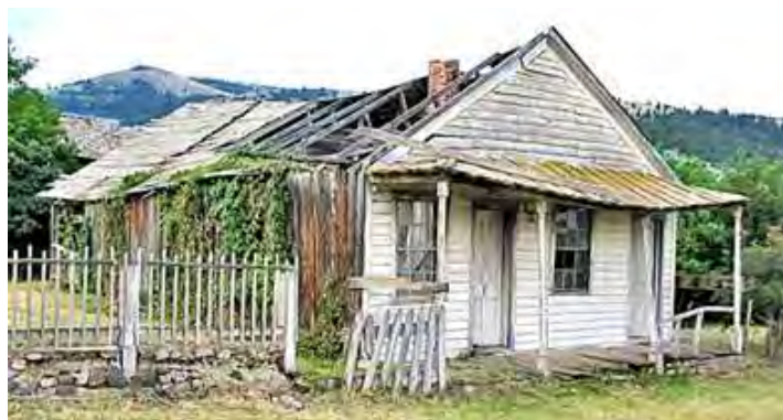
Needs new paint and siding