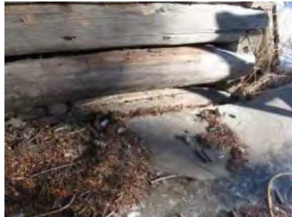
Sill logs are rotting around entire cabin. New foundation is needed