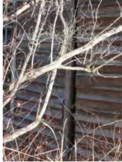
Outside view of West wall separating. Needs to be excavated, new foundation poured underneath building, and stabilization treatments throughout