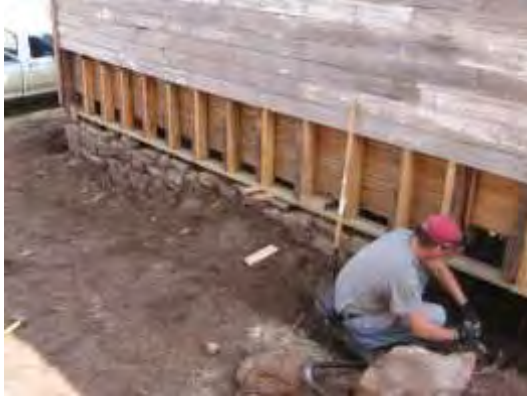
Rotten ends were sistered with new studs around the west and southwest walls of the Daemes House for added strength and support of the original material.