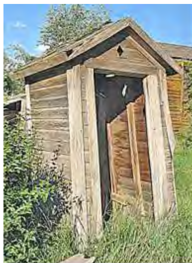
Outhouse located behind the store needs to be jacked up stabilized with timber placed underneath it