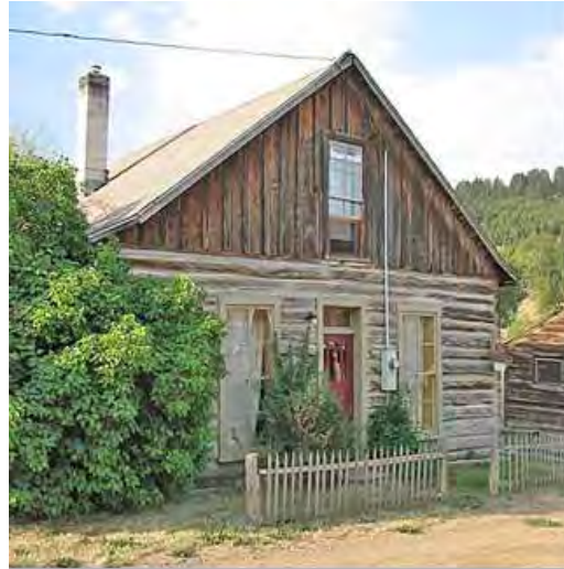
Needs a new roof