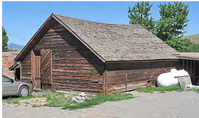
Icehouse behind the building