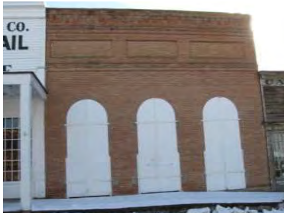
Buford Steel Storage