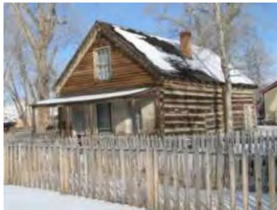
Finney House needs siding repair and oiling