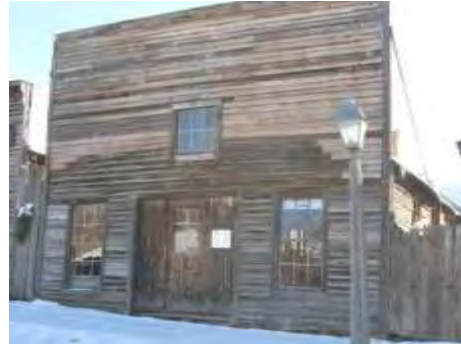
Prasch Blacksmith Shop