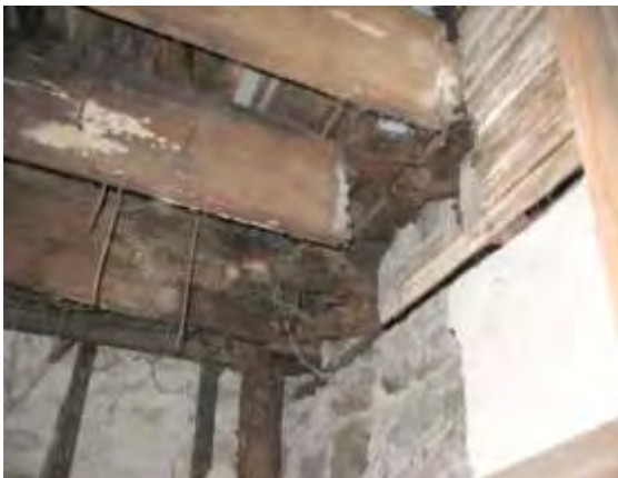
Structural issues inside