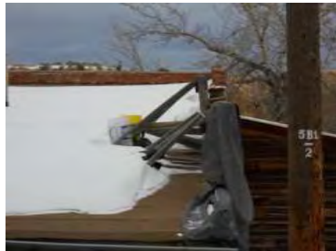
Rubber sheeting and plywood buttresses are employed to keep the brick parapet from collapsing