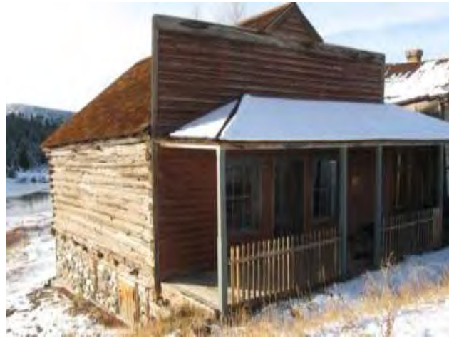
Jack Taylor Cabin