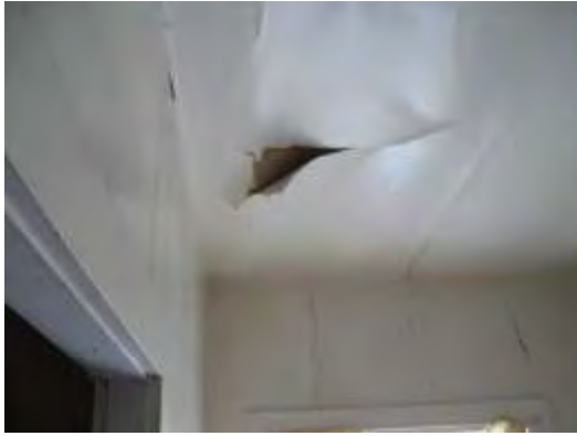
Interior finish work needed