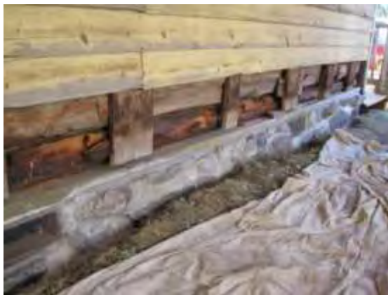
Before – east wall with missing siding