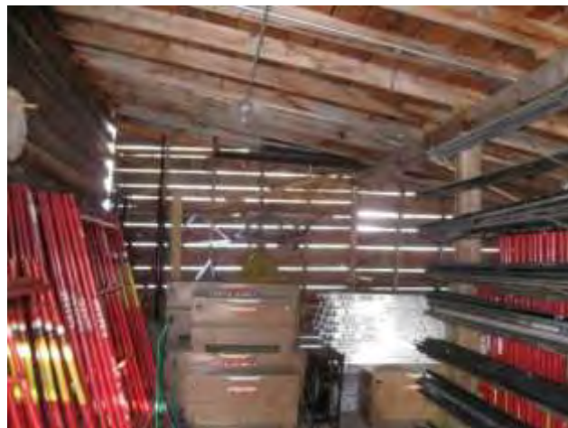
Wall boards need repairing or to be replaced