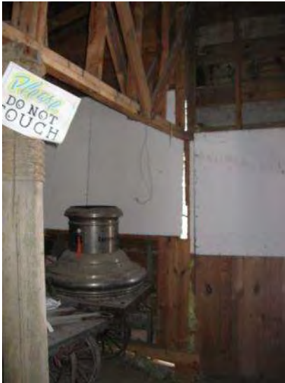
Inside view of the West wall separating due to poor foundation and structural integrity