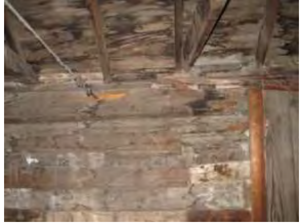
Water damaged to ceiling and walls left deteriorating wall boards.