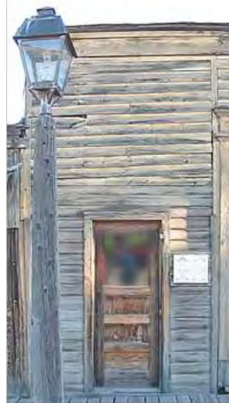
Front of building needs oiling; Needs New Roof