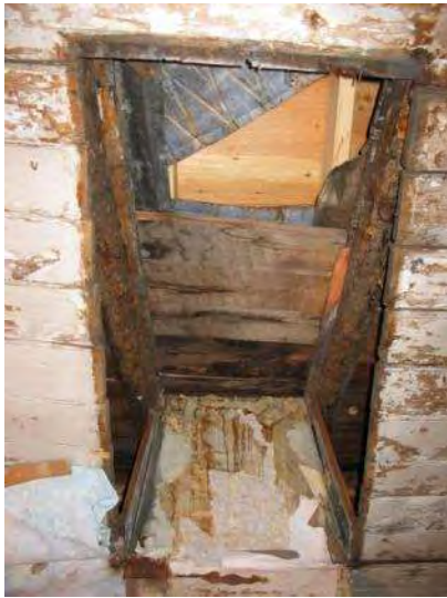
Skylight before preservation work