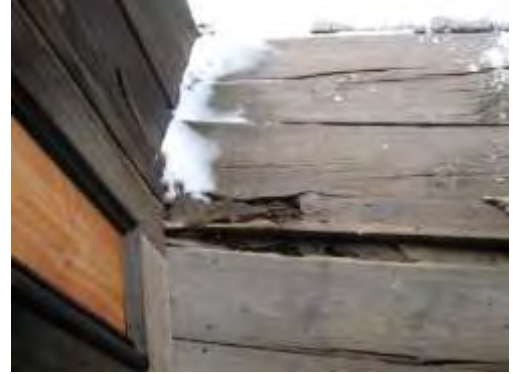
Rotten door threshold