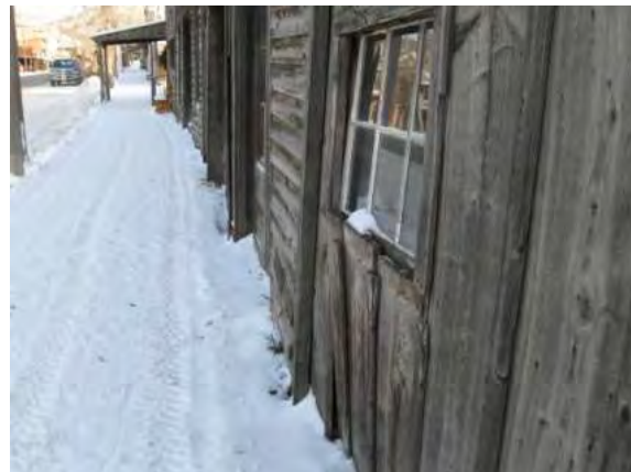
Front wall is starting to buckle out which needs to be stabilized and repaired