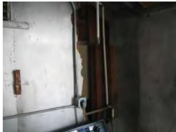
Wall damage needs repair