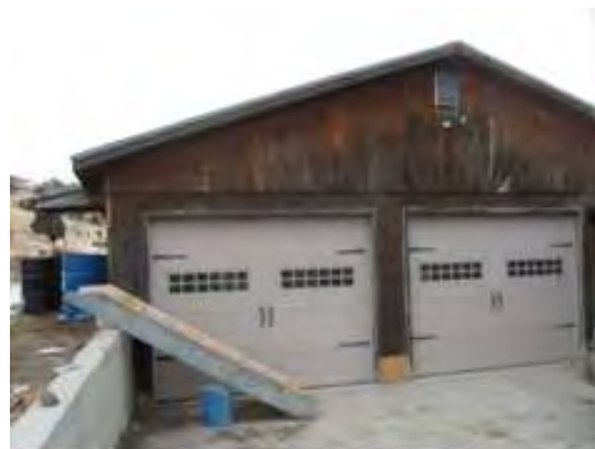
Garage currently used as Preservation Shop