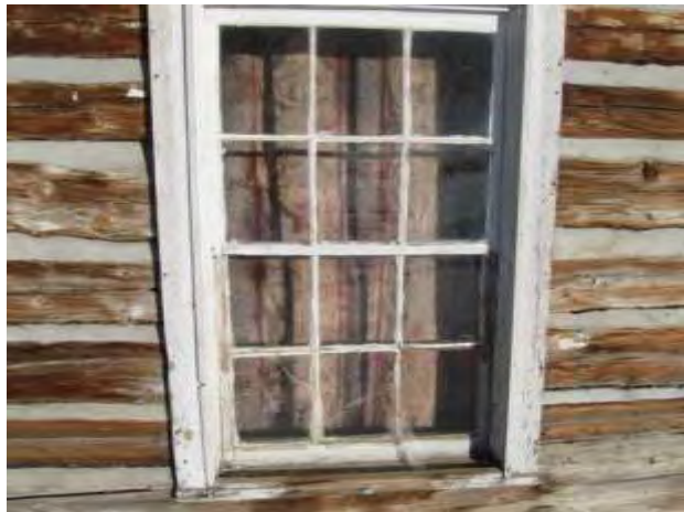
Window preservation needed on all windows