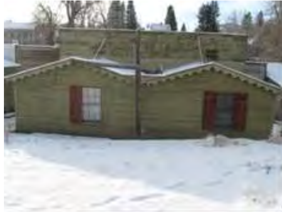
Cabins 1 & 2