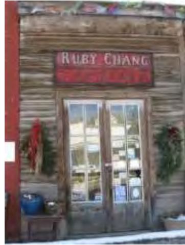
Front of building needs oiling and siding repairs

This building was built by Charlie Bovey as a reproduction of Vetter's Boot and Show Store ca. 1860s. It used to house a fire department display but now houses a jewelry store by a concessionaire.