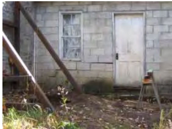
Large cracks on rear façade