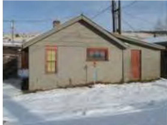
Boiler & Restrooms

Boiler and restrooms were installed with the other Daylight Cabins to replicate Stout Houses which were mass produced, collapsible buildings used for temporary housing during World War II.