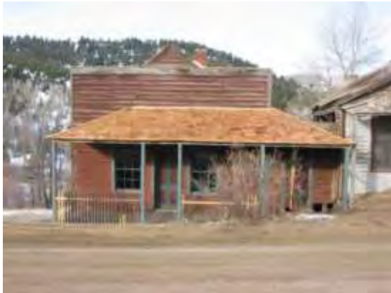
After preservation on porch, porch roof, and windows