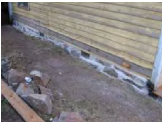
After- east wall with siding replaced and vents installed to provide proper ventilation under the floor space