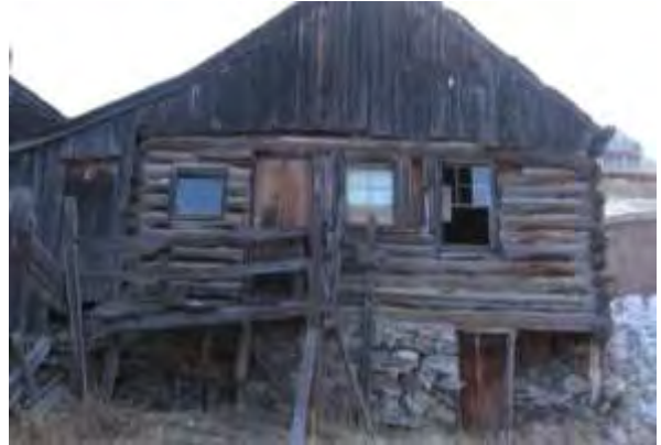
Before preservation on sill log and foundation