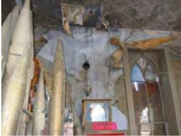
Ceiling & walls need repairs