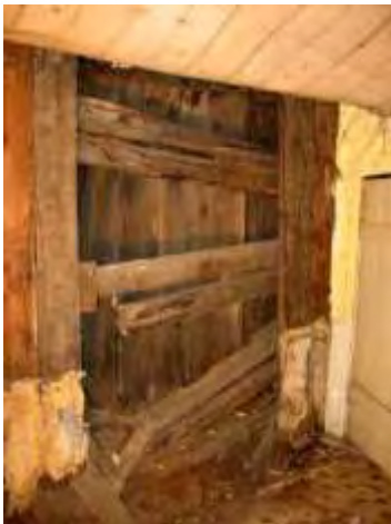
Planks from the eastern wall were removed to reveal extent of damage