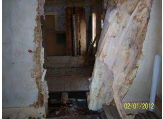
Walls need repair