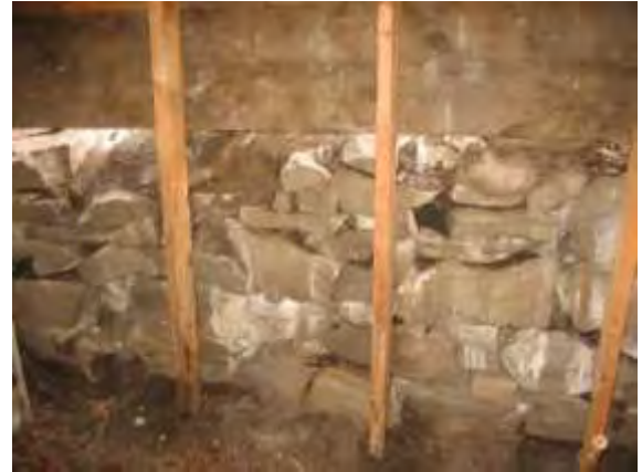
Before – eastern wall of Corbett mud room