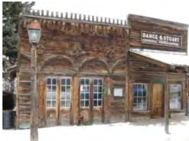
Needs to be oiled

Foundation and log work on front of building needed