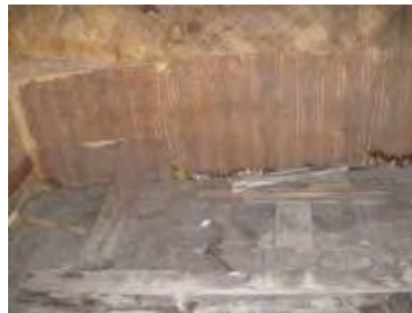
Water damaged walls