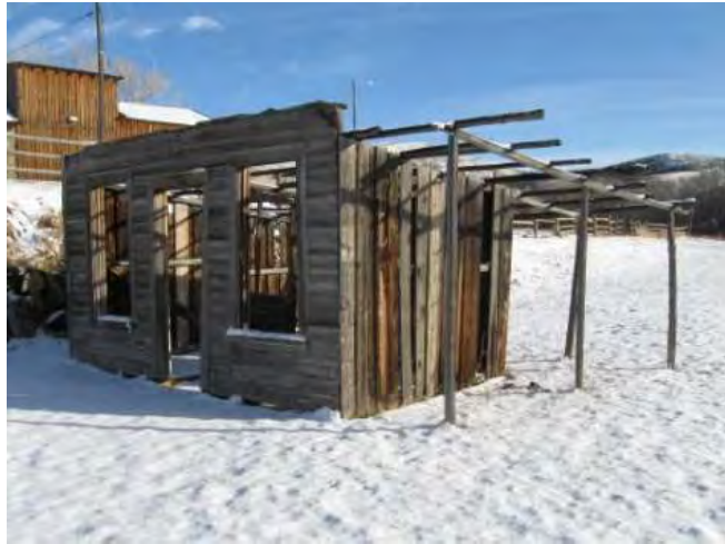
Eventually needs to be moved to its original spot by Bale of Hay Saloon

This building may be the oldest building in town. The mechanical Bakery used to sit on the site between the Bale of Hay Saloon and Sauerbier Blacksmith Shop. It was utilized as a dwelling from 1878-1907. It was gutted by fire in 1983 and moved to this location.