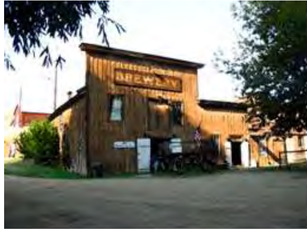
First Brewery in Montana

In 2015 we were able to fix front structure; exterior siding and boardwalk along with some capital improvements with seating; reception desk and electrical replacements.