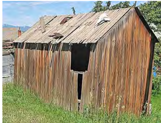
Plank boards on Hickman Shed are deteriorating and need to be replaced