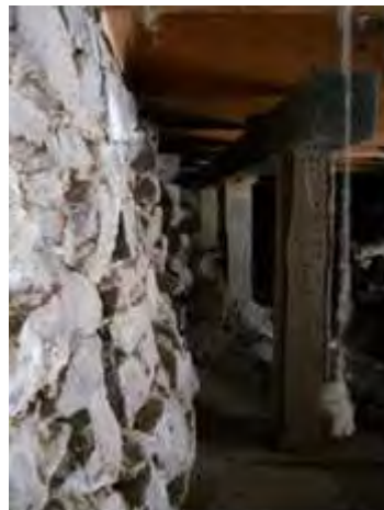
A view of the bowed out interior wall; This is going to be completed in the summer of 2016.