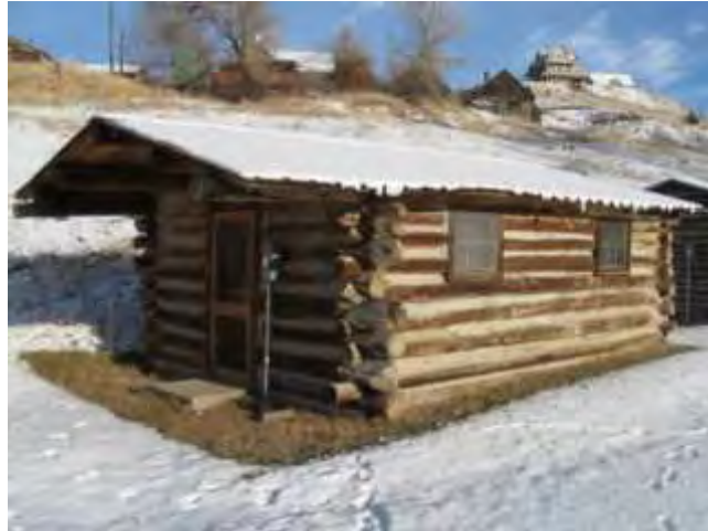
Duck Pond Cabin

Charlie Bovey moved this cabin to its current location from Gilbert Ranch in 1977.