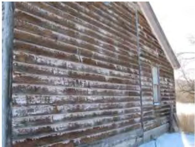
Siding needs to be repaired or replaced and to be repainted