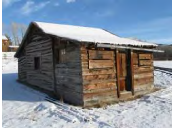
Window and door preservation needed throughout