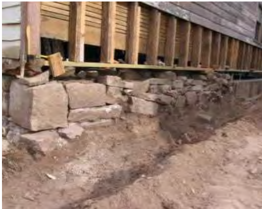
Before – foundation in the northwest corner