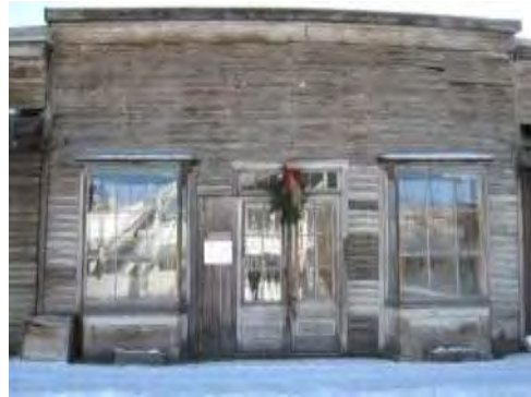
False fronted shop