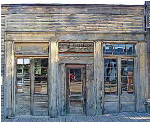
Front of building