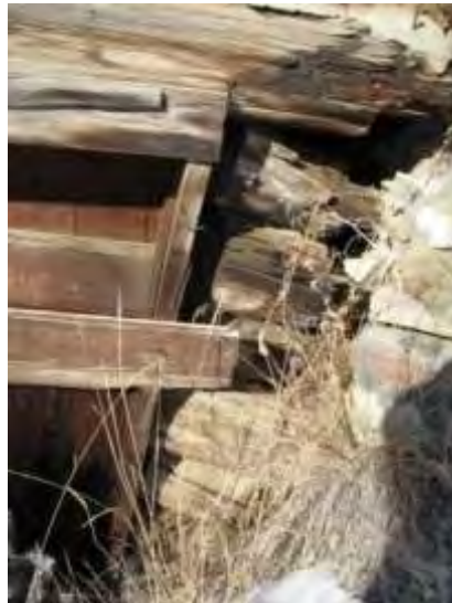
Whole east wall of cabin has collapsed