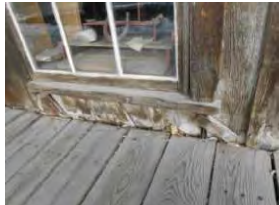
Foundation work needed on front of building