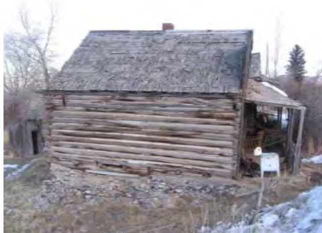
Before preservation on roof and foundation