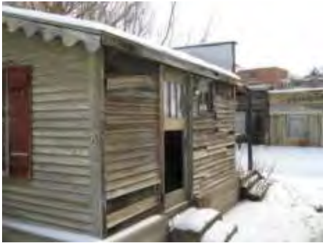
Entire row of cabins needs siding, window, and door repairs.