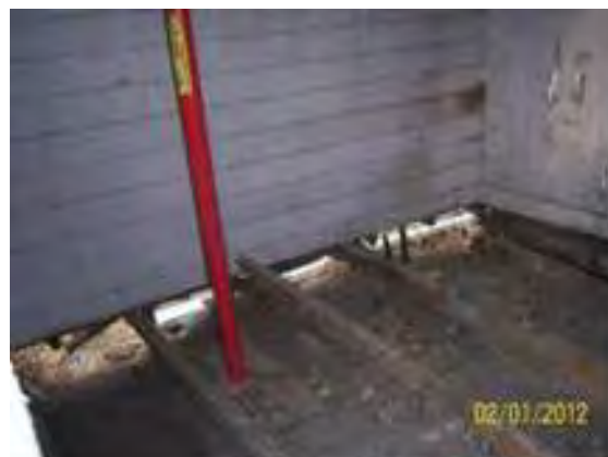
The interior of an addition to the Hickman House sitting on floor joists exposed to the element