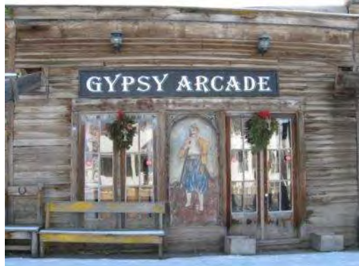
Front of building needs oiling and siding repairs