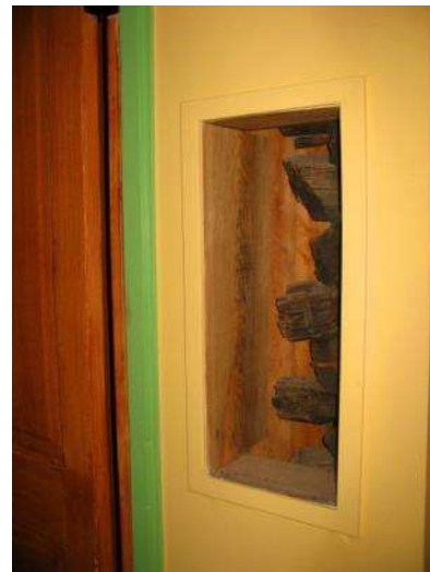
An exposure window was installed in the created doorway to the residences reveals the original, southwest log corner of the Corbett wing