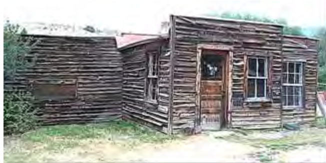
Front of building

Charlie Bovey made Pittman's gas station into a telephone display in 1972.