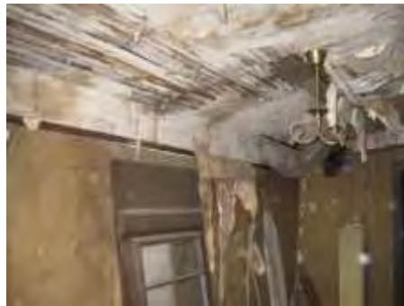
Damaged lathe and plaster work needs to be repaired on ceiling