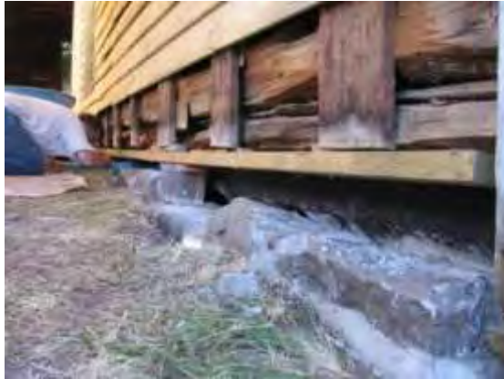
Original stone foundation was discovered on east side. The original foundation was then reset and re-pointed