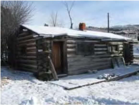
Ford Bovey cabin