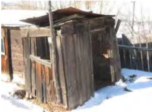
Outhouse. Entire Cabbage Patch needs roof system to be restored or replaced