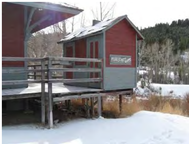
Bathrooms sit on corner of the back porch with little structural support