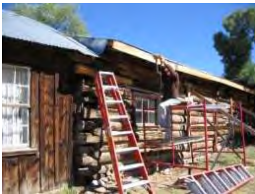
Replacement of rotten fascia boards, log splices and Dutchmen repair was completed to select areas.