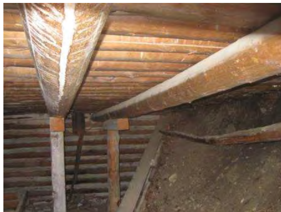
New logs and foundation will need to be constructed