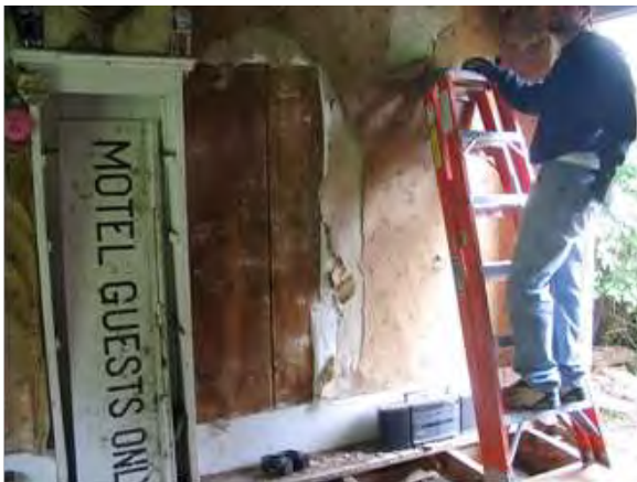
Before- Wall paper falling off, planks exposed