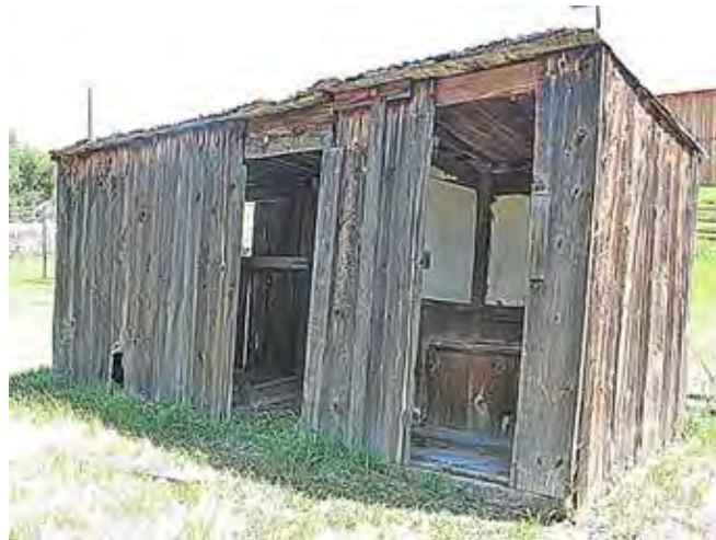
Little Joe's Outhouse