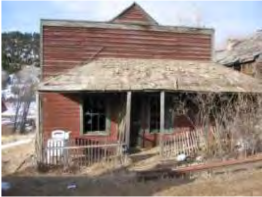
Before preservation on porch, porch roof, and windows