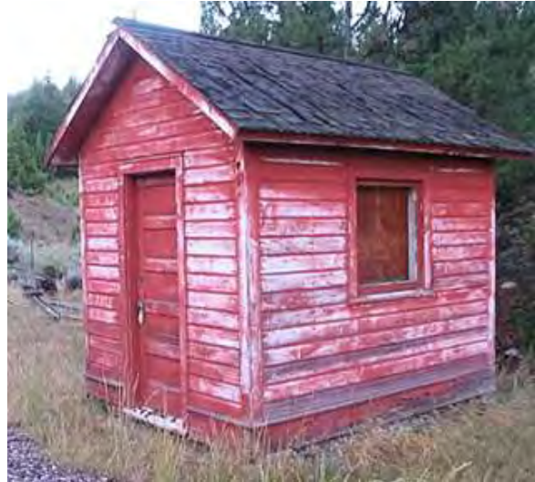
Building sits right near train tracks in Virginia City

This building was probably moved here by Charles Bovey.