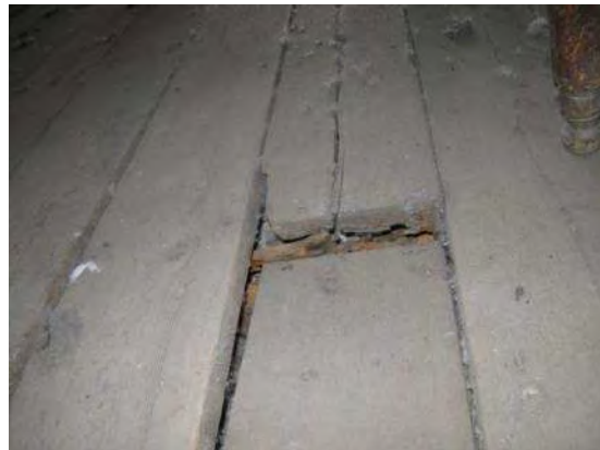
Floor joists are rotting making the floor boards loose and unsafe to walk on