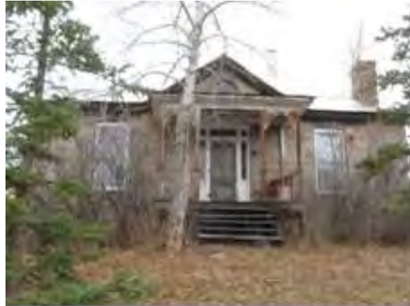
Front door of Bovey House