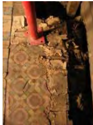
Flooring before preservation