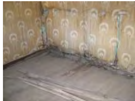
Entire Cabbage Patch needs flooring to be restored or replaced