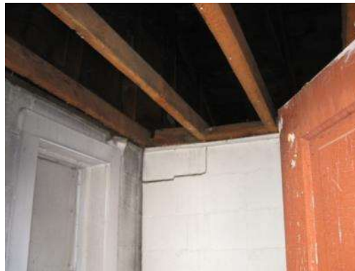
Ceiling boards missing