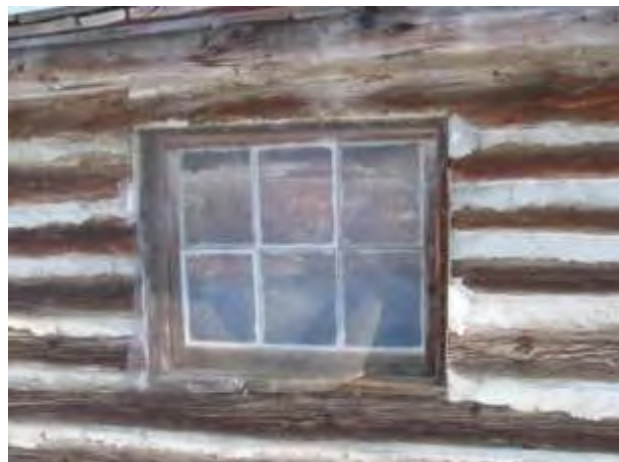
Window preservation needed