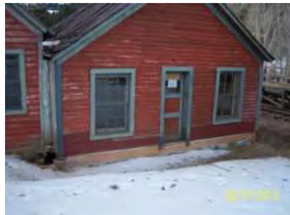
Right Side – "Restaurant" is stabilized and above grade