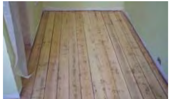
After - Original flooring put back in sanded about to get a finish coat