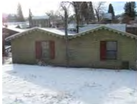
Cabins 3 & 4