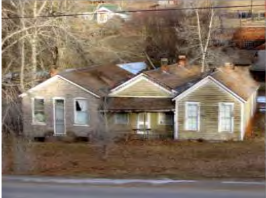
Front view of Gilbert House