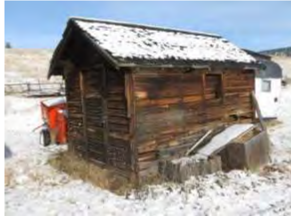
New roof needed

Currently used for storage by the Preservation Crew, the tack shed sits on railroad ties for a foundation.