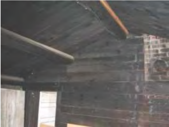
Interior needs to be finished along with plumbing and electrical installed