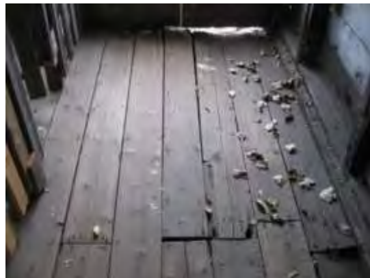
Complete floor replacement needed for display