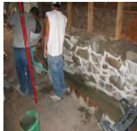
After – eastern wall re-pointed and a new footing is poured to support a new sill and wall studs in the mud room