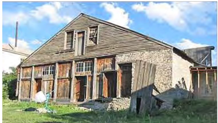
Back of Kiskadden Barn