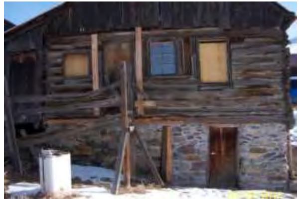
After preservation on sill log and foundation