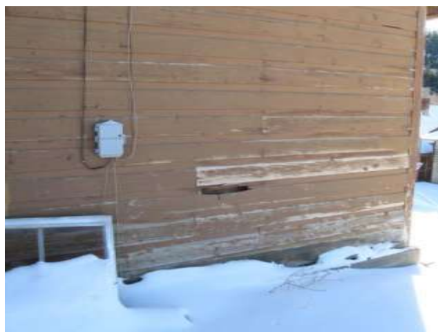
Siding needs to be repaired or replaced