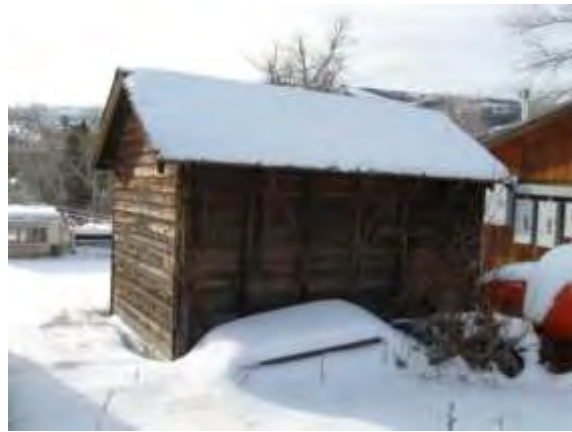
Needs siding repair and replacement