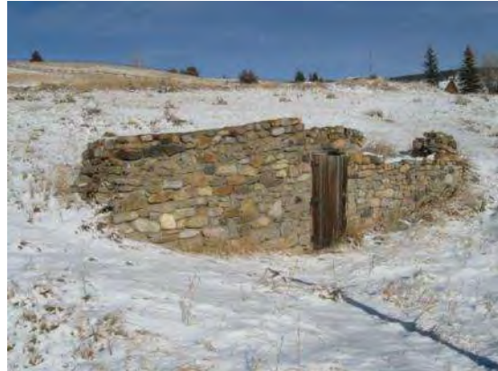
Located in the far front yard of the Bovey House