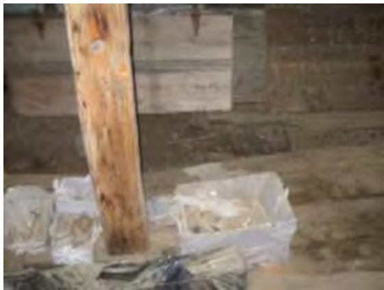
Floor boards need to be repaired or replaced