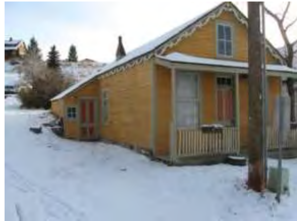
Corbett House Completed