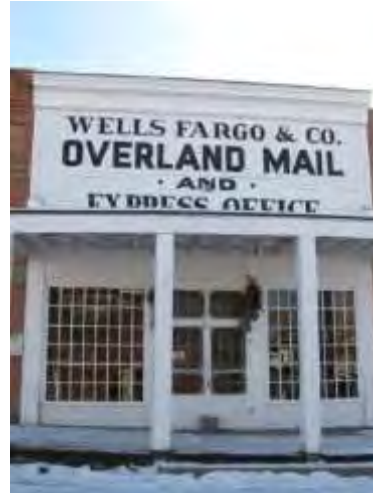
Wells Fargo Coffee House