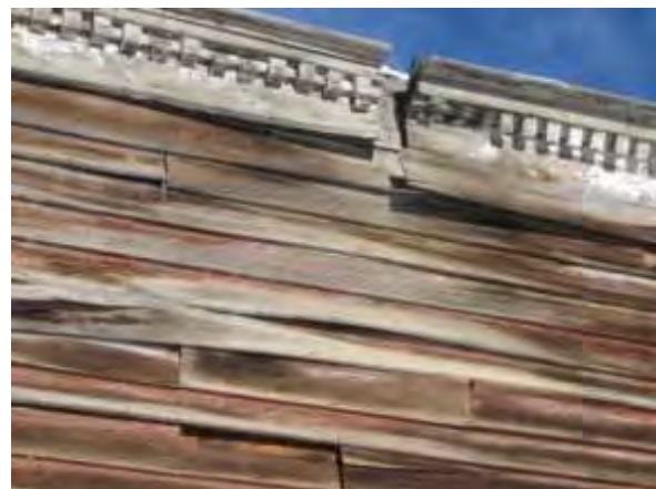
Decorative cornice pieces failing and separating from building

(Please see 2015 MHC Annual Report on the progress of this project)