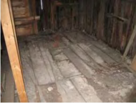
Floor needs replacement