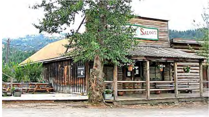
Back & Front porch needs repair