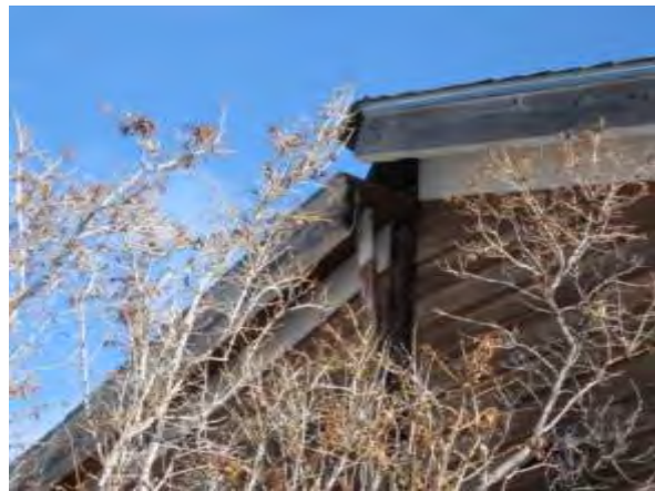
Roof line has separated