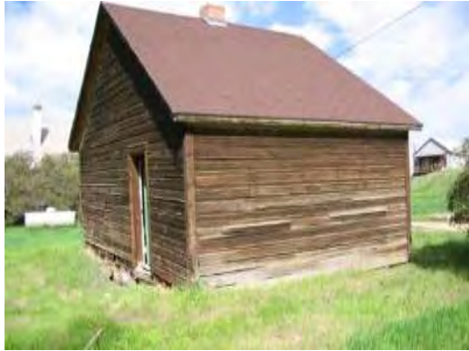
Before -Southeast corner, below grade