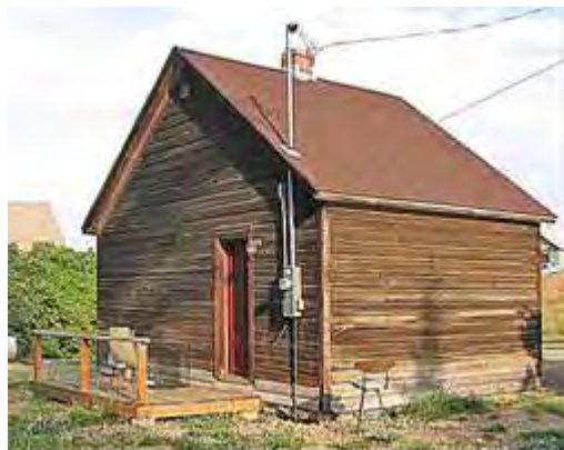
After – Southeast corner, new foundation