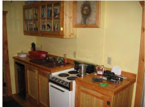
After – kitchen area finished. Cabinets built by Preservation crew and the chimney is left covered in Plexiglas as a “window in time”