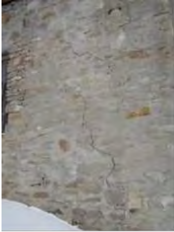
Cracks are already appearing on the outside above where the section of stone has failed in the basement