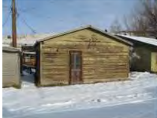
New siding and new roof needed