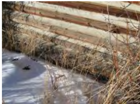
Needs to be excavated for foundation