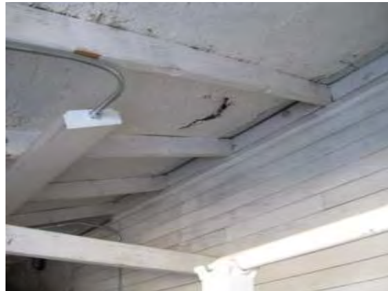
Ceiling damage from a leaking roof