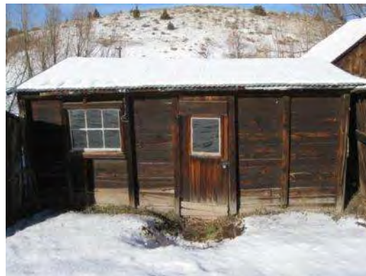
Shed with display