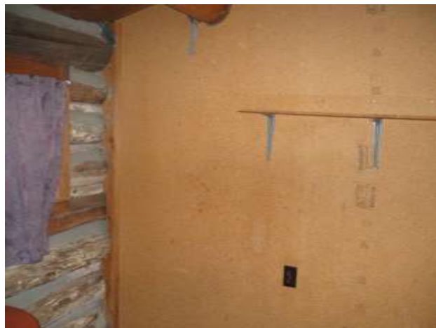
Walls and ceiling need sheetrock