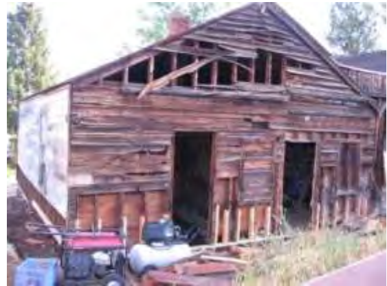
Before- critically deteriorated siding along the south façade was removed for insulation to be installed and replacement of siding