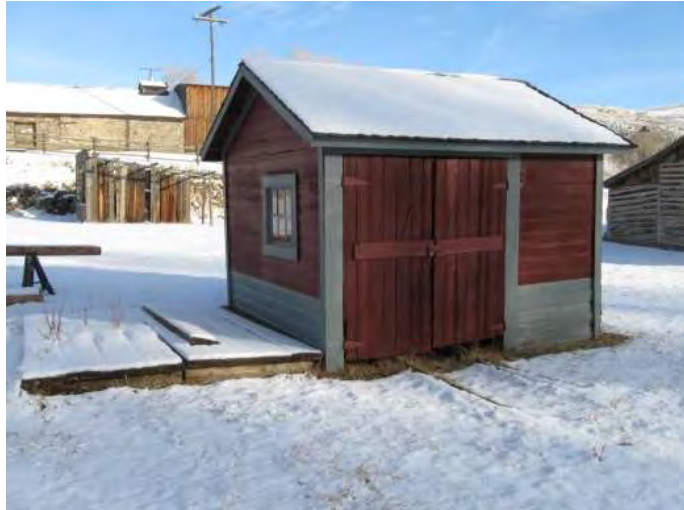
Motor Car Shed