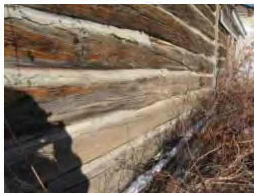
South side logs starting to show signs of deterioration