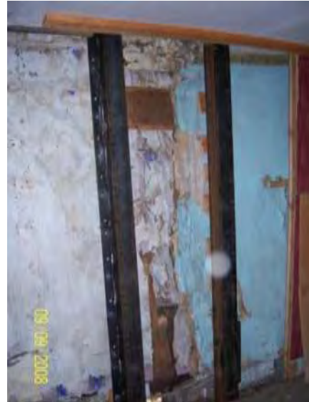
Steel bracing installed on east wall