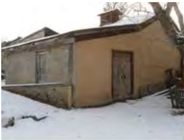
Located right next to the Brewery