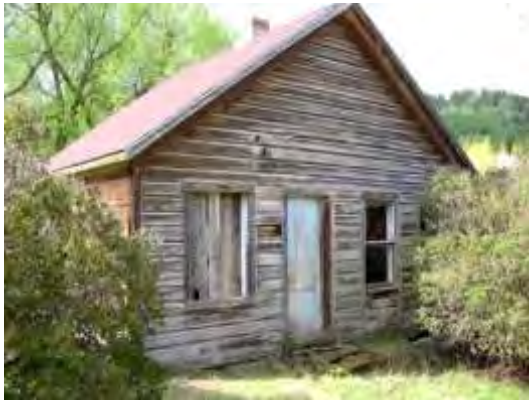
Before – North facade