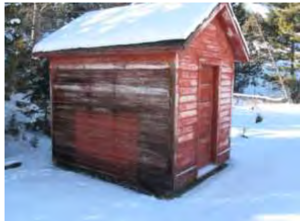
Needs to be jacked up and timbers placed underneath