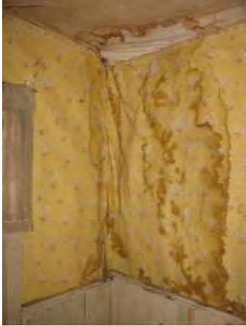
Water damage to the eastern wall and ceiling in kitchen and side room