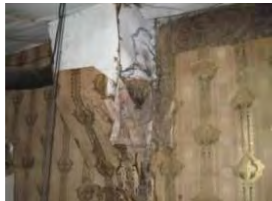
Interior wall damage needs repair and a new roof