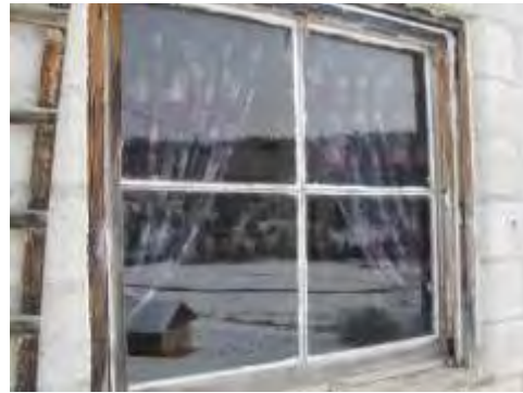
Lower level needs window preservation