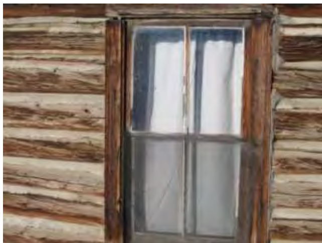
Window preservation needed