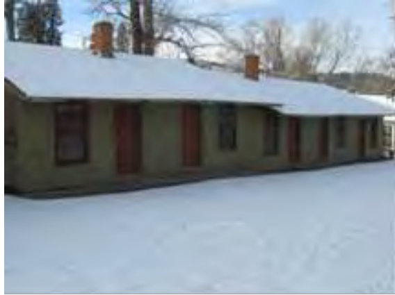
West Building No. 25-28