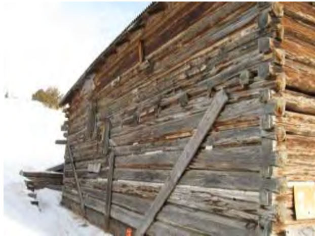
Needs daubing finished