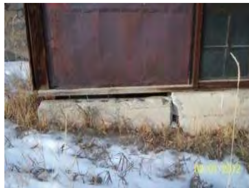
Structural issues with the foundation