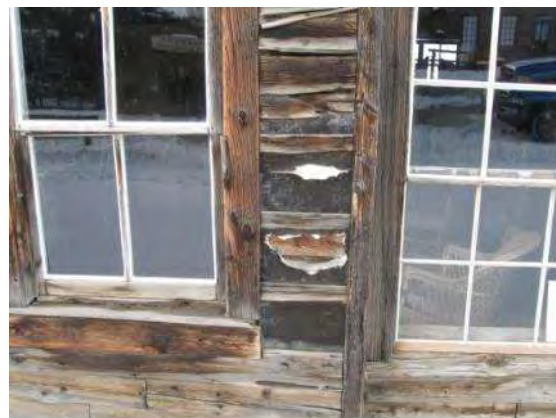
Deteriorated lap siding needs to be replaced