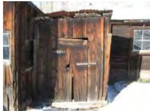
Shed East of Barn