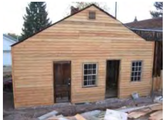
After- siding was replaced and attic vent and new windows have been constructed and installed