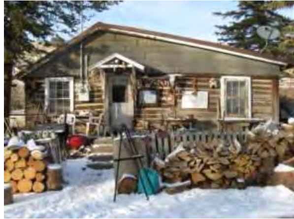
Ford's Old House