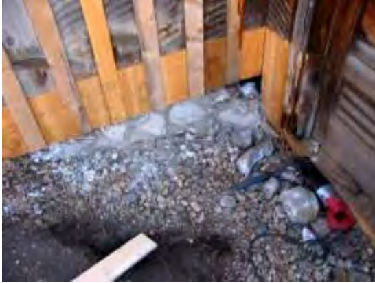
Deteriorated building material which was damaged from ground water issues and an elevated grade was replaced. A short French drain is employed to direct water away from an inside corner.