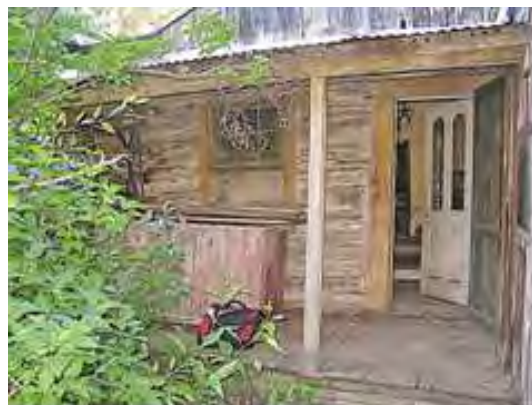
Back porch – Foundation work needed