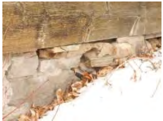
Foundation work needed