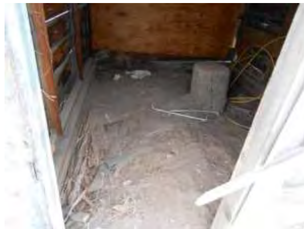
Needs a floor