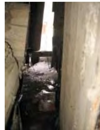
Narrow alleyway between the McGovern and Strasburger stores had long provided a pathway for water and ice to intrude into the interior spaces of both buildings