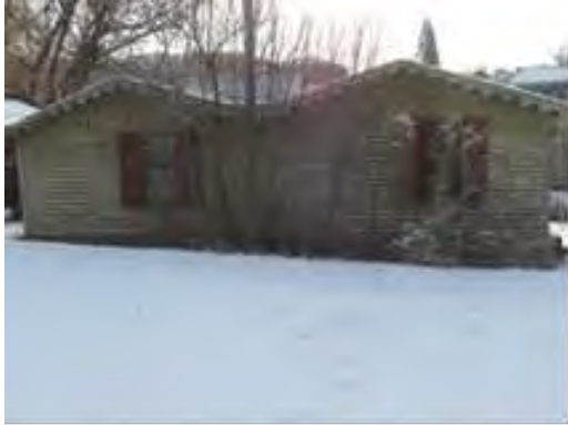
Cabins 7 & 8