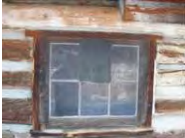
Window preservation needed