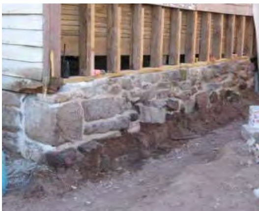
After – northwest corner after re-pointing and new concrete grade beam