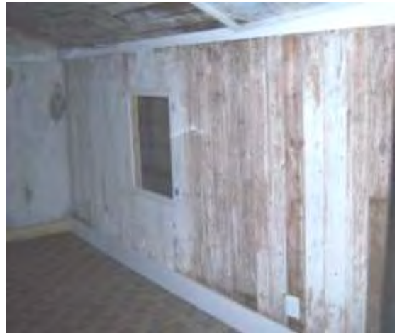
After- Finished look of western wall. Plexiglass window installed to see logs