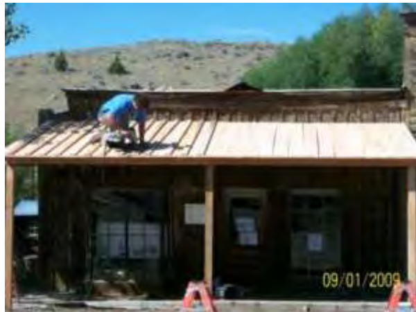
New awning installed in 2009