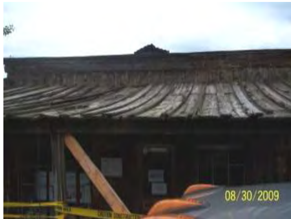
Before awning preservation