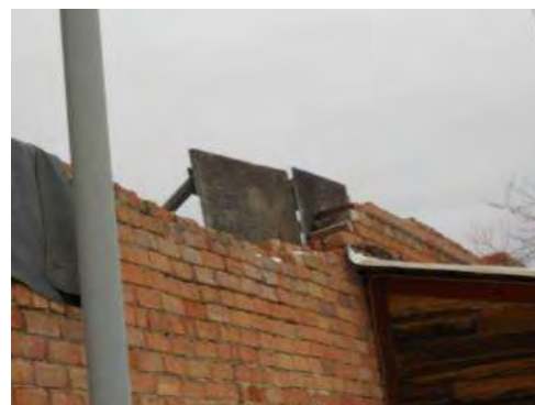
This structure need to be re-paired with masonry work.