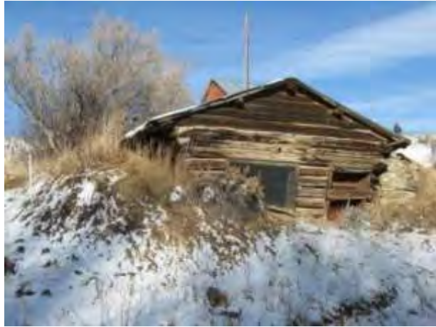
The entire cabin must be excavated from hillside