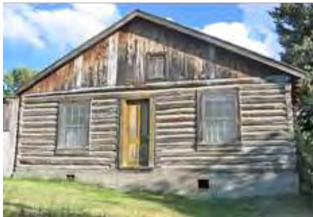
Back of building