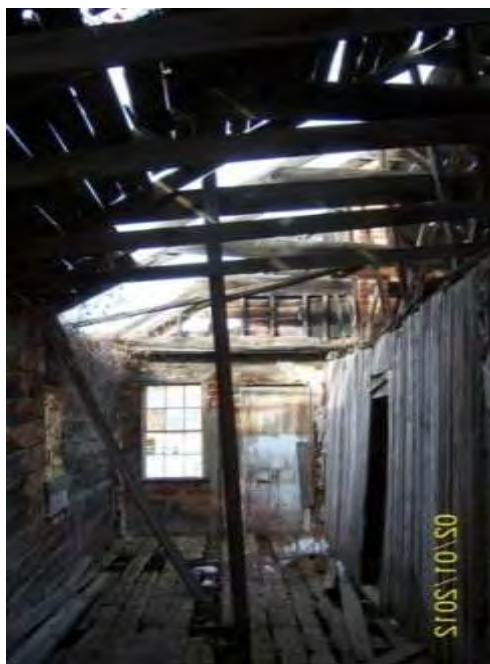
Repair collapsed roof and replace flooring