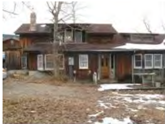
New roof needed