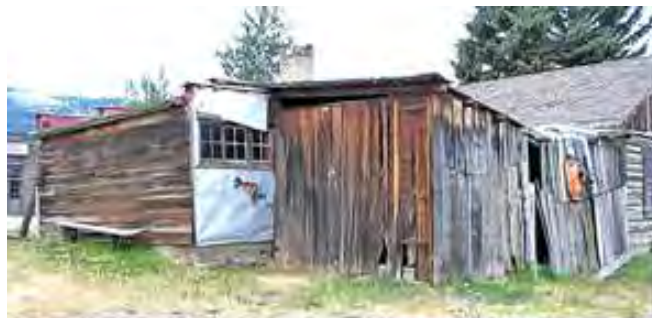
Back of Gas Station & Shed