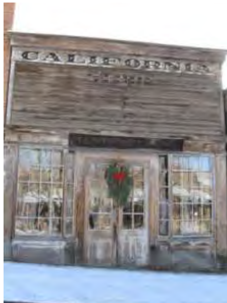
Needs some siding repair and to be oiled