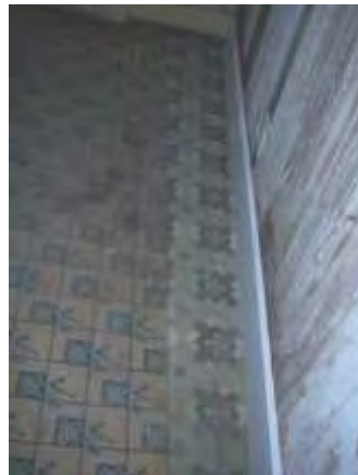
Flooring after preservation