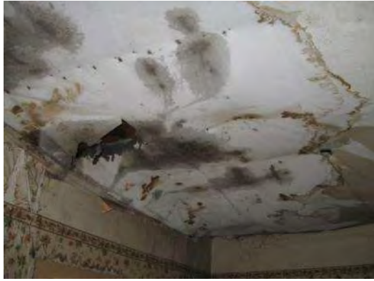
Rotten and moldy ceiling coverings