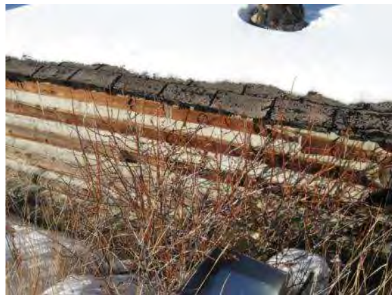
Rotten sill logs need to be replaced