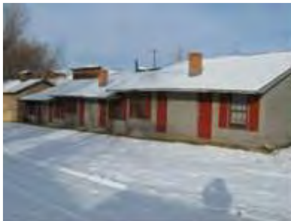
Building by Pottery Shop (Girls Cabin)

(See detailed information on the 2015 MHC Annual Report)