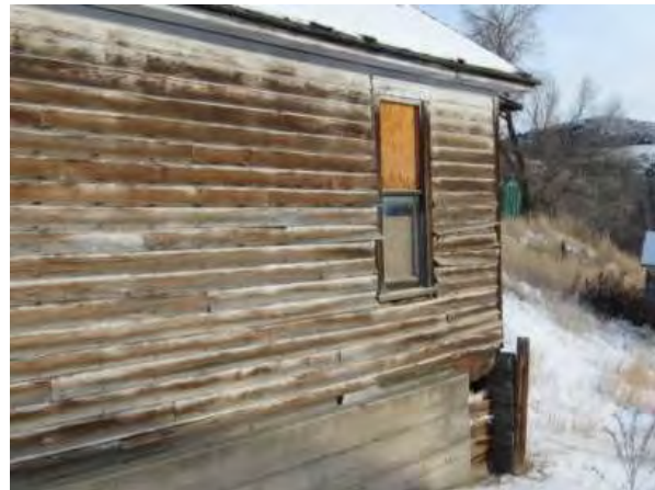
Window preservation needed