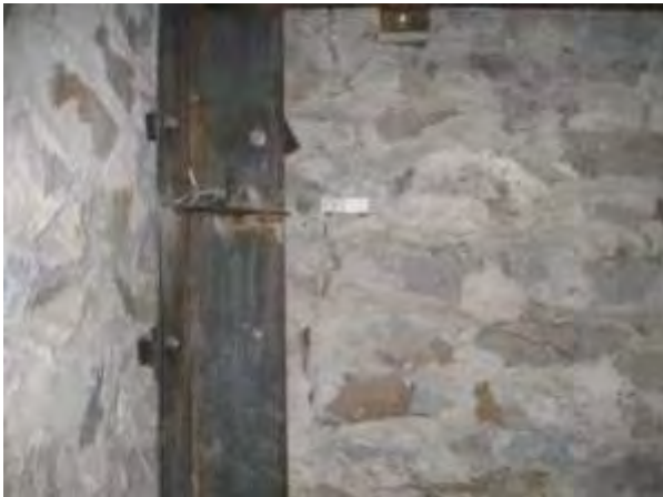
Repoint the cracks