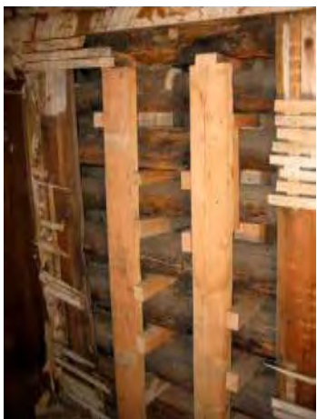
Portions of the damaged historic lath and select vertical planks are removed to provide access to the original splice point of the log members and allow for the installation of a vertical support and cleat system