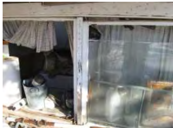
Window Preservation needed throughout