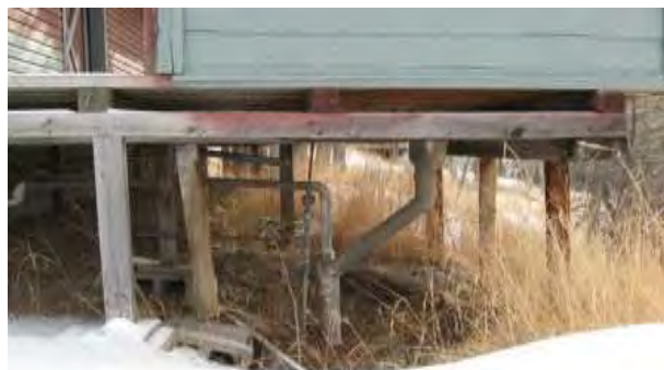
Plumping upgrades were completed in 2015 and the structure will be repaired during the 2016 year.