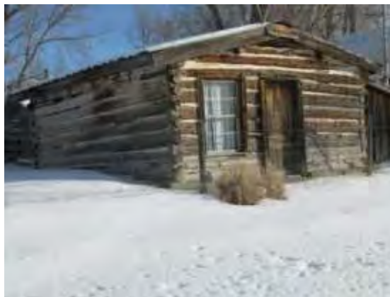
Finney Summer Kitchen has rotting logs that need to be replaced