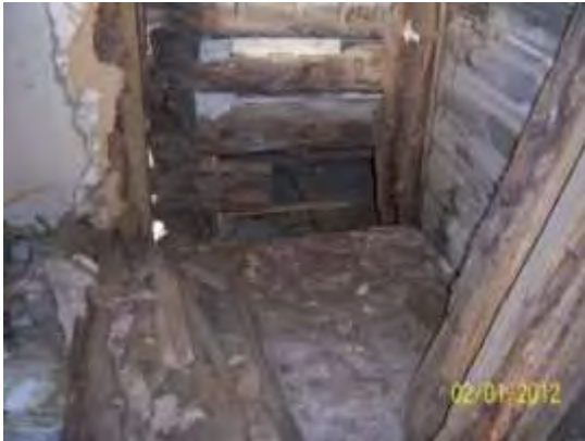
Flooring needs to be replaced