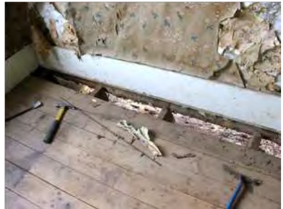
Before- Tongue and groove flooring