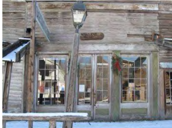
Front of building