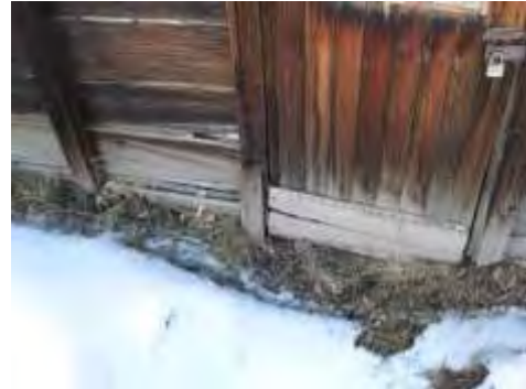
Entire Cabbage Patch needs to be excavated for foundations.