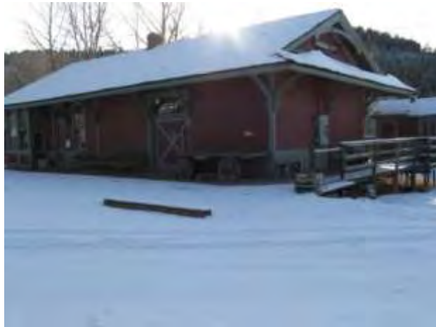
VC Depot is a high traffic area during the summer season