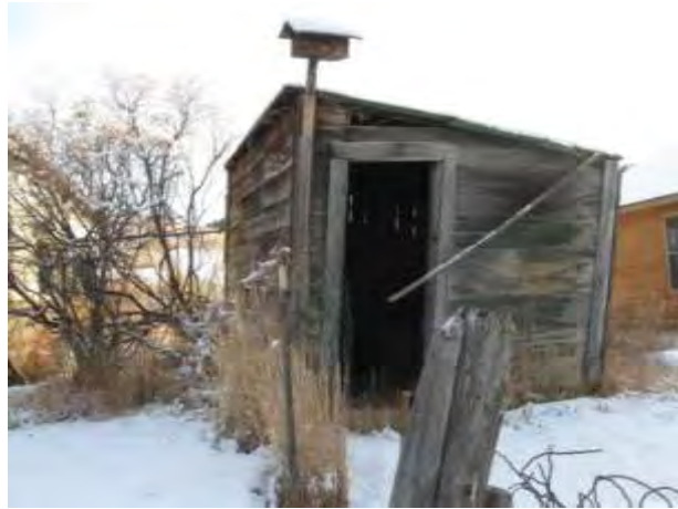
Coal Shed needs to be stabilized