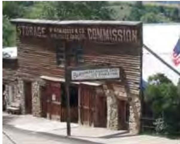
Kiskadden Barn street view