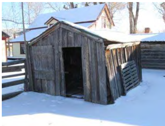
Frame Shed in Finney Yard