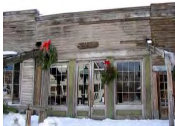
Exterior wood needs oiling

CMU wall Needs to be excavated and stabilized