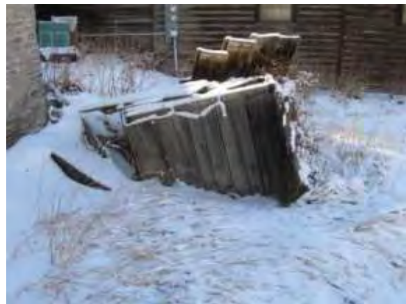
What is left of the outhouse in back of barn