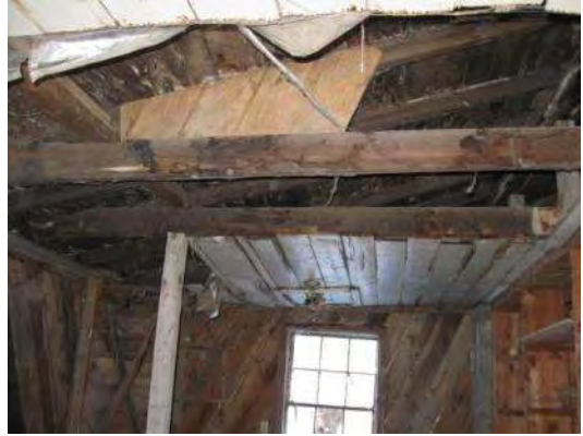
Ceiling boards damaged and missing