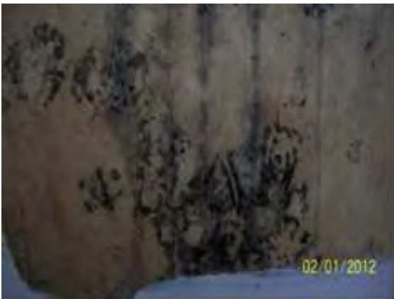
Black mold on the wall