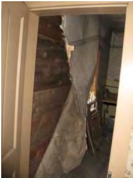
Failing wall coverings