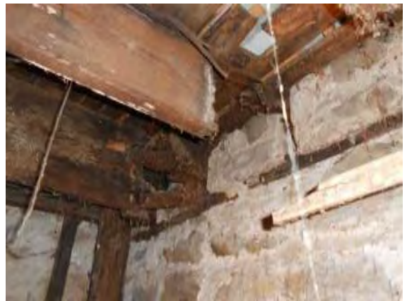
Major structural repair needed to ice house