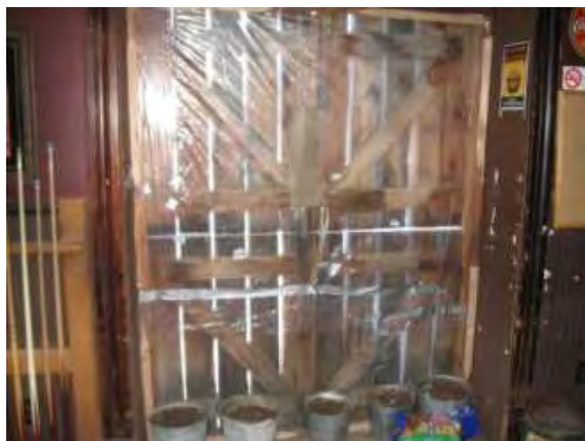
Door and window preservation needed