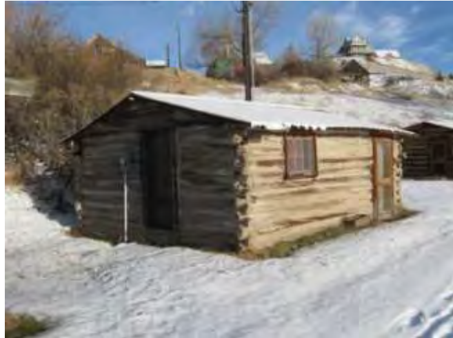
Iron Rod Cabin

Charlie Bovey moved this cabin to its current location from Iron Rod in 1977.