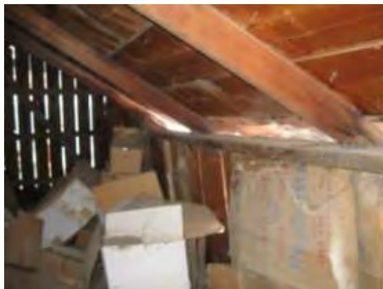
Roof needs to be stabilized and repaired