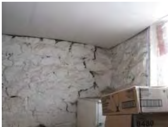
Stone walls need to be repointed