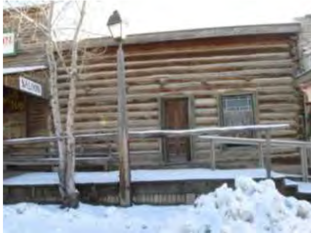
Exterior logs need to be oiled