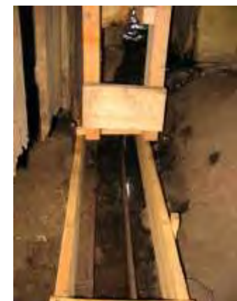
A new footing system was created to stabilize the eastern log wall and to assist in diverting moisture from entering the alleyway