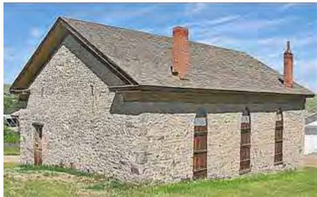
New roof needed