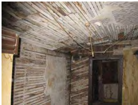
Damaged lathe and plaster work needs to be repaired on walls