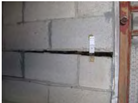
Crack monitor placed on rear façade shows growing displacement at an alarming rate