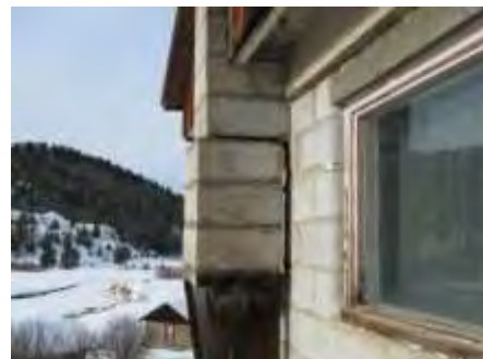
Chimney on the south side of building needs to be stabilized