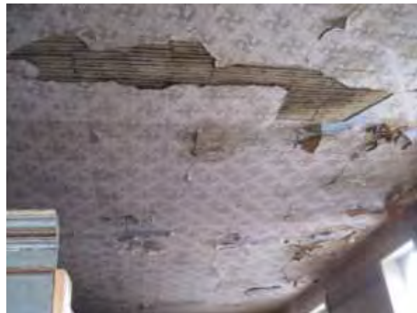
Lathe and plaster ceiling failing due to roof leaking