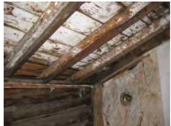
Before- 3 rd room had had severe water damage