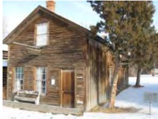
Dr. Byam House