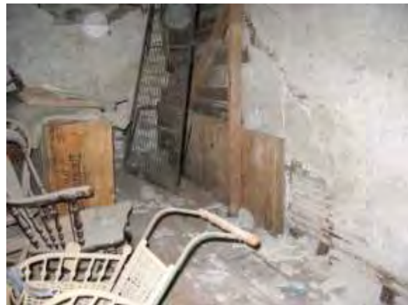
Interior damage to historic lathe and plaster