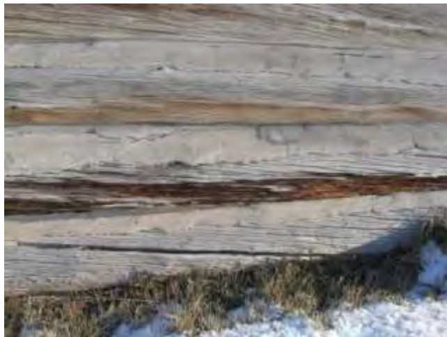
Logs showing signs of deterioration