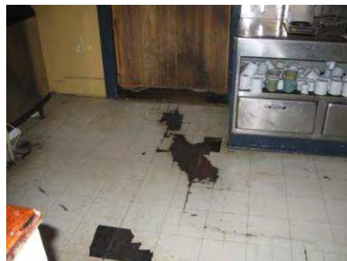
Floor replacement needed throughout

MHC preservation crew is in process of redoing all flooring; heat and electrical upgrades; Appliance repair and painting of the exterior and interior. The project should be completed by May of 2016. Please refer to our web-site at virginiacitymt.com and 2016 MHC annual report for details of completed project.