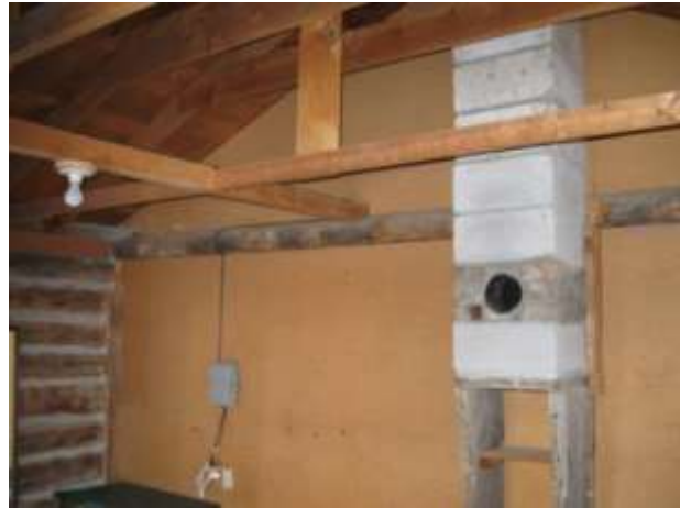
Walls and ceiling needs sheetrock