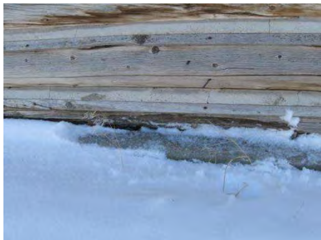
Sill logs are rotting and need to be replaced along with the foundation