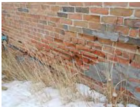
Repoint brick wall