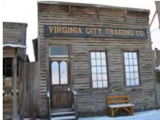
Needs some siding repair and to be oiled