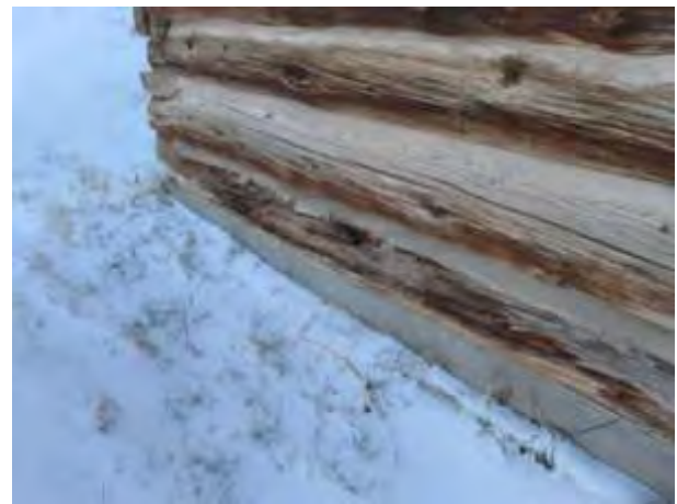
Logs showing signs of deterioration