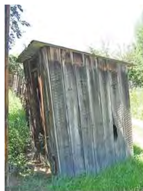
Ground Floor Outhouse