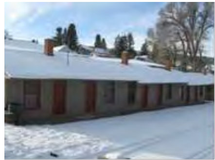
East Building No. 33-38