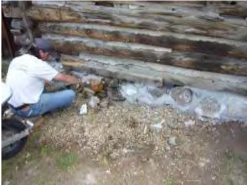
An improved foundation system and a drainage system was installed for the west wall.