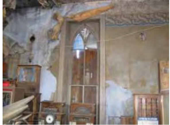
Window preservation needed