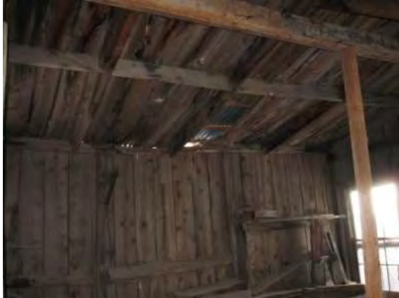
Roof boards need to be repaired or replaced