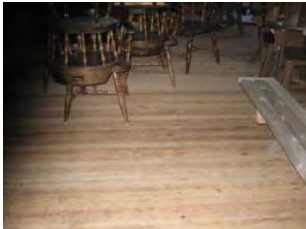
New floor needed