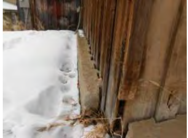
Foundation and sill work needed