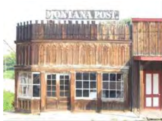
The Montana Post received structural repair and exterior siding and boardwalk replacement in 2015